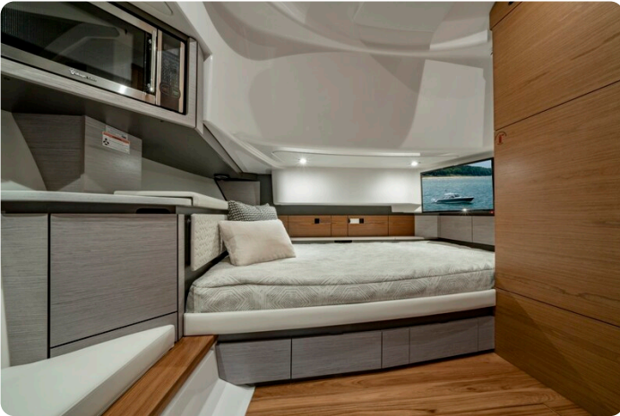
Tiara 43LS cabin