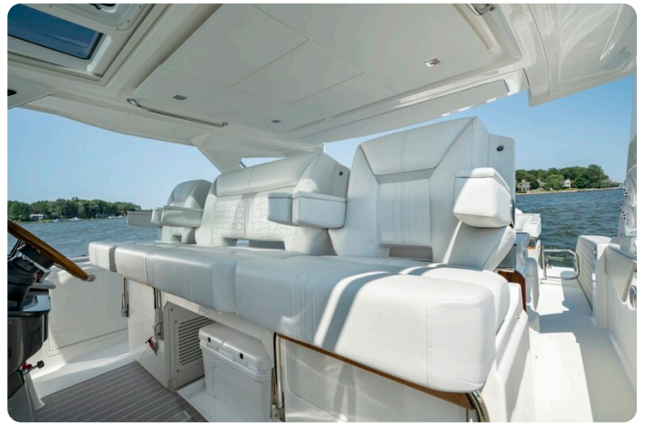
Tiara 43LS helm seats