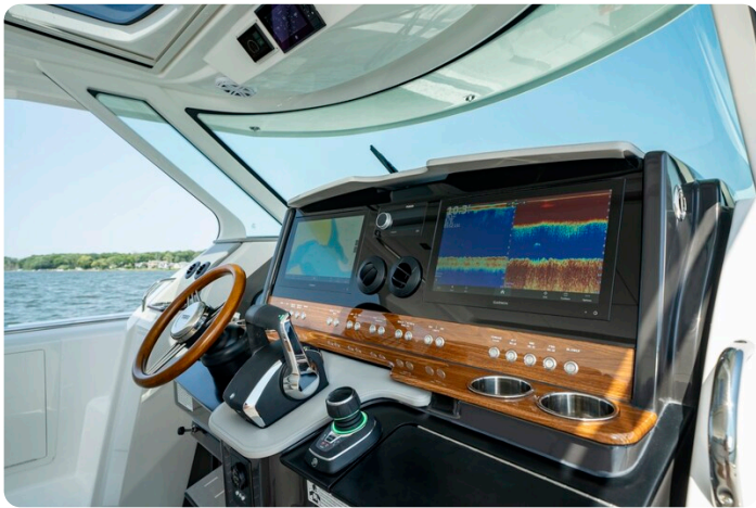
Tiara 43LS helm station