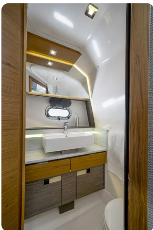
Tiara 43 LS bathroom