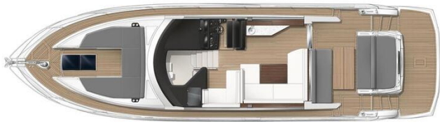
PRED50 main deck