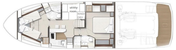
PRED50 lower deck w. utility room