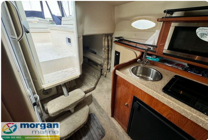
Rinker fiesta vee 250 boat - galley and steps to cockpit and quarterberth