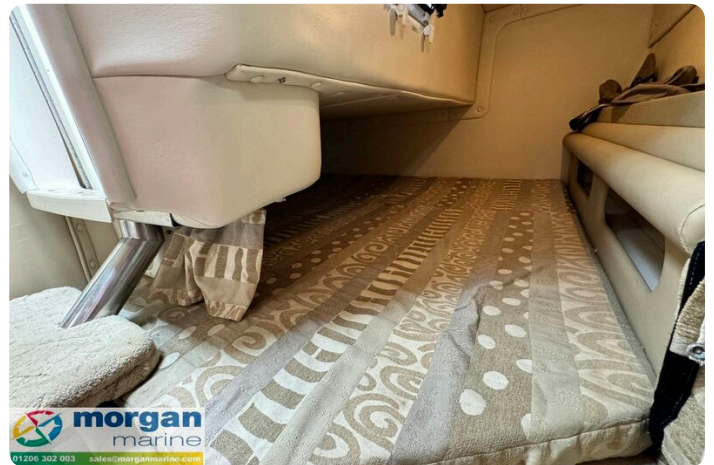
Rinker fiesta vee 250 boat - aft berth