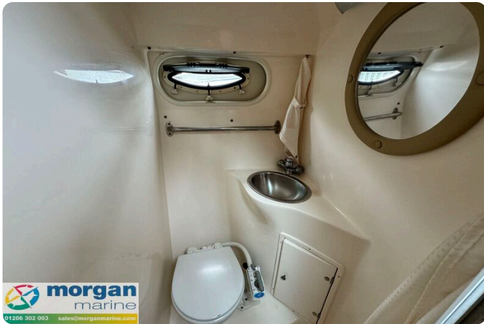
Rinker fiesta vee 250 boat - toilet compartment