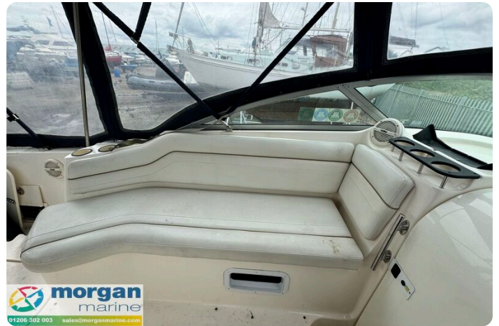
Rinker fiesta vee 250 boat - cockpit sun lounger