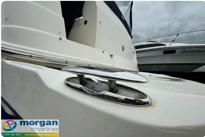
Rinker fiesta vee 250 boat - cleat