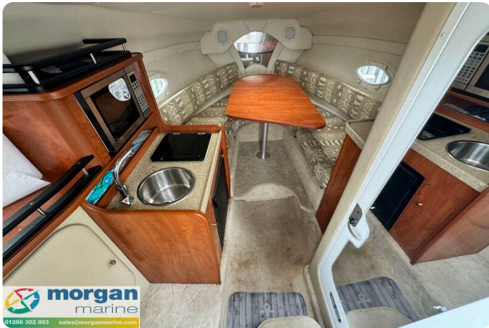
Rinker fiesta vee 250 boat - forward cabin saloon