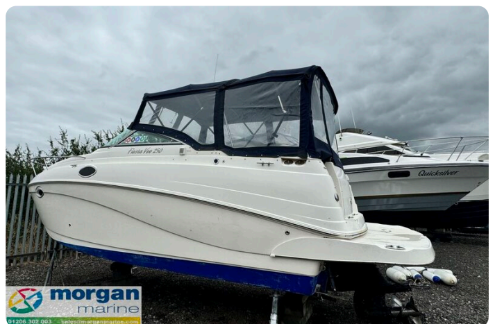
Rinker fiesta vee 250 boat - port side canopy