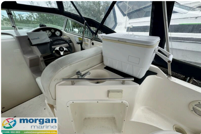
Rinker fiesta vee 250 boat - cockpit sink