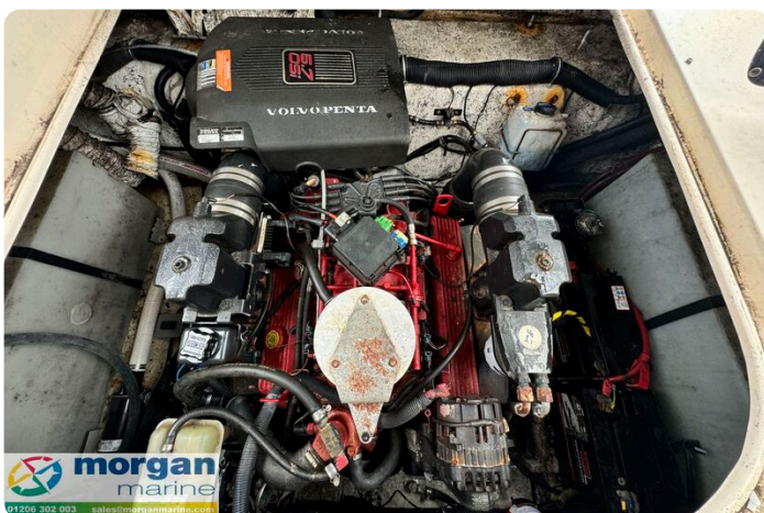
Rinker fiesta vee 250 boat - engine