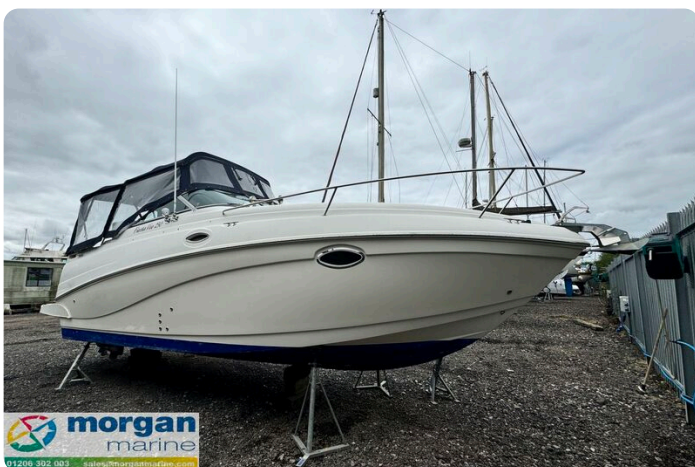
Rinker fiesta vee 250 boat - starboard side bow