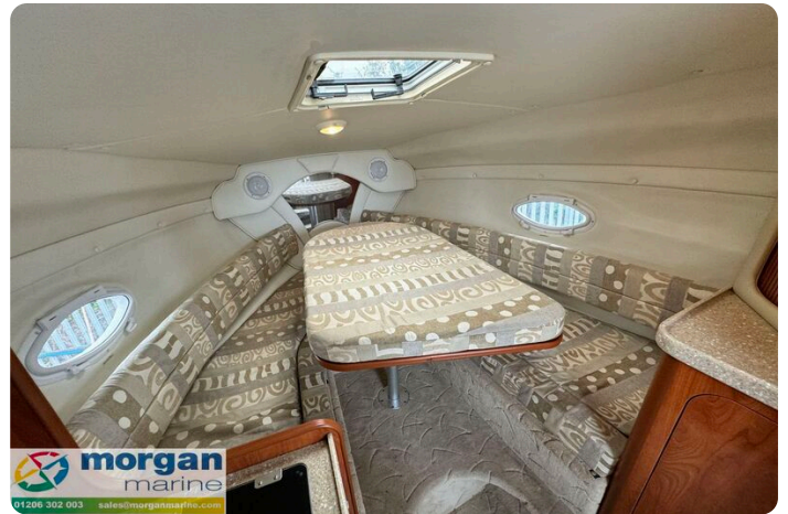
Rinker fiesta vee 250 boat - saloon infill