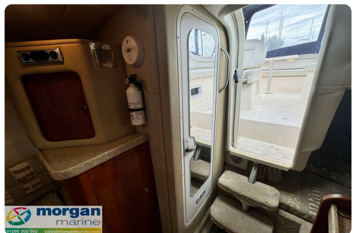
Rinker fiesta vee 250 boat - steps to cockpit