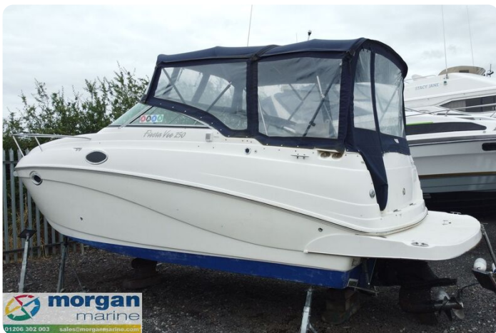
Rinker fiesta vee 250 boat - port side