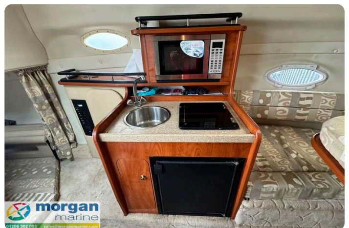
Rinker fiesta vee 250 boat - galley