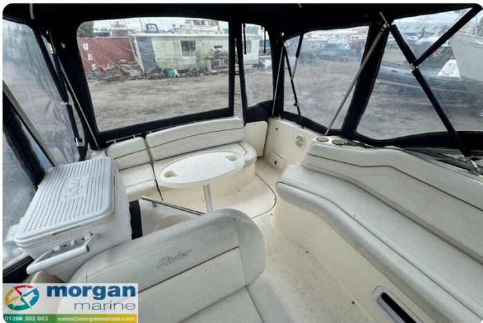
Rinker fiesta vee 250 boat - cockpit seating from helm