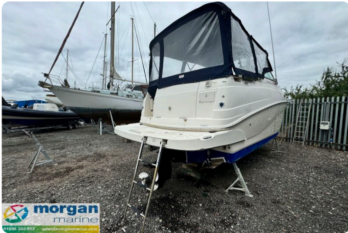
Rinker fiesta vee 250 boat - boarding ladder