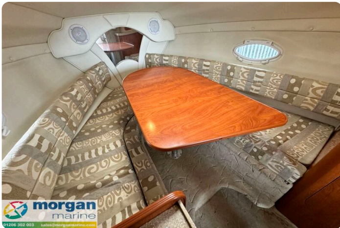
Rinker fiesta vee 250 boat - saloon table and seating