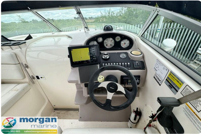
Rinker fiesta vee 250 boat - steering wheel