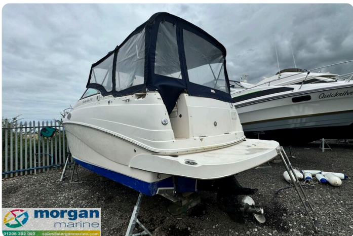
Rinker fiesta vee 250 boat - bathing platform and entrance to cockpit