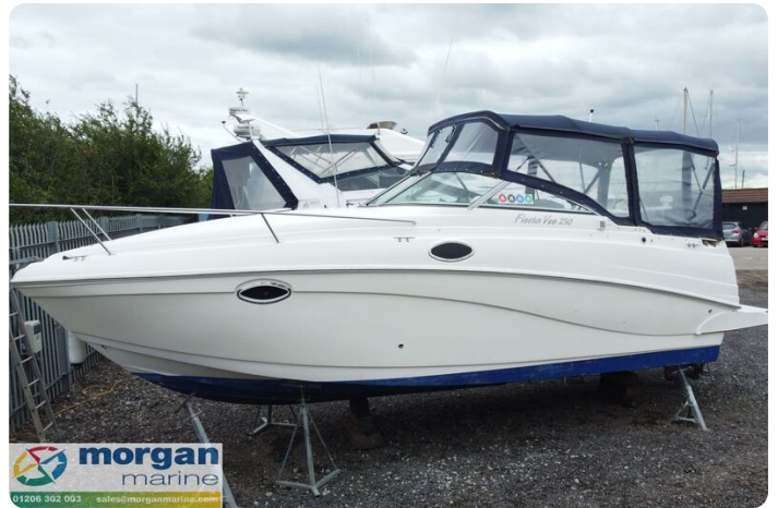
Rinker fiesta vee 250 boat - port side bow