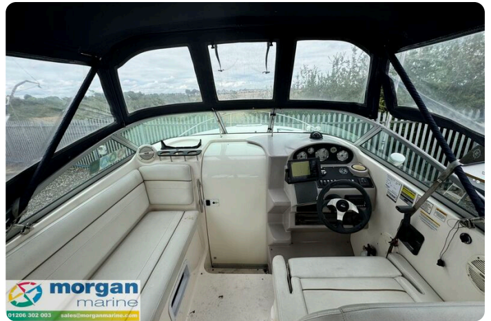
Rinker fiesta vee 250 boat - helm area