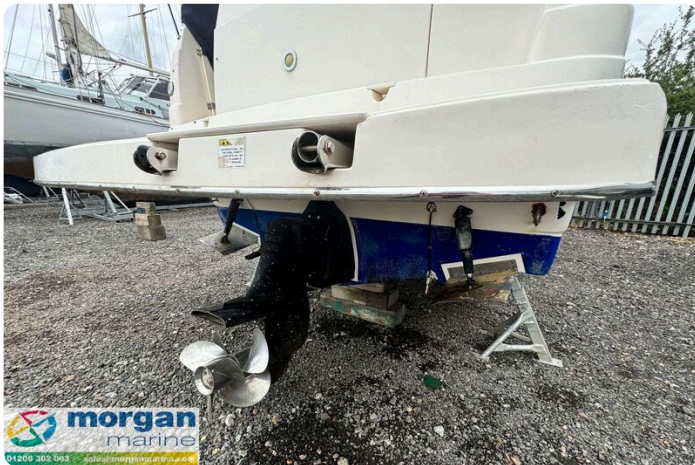
Rinker fiesta vee 250 boat - sterndrive and propeller