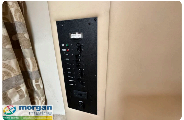
Rinker fiesta vee 250 boat - panel