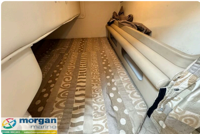
Rinker fiesta vee 250 boat - aft berth mattress