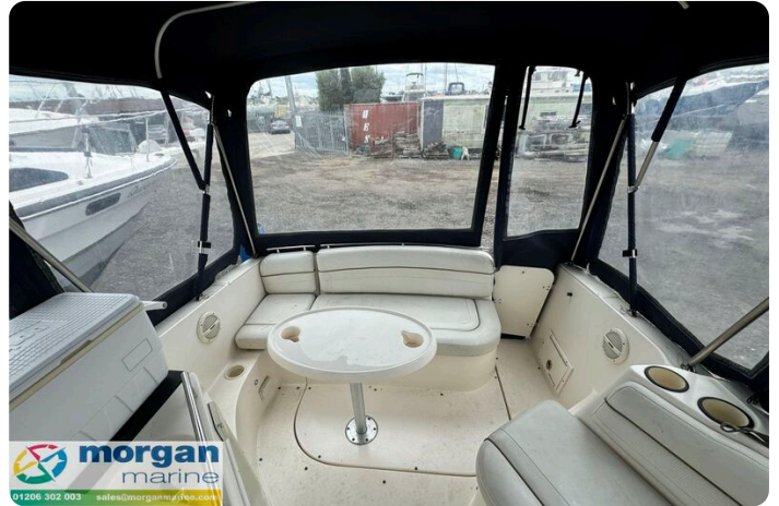
Rinker fiesta vee 250 boat - view from cockpit through aft canopy