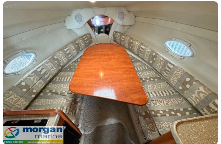
Rinker fiesta vee 250 boat - table in saloon