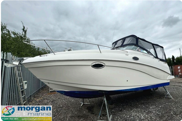
Rinker fiesta vee 250 boat