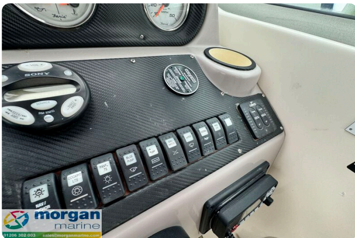
Rinker fiesta vee 250 boat - switch panel