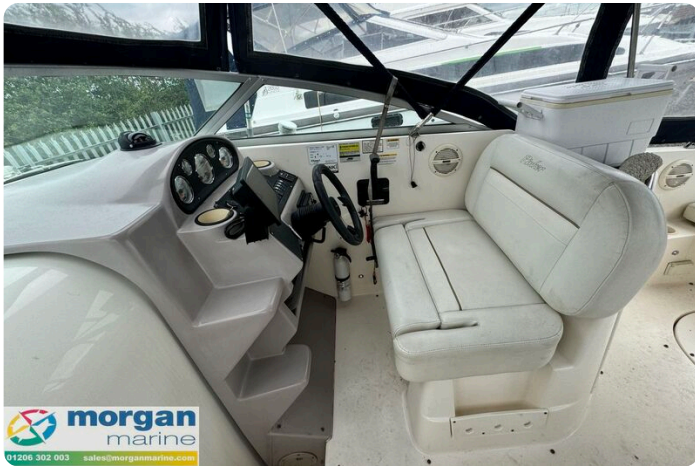
Rinker fiesta vee 250 boat - pilot and co-pilot seating