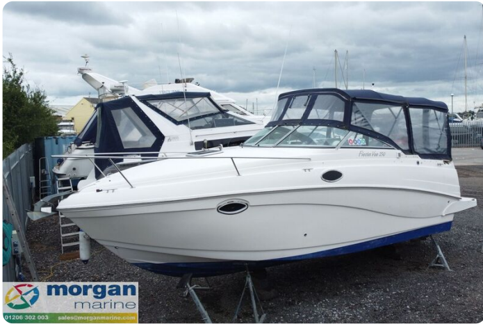
Rinker fiesta vee 250 boat - pulpit