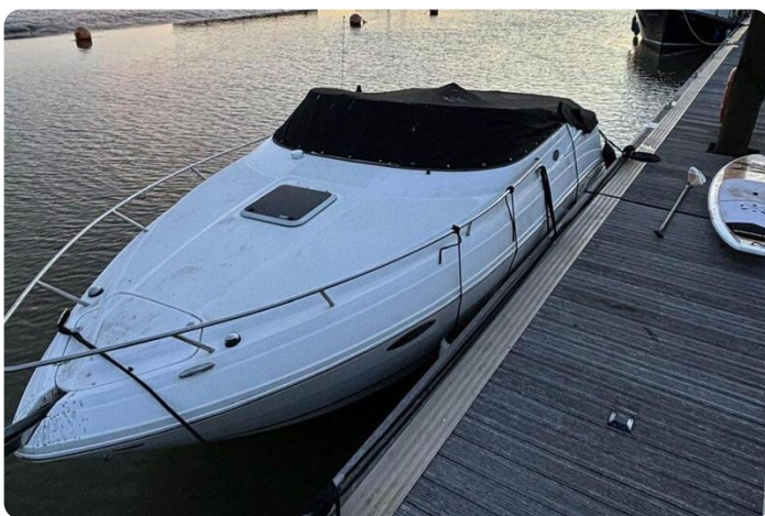
Rinker 230 - on the pontoon