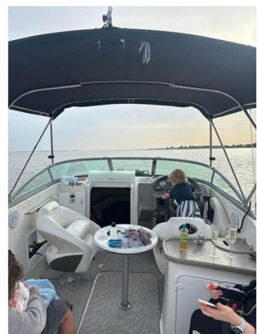
Rinker 230 - table and sun awning