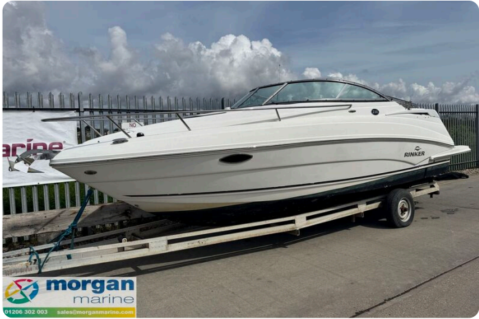
Rinker 230 - bow view