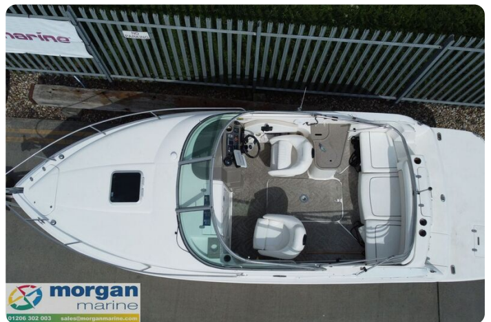
Rinker 230 - top view