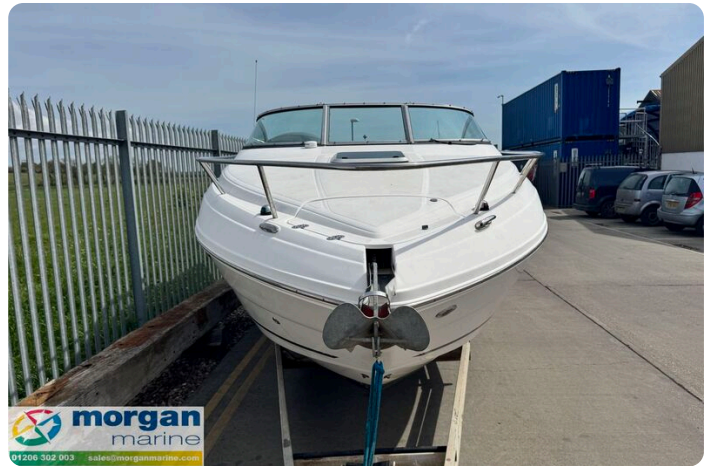
Rinker 230 - anchor