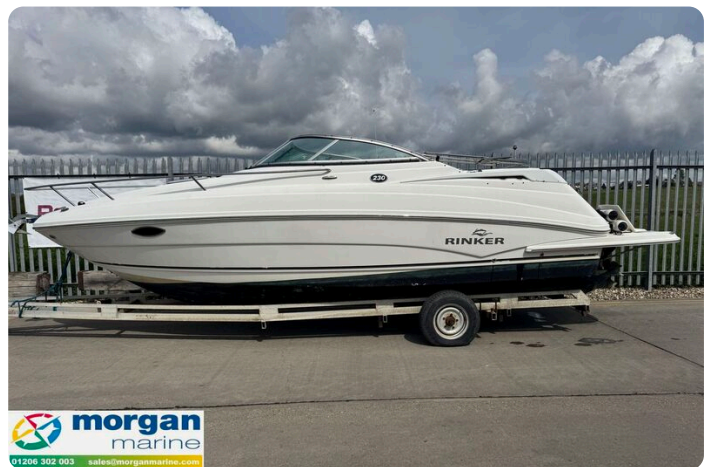
Rinker 230 - side