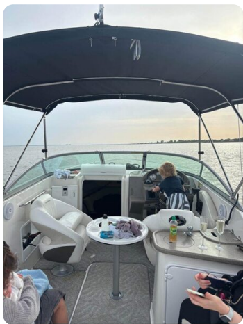
Rinker 230 - table