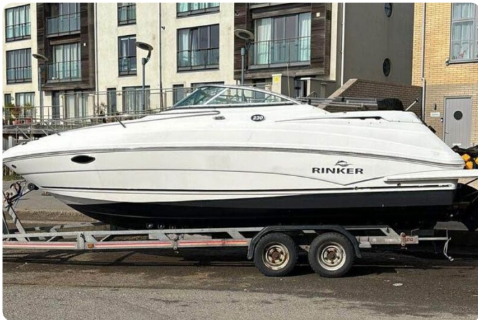
Rinker 230 - side view