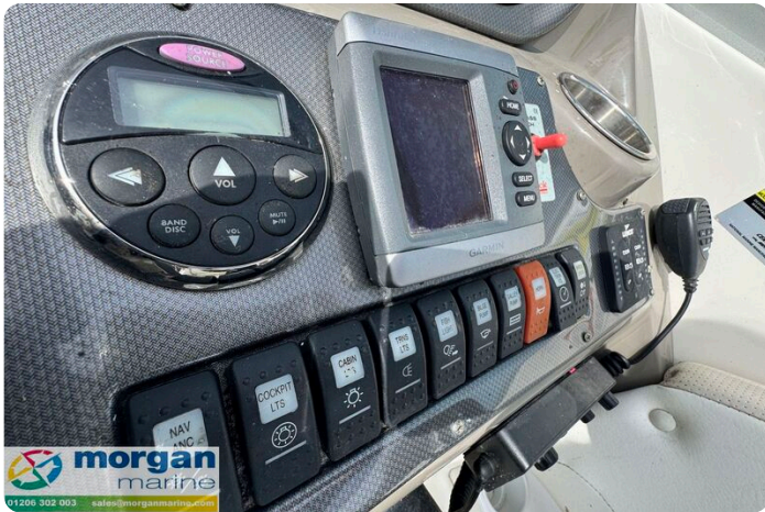
Rinker 230 - controls