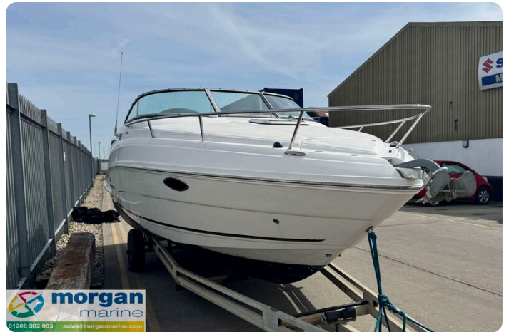
Rinker 230 - cleats