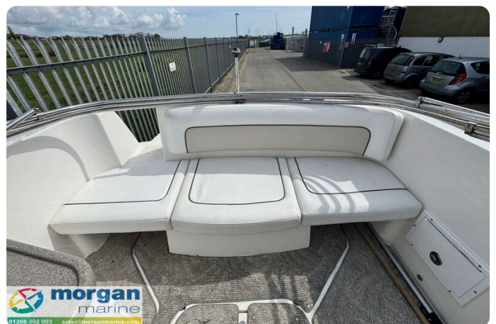
Rinker 230 - bench seat