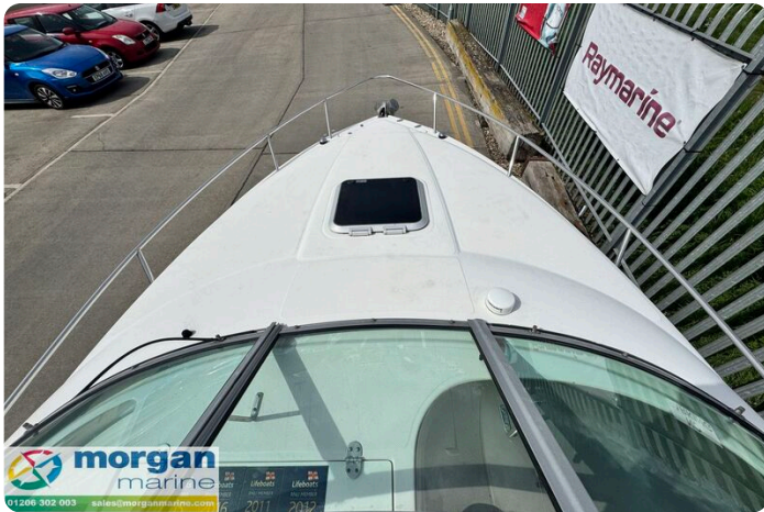
Rinker 230 - bow view