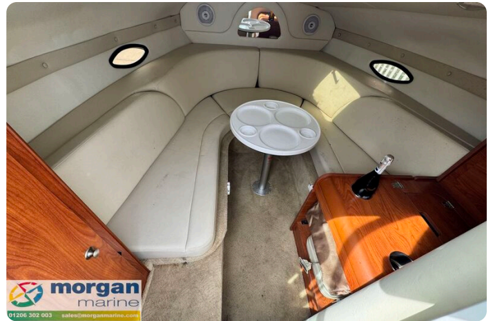
Rinker 230 - cabin area