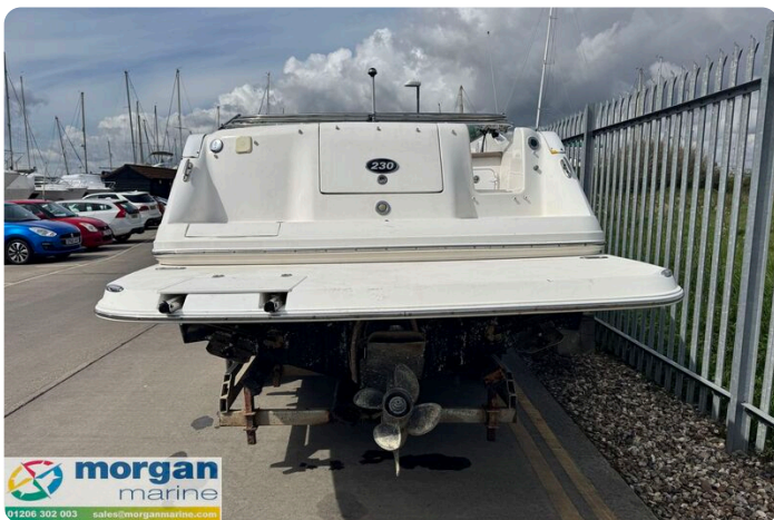
Rinker 230 - back