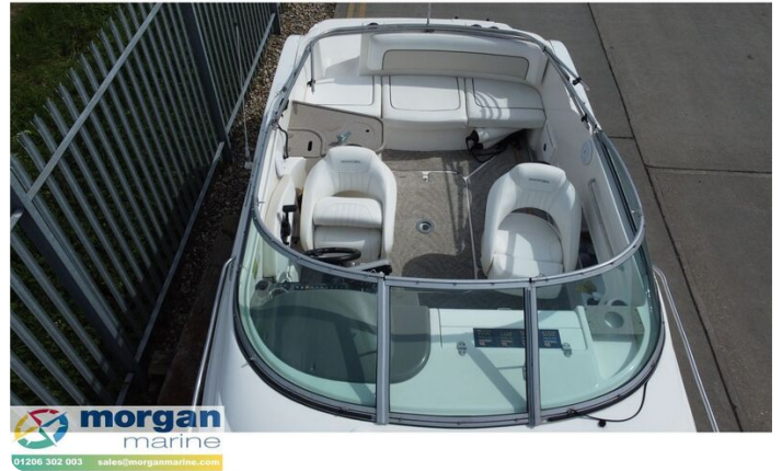
Rinker 230 - windscreen