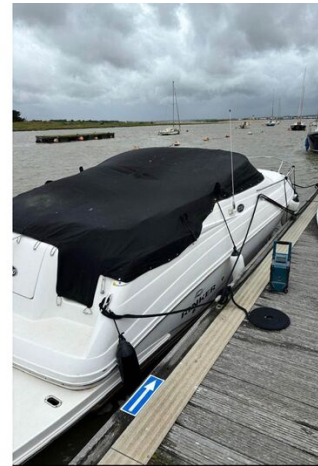
Rinker 230 - mooring cover