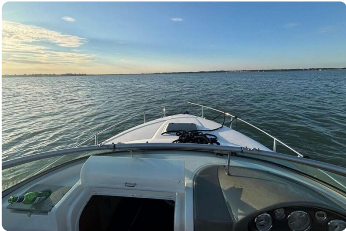
Rinker 230 - large bow view out to sea