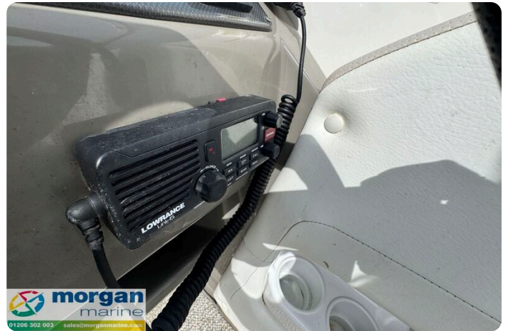
Rinker 230 - VHF