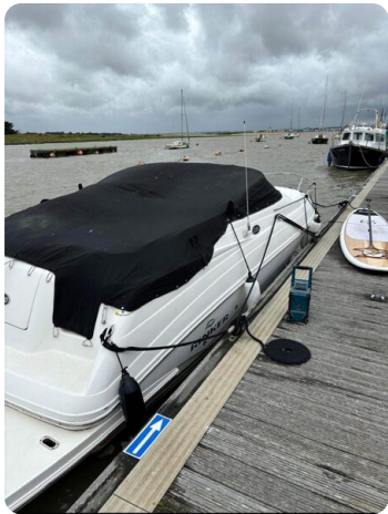
Rinker 230 - on water cover