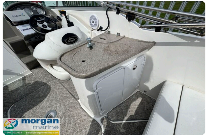
Rinker 230 - sink galley