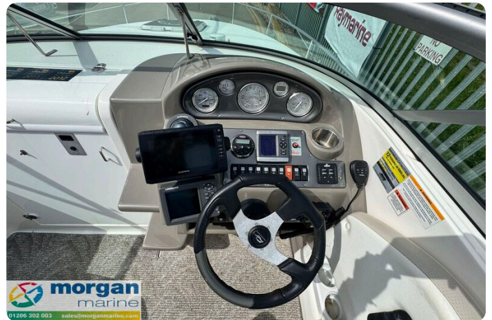
Rinker 230 - dash