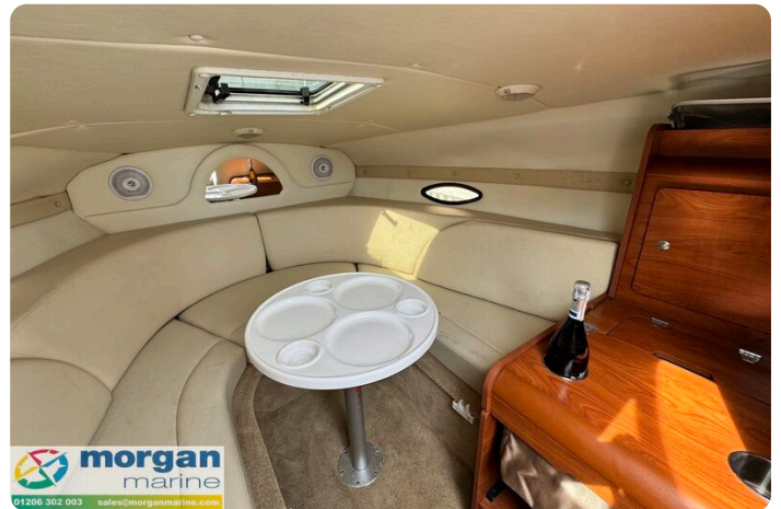
Rinker 230 - saloon