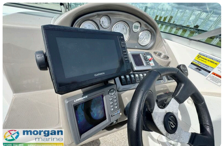
Rinker 230 - Garmin