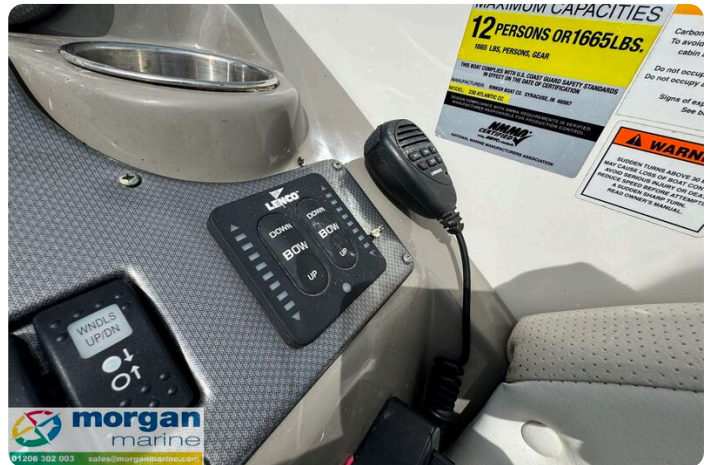
Rinker 230 - Trim tabs