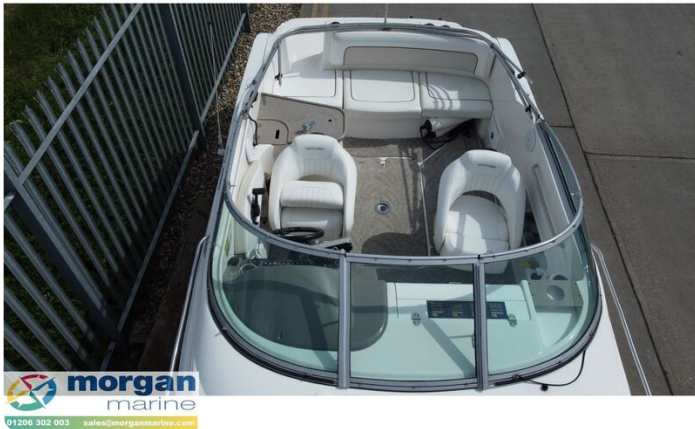
Rinker 230 - windscreen