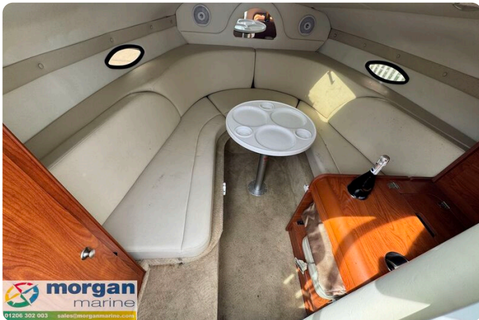
Rinker 230 - cabin area