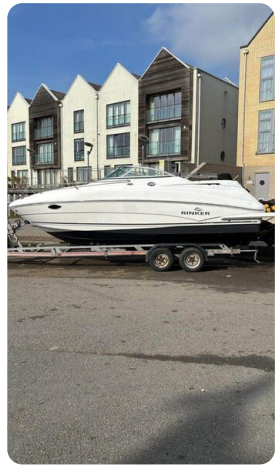
Rinker 230 - side view trailer