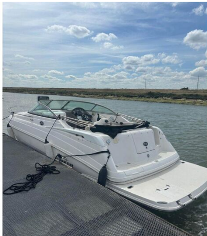
Rinker 230 - large bathing platform