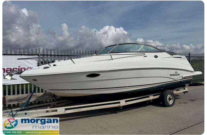
Rinker 230 - side view