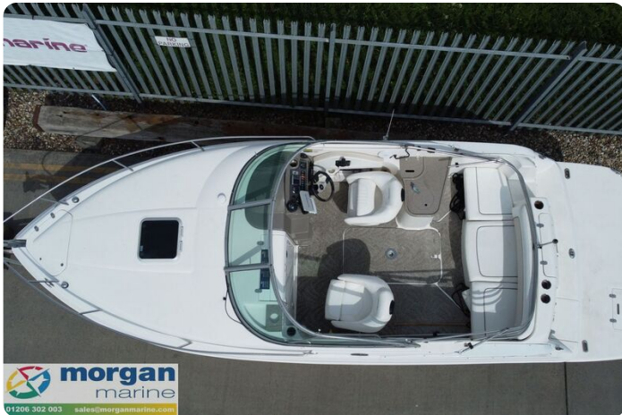
Rinker 230 - top view