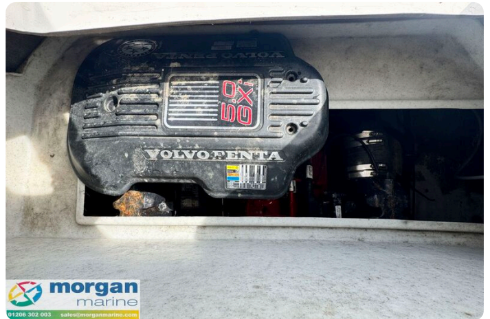
Rinker 230 - engine