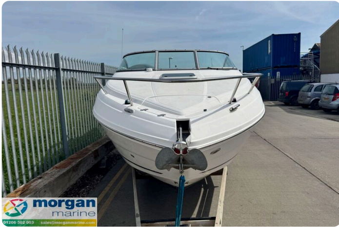
Rinker 230 - anchor