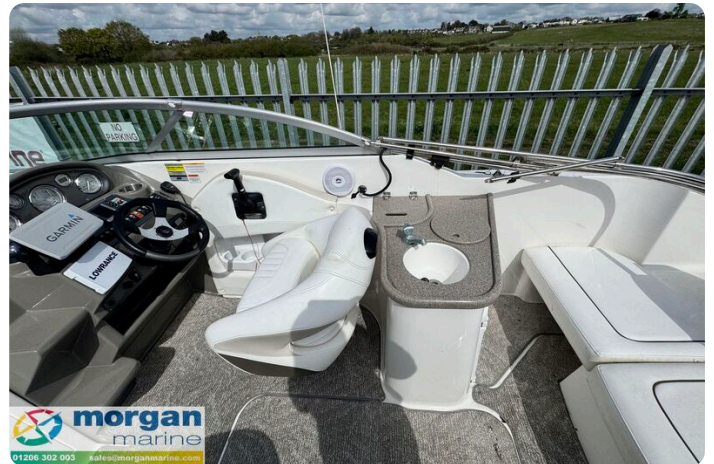
Rinker 230 - galley