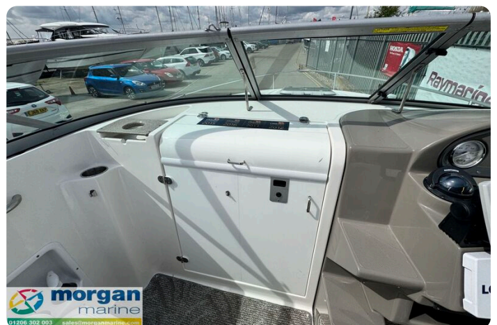
Rinker 230 - door