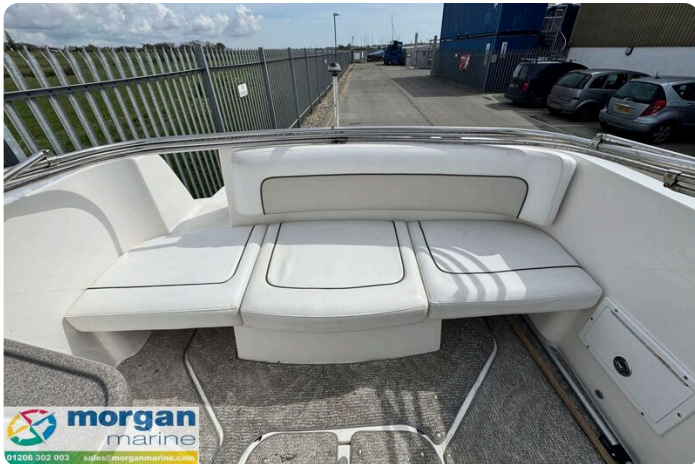
Rinker 230 - bench seat