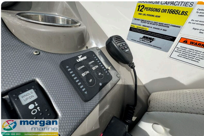
Rinker 230 - Trim tabs