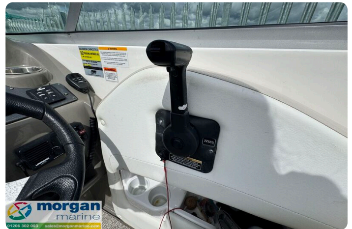
Rinker 230 - throttle