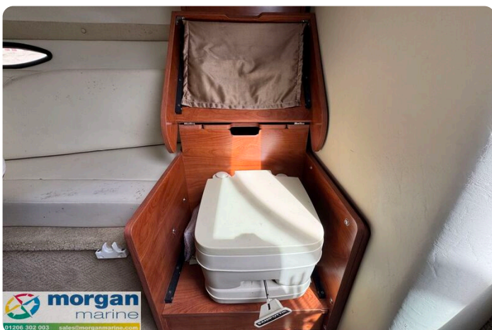
Rinker 230 - Toilet