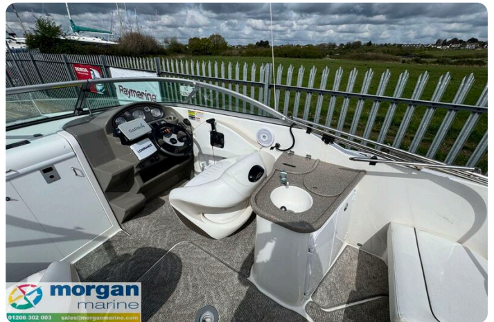
Rinker 230 - sink