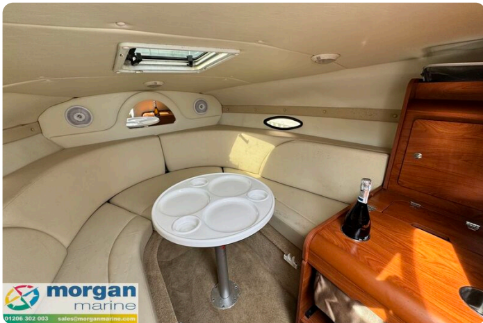
Rinker 230 - saloon