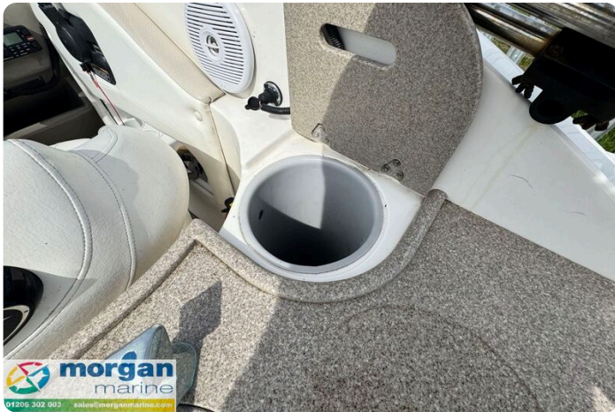
Rinker 230 - storage