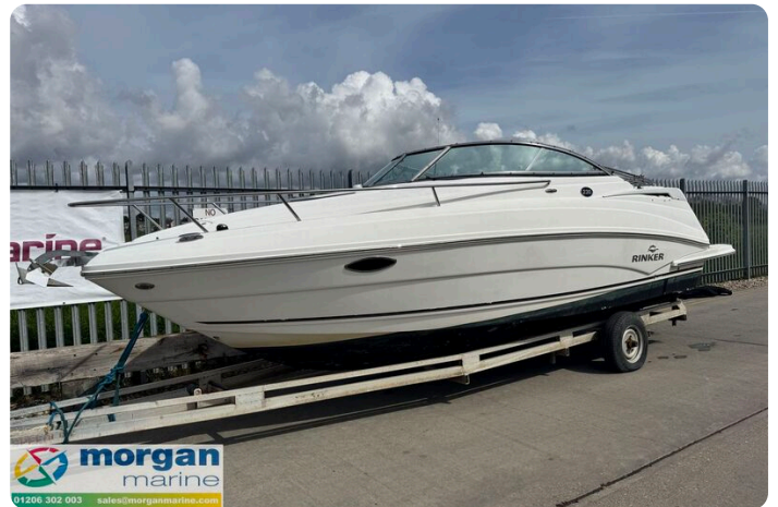
Rinker 230 - Main