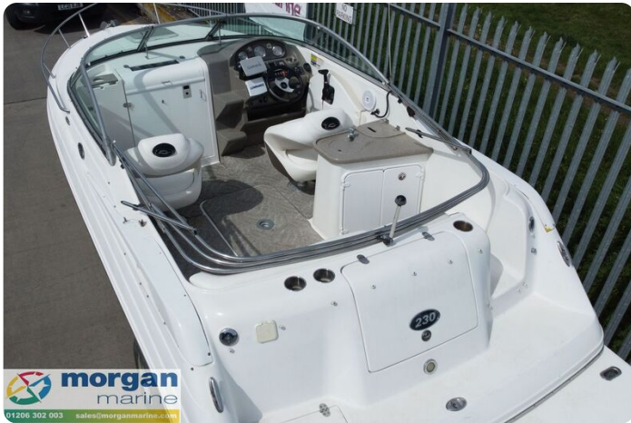
Rinker 230 - bimni