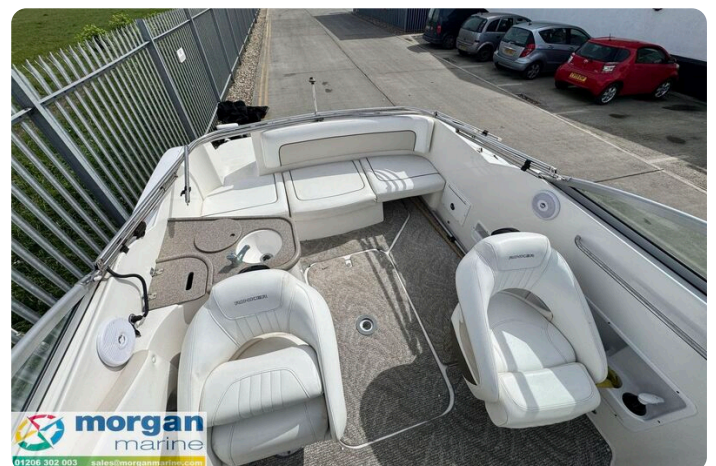
Rinker 230 - carpet