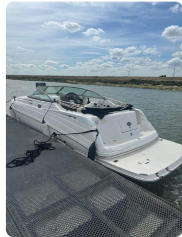
Rinker 230 - back view cover