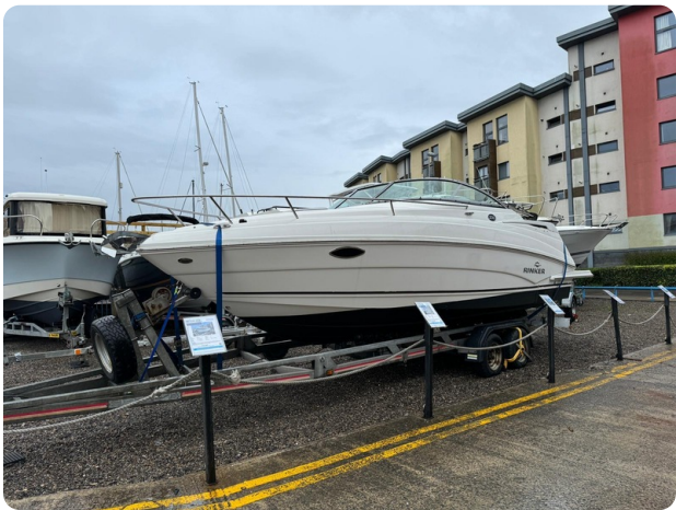
Rinker 230 - side view