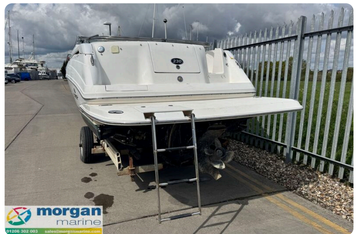
Rinker 230 - ladder