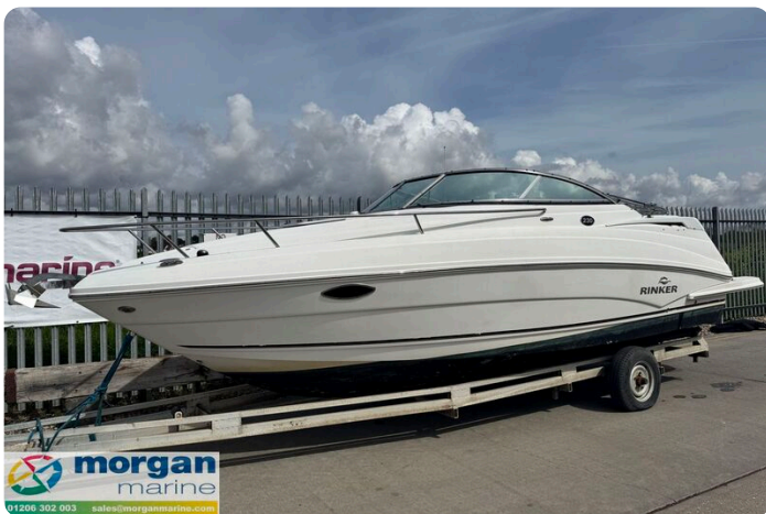
Rinker 230 - side view