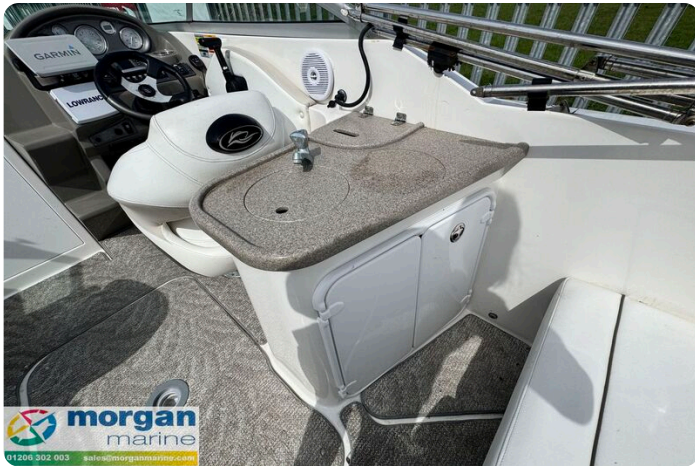
Rinker 230 - sink galley