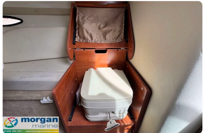
Rinker 230 - Toilet