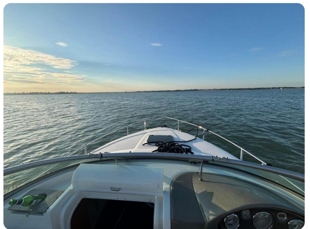
Rinker 230 - bow water