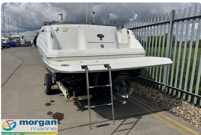
Rinker 230 - ladder