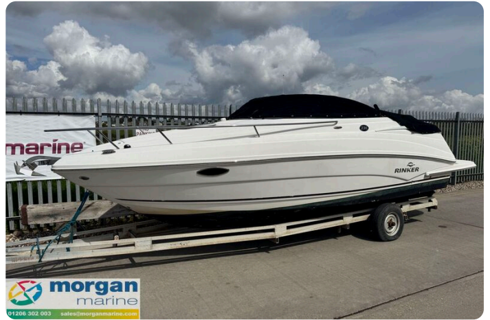
Rinker 230 - covers