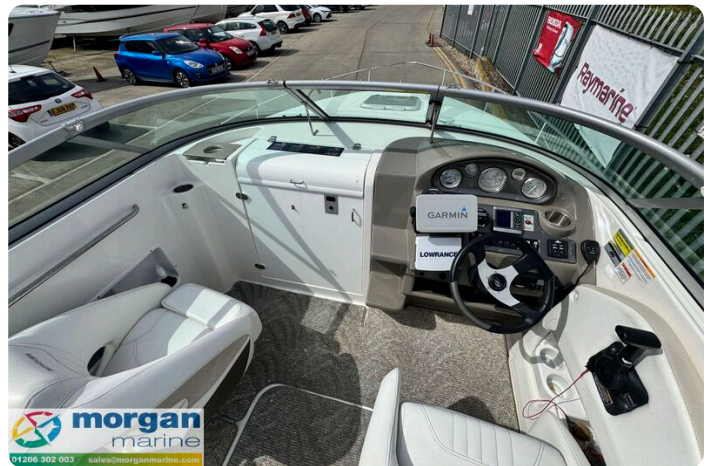
Rinker 230 - wheel