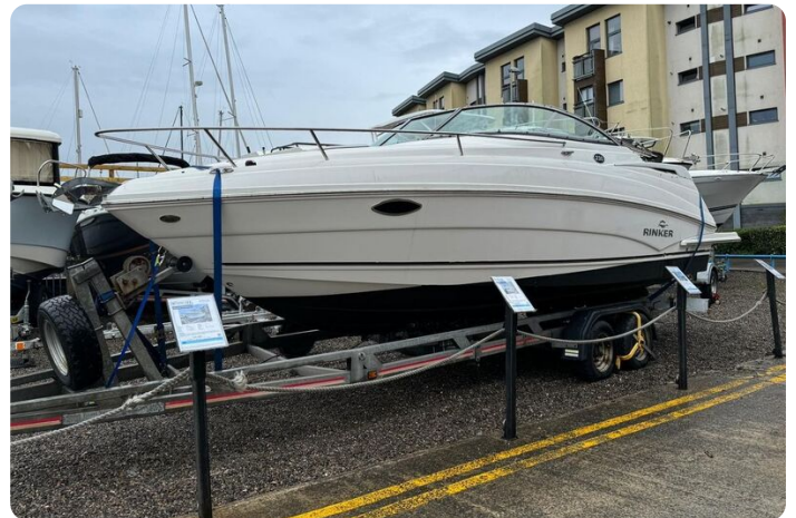
Rinker 230 - on hard standing