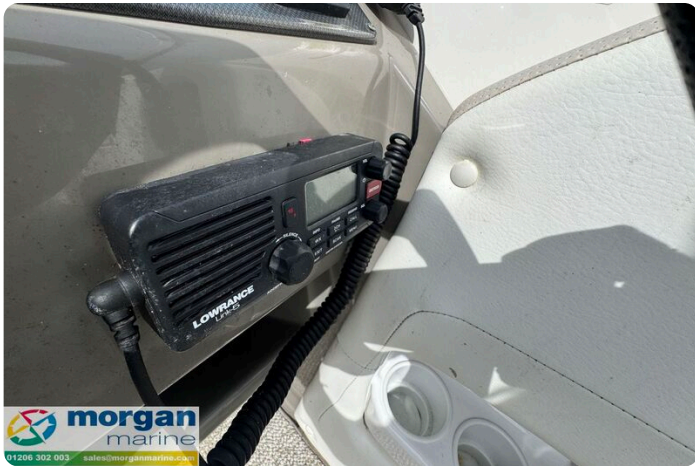
Rinker 230 - VHF