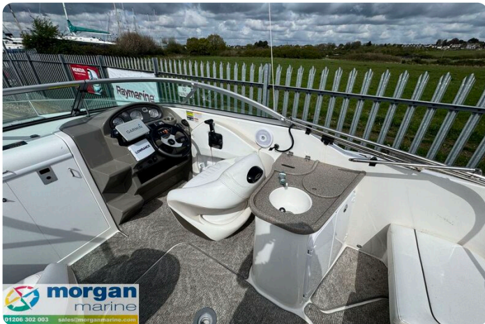
Rinker 230 - sink