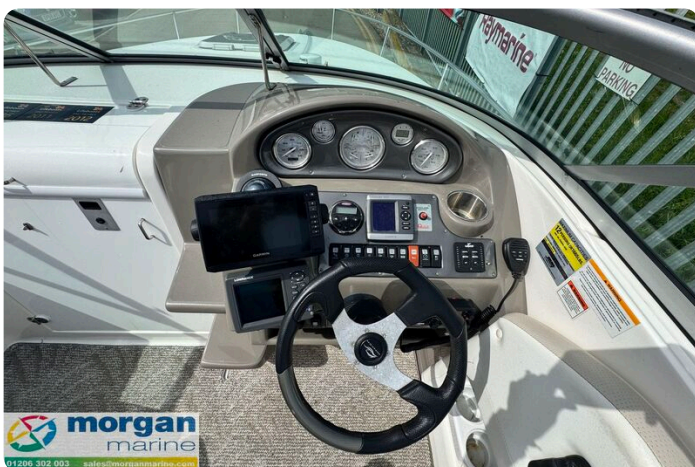
Rinker 230 - dash