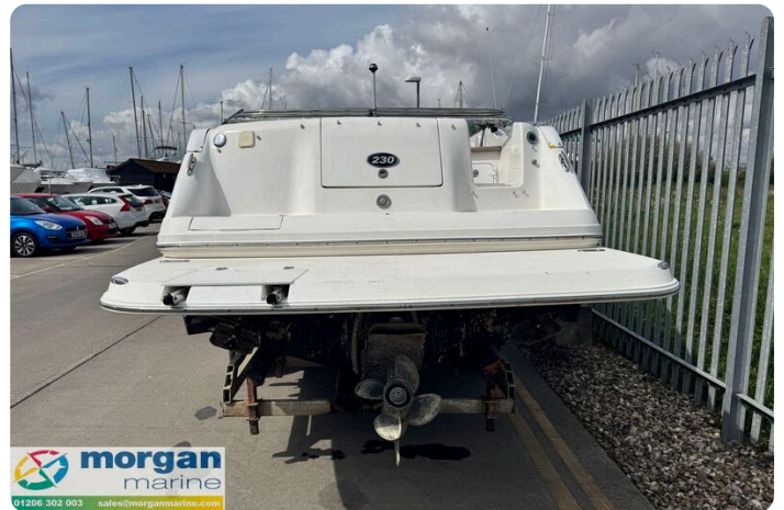
Rinker 230 - back