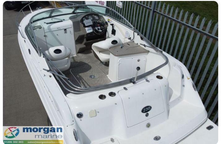
Rinker 230 - bimni