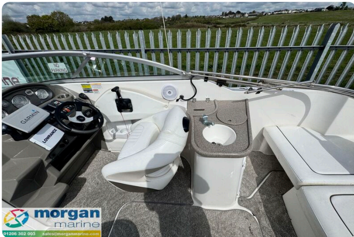
Rinker 230 - galley