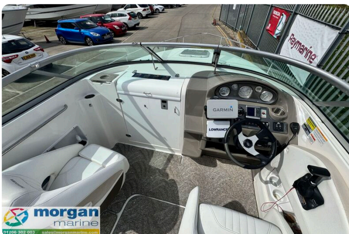
Rinker 230 - wheel