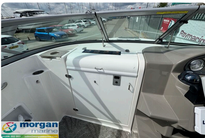
Rinker 230 - door