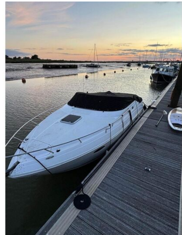
Rinker 230 - on the pontoon with a beautiful sunset