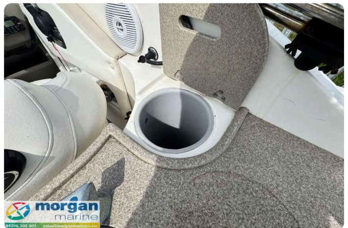
Rinker 230 - storage