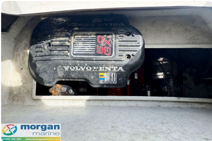
Rinker 230 - engine