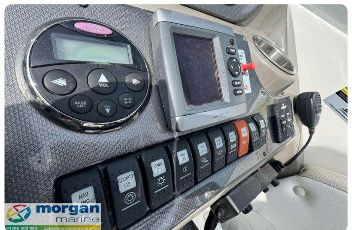
Rinker 230 - controls