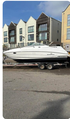
Rinker 230 - side view trailer