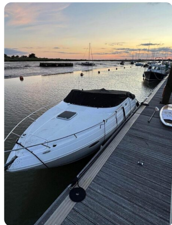
Rinker 230 - on water