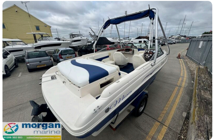
Rinker 212 bow rider - stern corner