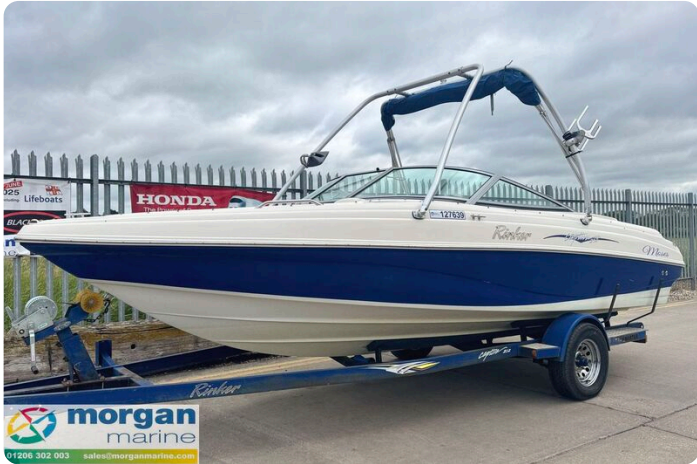
Rinker 212 bow rider - side