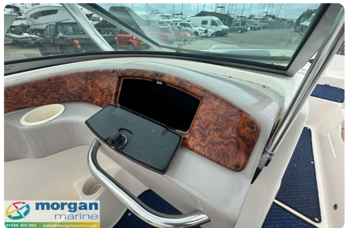
Rinker 212 bow rider - storage