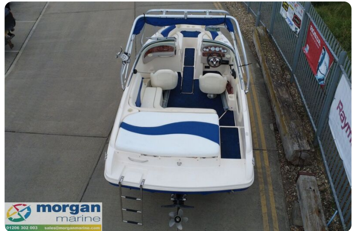
Rinker 212 bow rider - back view