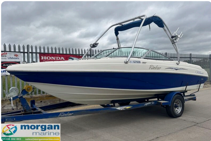
Rinker 212 bow rider - rails