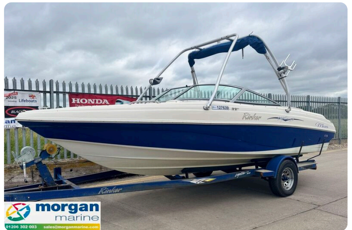
Rinker 212 bow rider - main