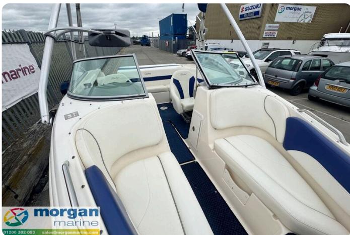
Rinker 212 bow rider - walk through