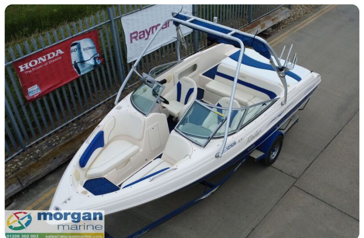
Rinker 212 bow rider - bow view