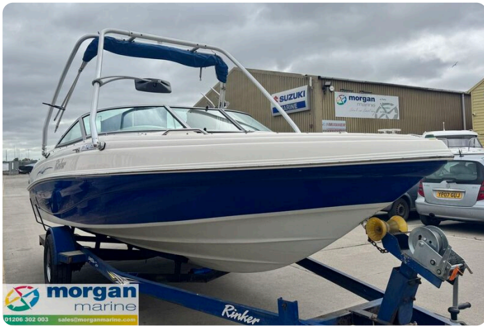
Rinker 212 bow rider - bow side