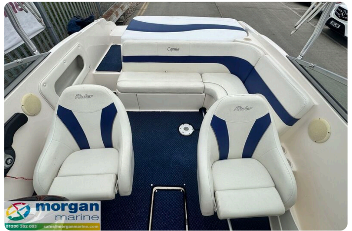
Rinker 212 bow rider - pilot seats