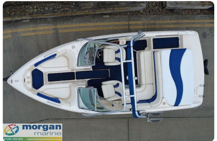
Rinker 212 bow rider - top view