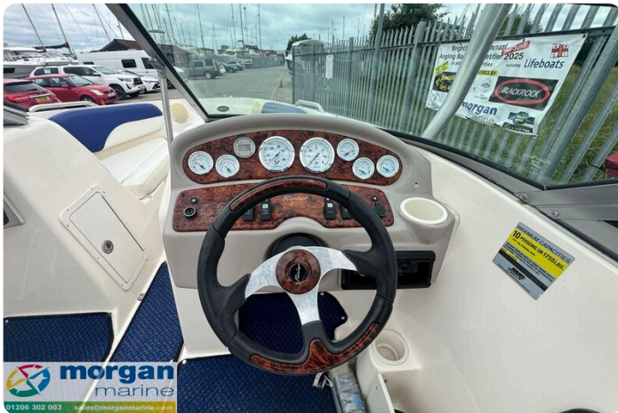
Rinker 212 bow rider - wheel