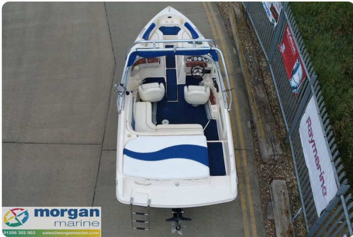
Rinker 212 bow rider - stern top