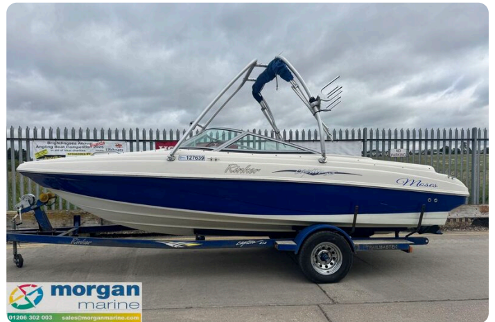
Rinker 212 bow rider - side view