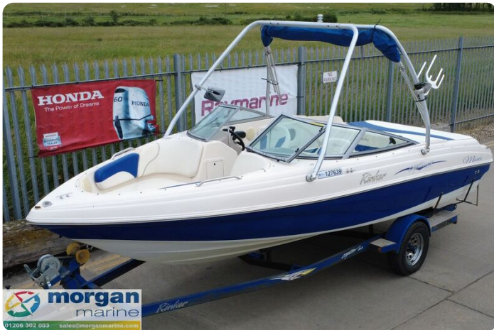
Rinker 212 bow rider - bow rails