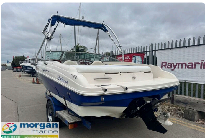
Rinker 212 bow rider - prop