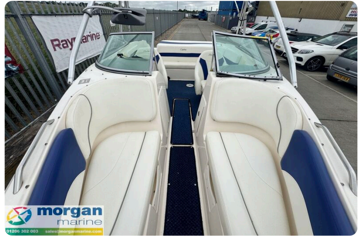
Rinker 212 bow rider - bow walk through