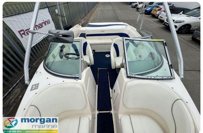
Rinker 212 bow rider - walk through window 1