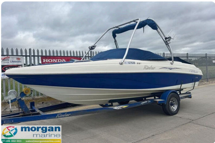
Rinker 212 bow rider - cover