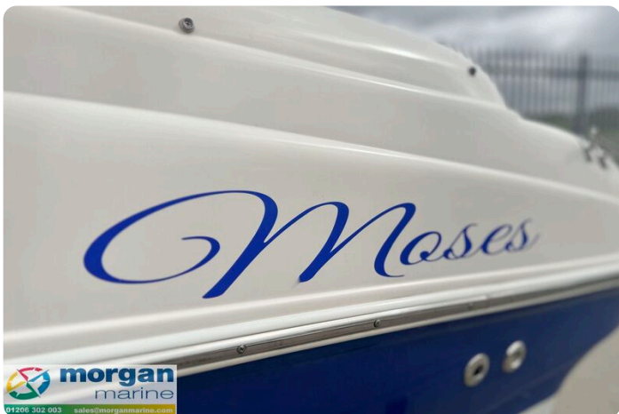
Rinker 212 bow rider - name