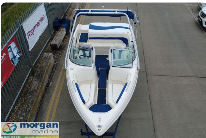
Rinker 212 bow rider - bow top