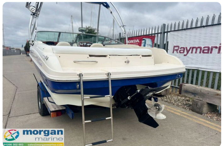
Rinker 212 bow rider - ladder