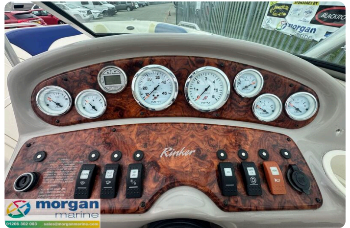
Rinker 212 bow rider - controls