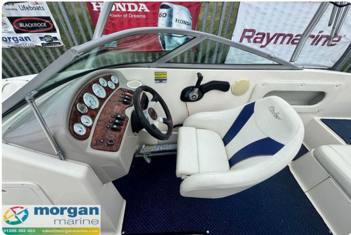
Rinker 212 bow rider - pilot