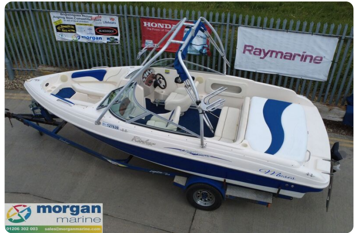
Rinker 212 bow rider - wakeboard