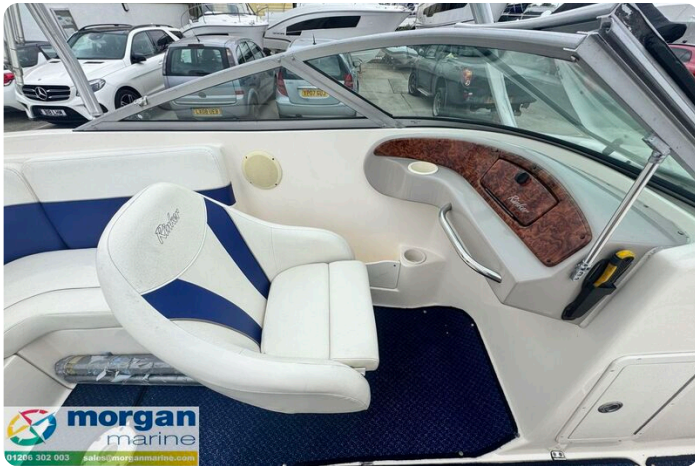
Rinker 212 bow rider - co pilot