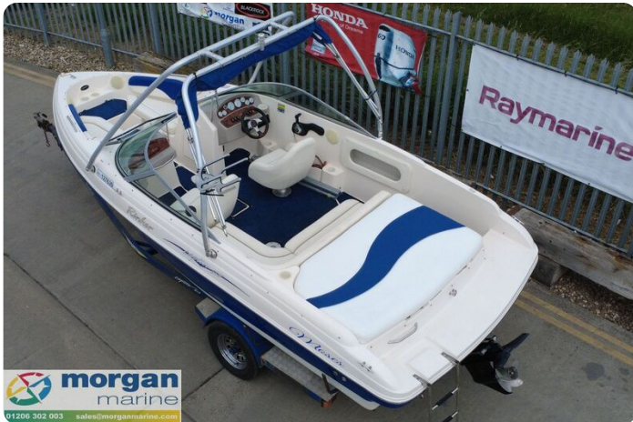
Rinker 212 bow rider - overview