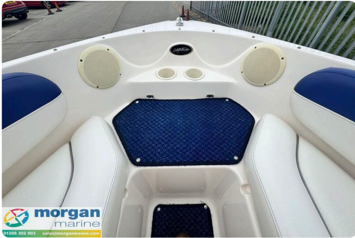
Rinker 212 bow rider - bow locker