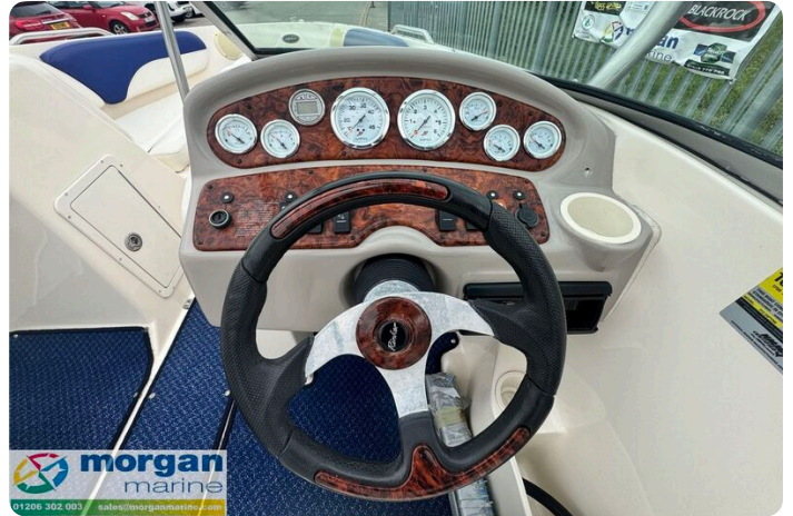
Rinker 212 bow rider - wheel 2