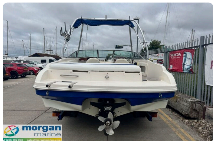
Rinker 212 bow rider - engine