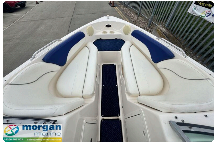
Rinker 212 bow rider - bow seating