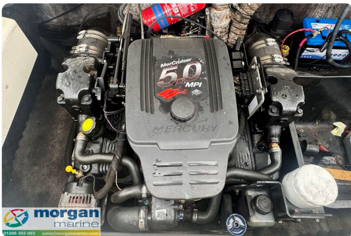
Rinker 212 bow rider - engine