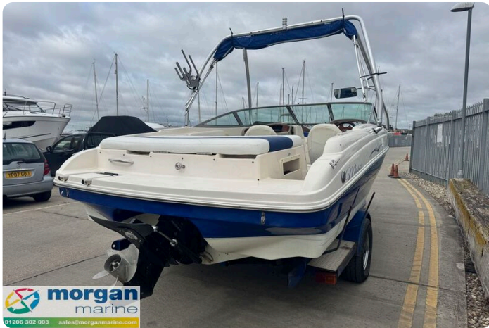
Rinker 212 bow rider - engine-1