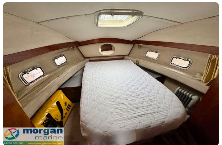
Relcraft Diamond Sedan 30 - berth