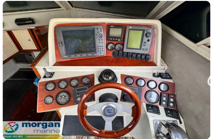
Relcraft Diamond Sedan 30 - wheel