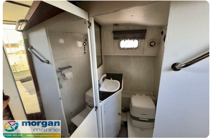
Relcraft Diamond Sedan 30 - mirror