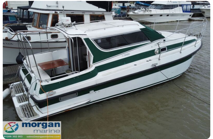
Relcraft Diamond Sedan 30 - back view