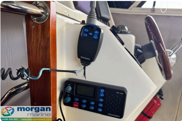
Relcraft Diamond Sedan 30 - vhf radio