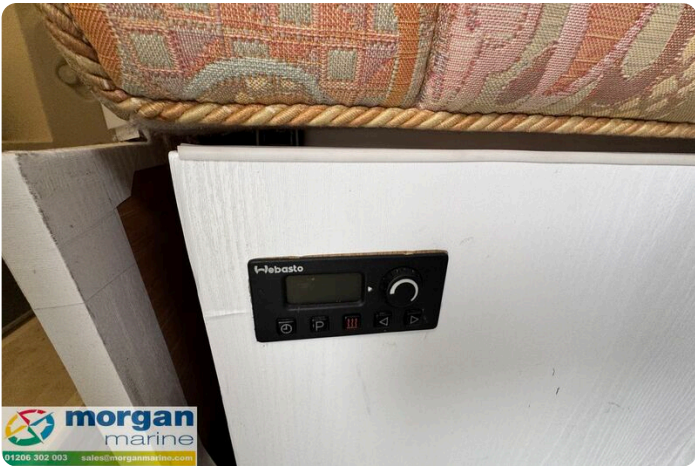
Relcraft Diamond Sedan 30 - heating