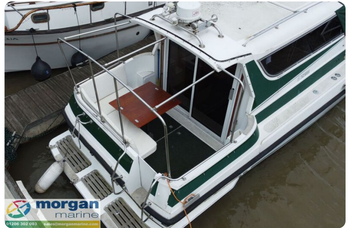
Relcraft Diamond Sedan 30 - canopy