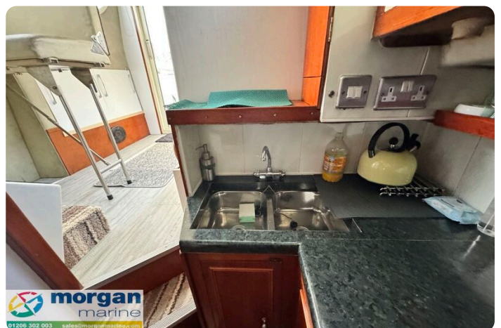
Relcraft Diamond Sedan 30 - sink