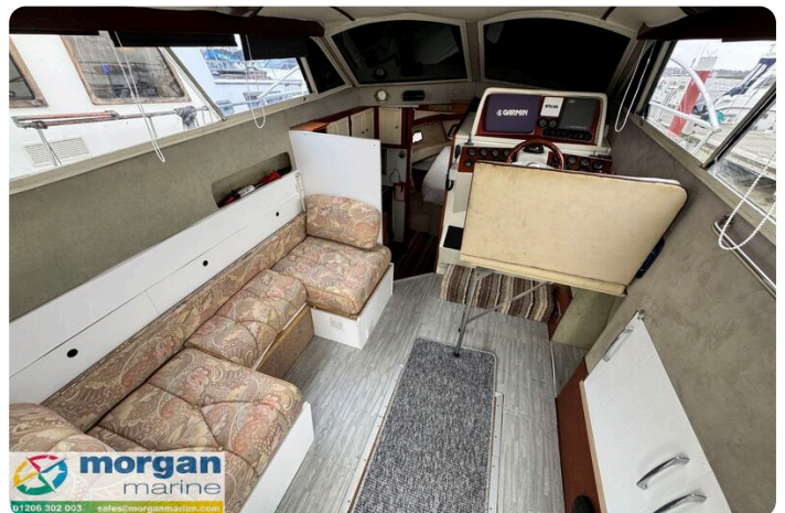
Relcraft Diamond Sedan 30 - saloon