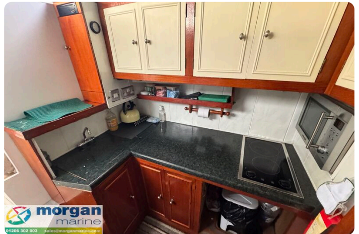
Relcraft Diamond Sedan 30 - kitchen