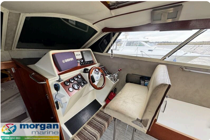
Relcraft Diamond Sedan 30 - pilot