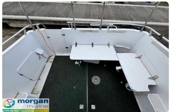
Relcraft Diamond Sedan 30 - cockpit