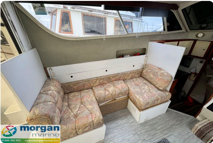
Relcraft Diamond Sedan 30 - saloon seating