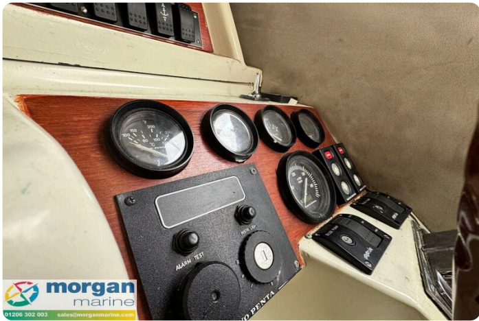
Relcraft Diamond Sedan 30 - gauges