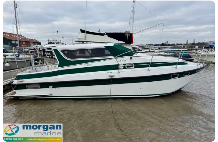
Relcraft Diamond Sedan 30 - side