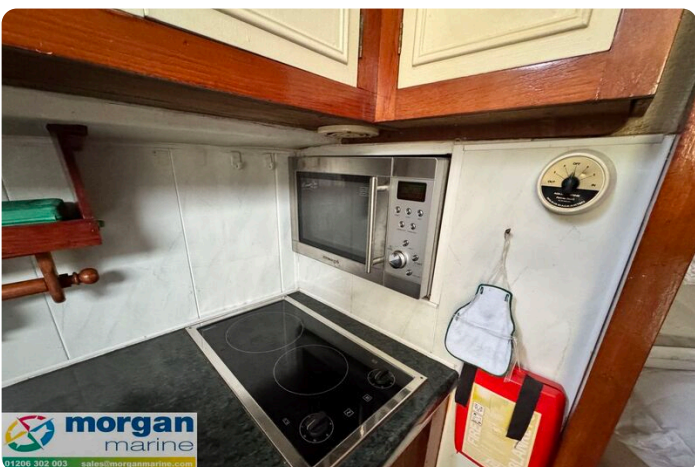
Relcraft Diamond Sedan 30 - cooker