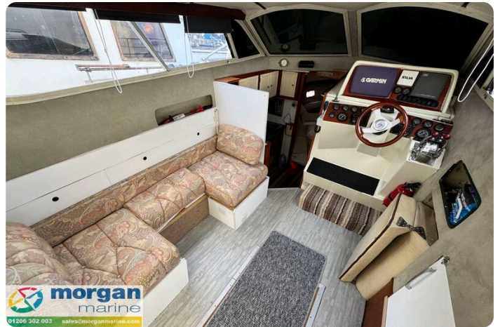
Relcraft Diamond Sedan 30 - saloon 1