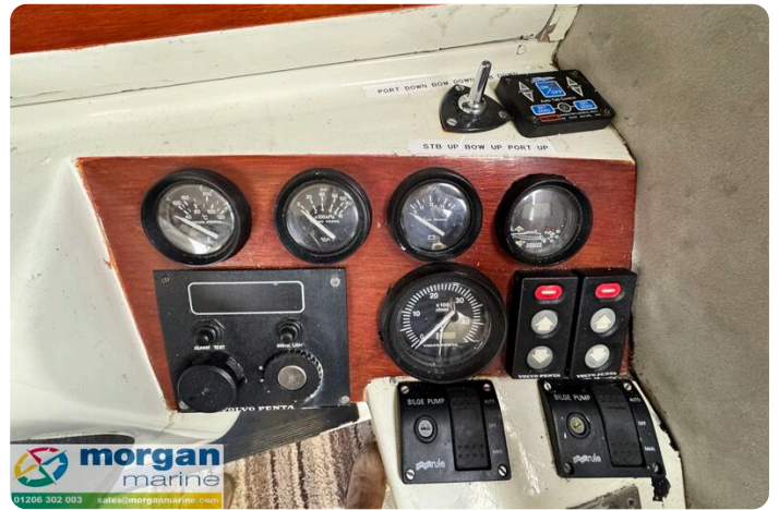
Relcraft Diamond Sedan 30 - trim tabs