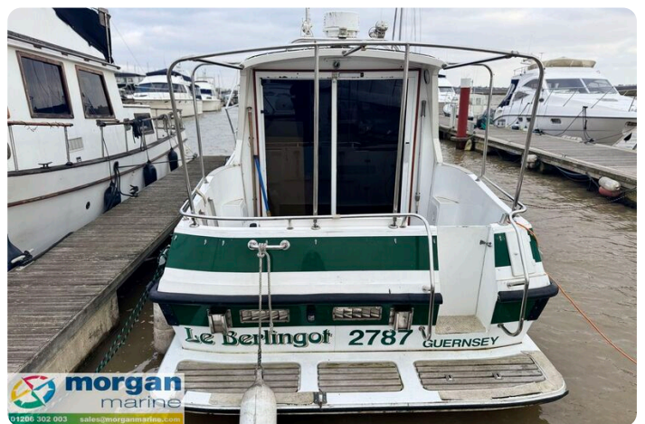
Relcraft Diamond Sedan 30 - bathing platform