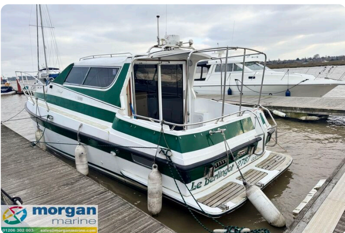
Relcraft Diamond Sedan 30 - fenders