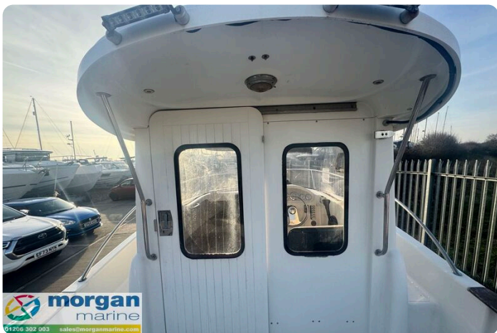
Quicksliver 640 - doors