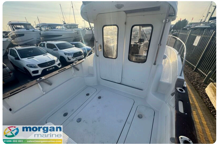
Quicksliver 640 - deck