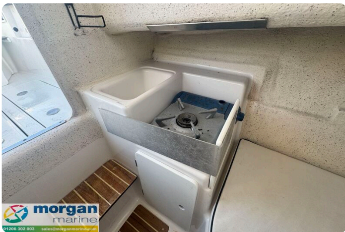
Quicksilver 640 - cooker