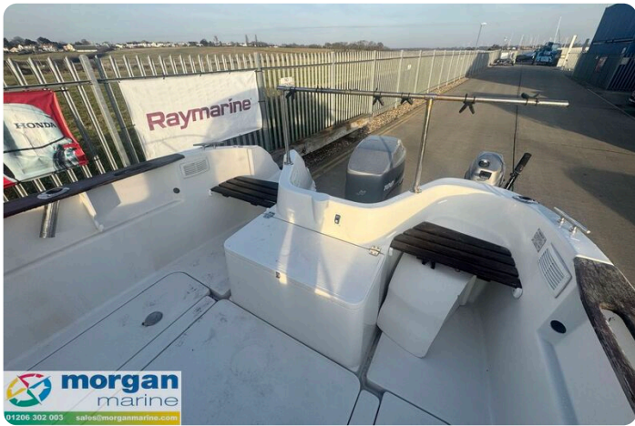
Quicksliver 640 - lockers