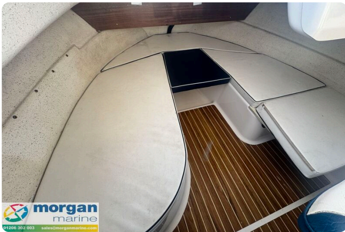
Quicksilver 640 - berth