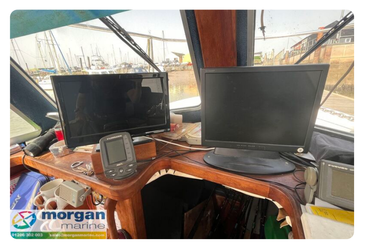
Procharter 36 GRP charter fishing boat - large screens