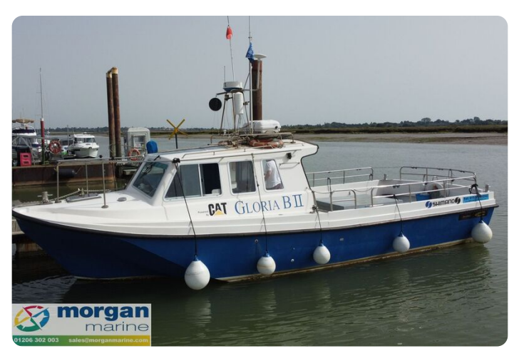
Procharter 36 GRP charter fishing boat - plenty of fenders