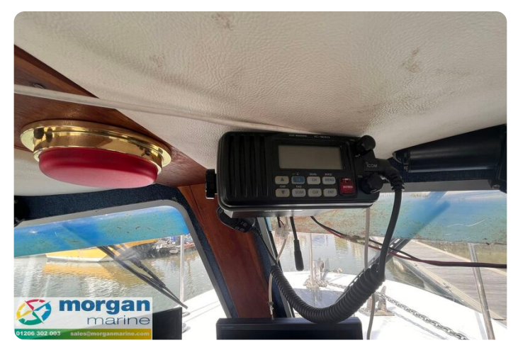
Procharter 36 GRP charter fishing boat - VHF radio