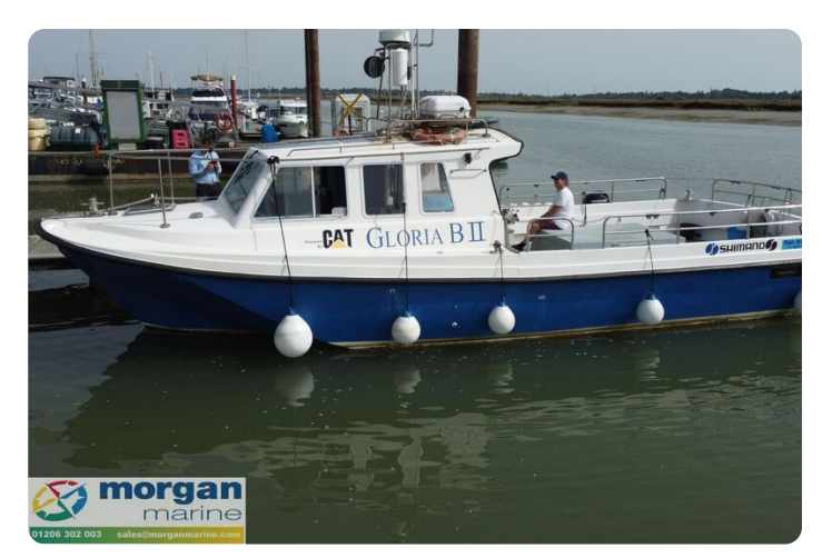
Procharter 36 GRP charter fishing boat - port side