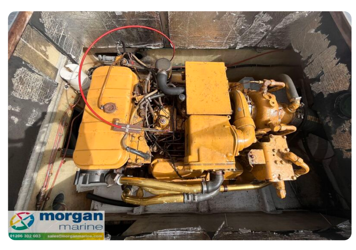
Procharter 36 GRP charter fishing boat - Caterpillar 380hp diesel shaft drive - overhead view