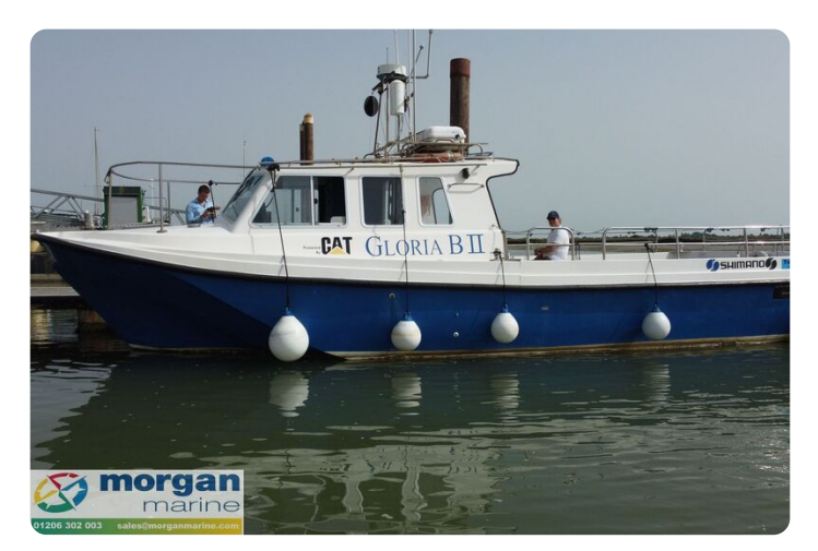
Procharter 36 GRP charter fishing boat - port side view of wheelhouse