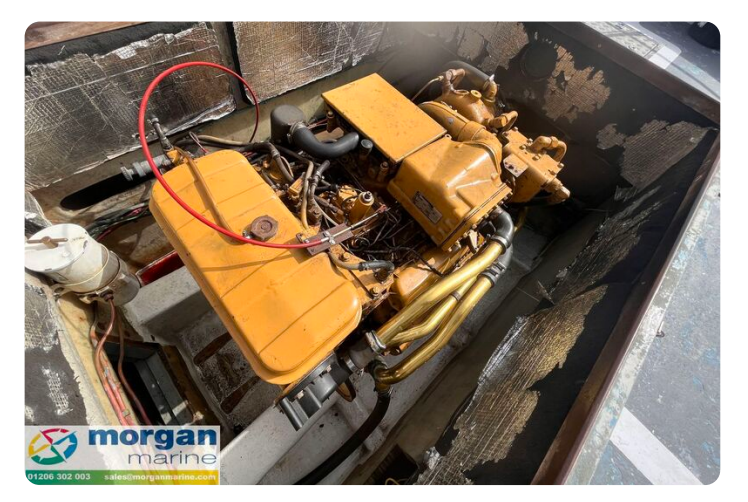
Procharter 36 GRP charter fishing boat - Caterpillar 380hp diesel shaft drive