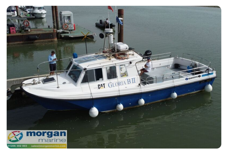
Procharter 36 GRP charter fishing boat - port side overhead view