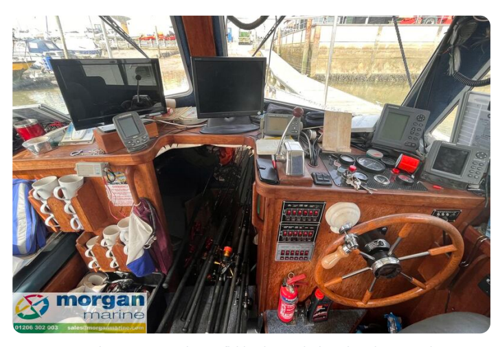
Procharter 36 GRP charter fishing boat - dash and engine controls