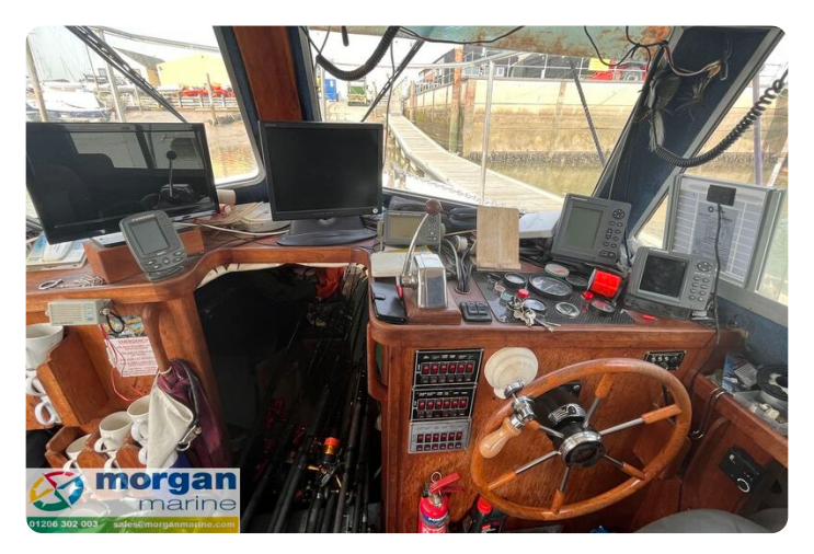
Procharter 36 GRP charter fishing boat - wheelhouse interior