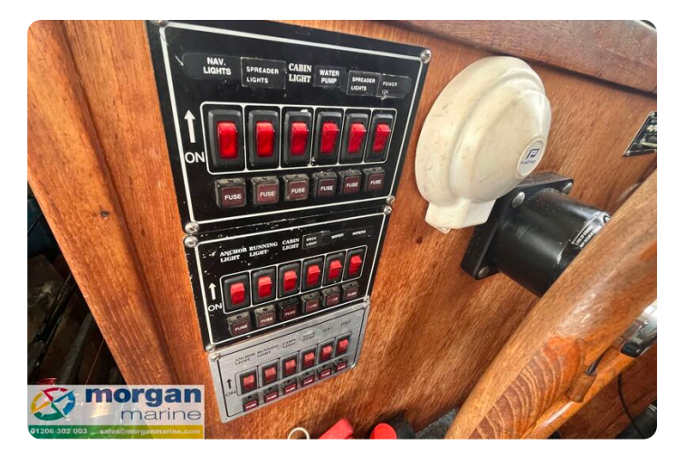
Procharter 36 GRP charter fishing boat - switch panel