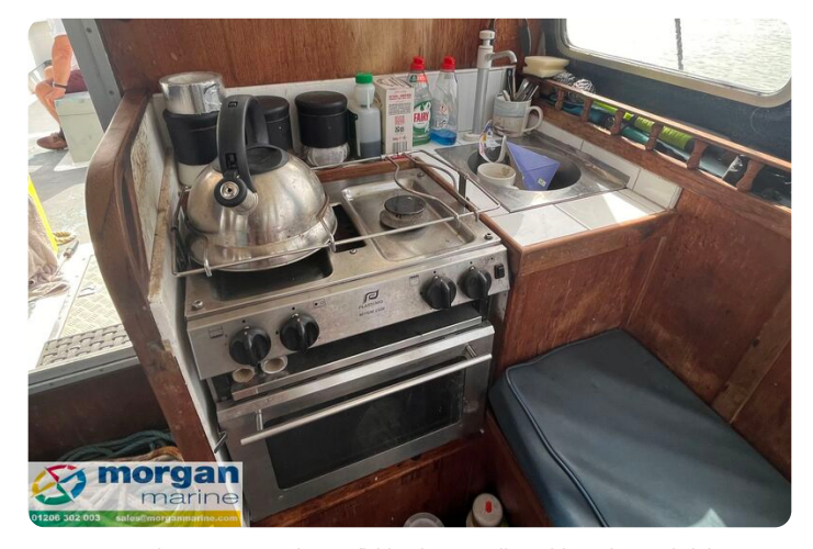
Procharter 36 GRP charter fishing boat - galley with cooker and sink