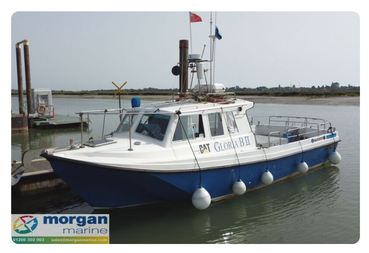
Procharter 36 GRP charter fishing boat