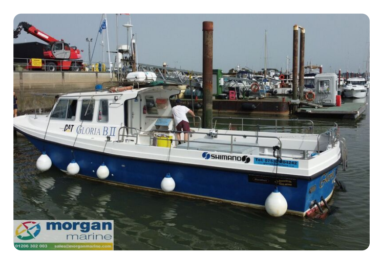
Procharter 36 GRP charter fishing boat - in the cockpit