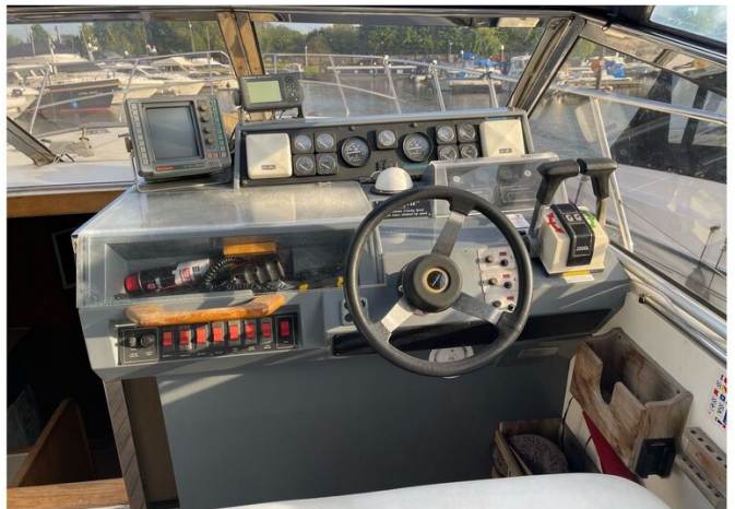
Princess 36 Riviera-dash