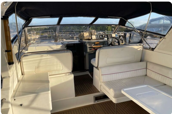
Princess 36 Riviera-cockpit