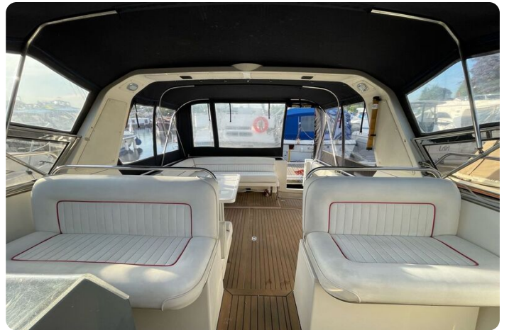
Princess 36 Riviera-overview