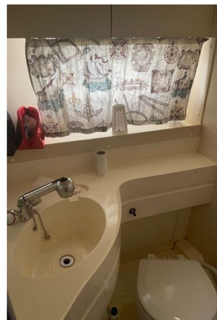
Princess 36 Riviera-toilet