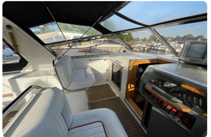
Princess 36 Riviera-co-pilot-seating