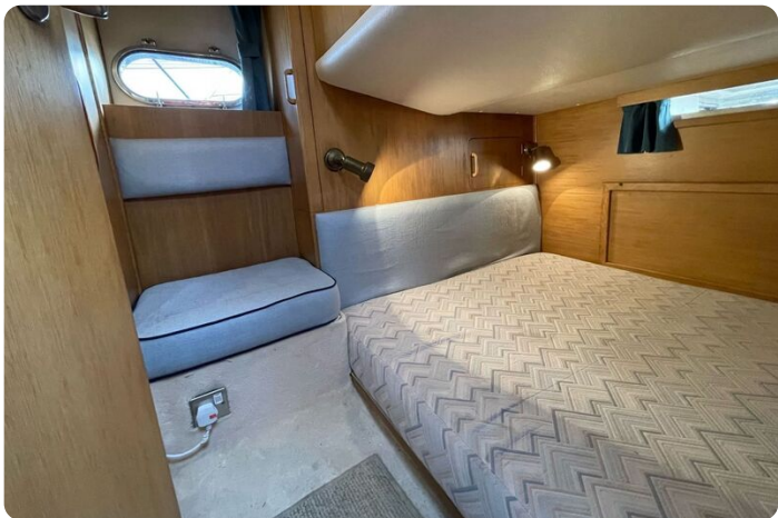
Princess 36 Riviera-aft-berth