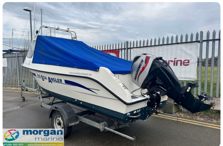
Predator 165 sea angler - mariner engine