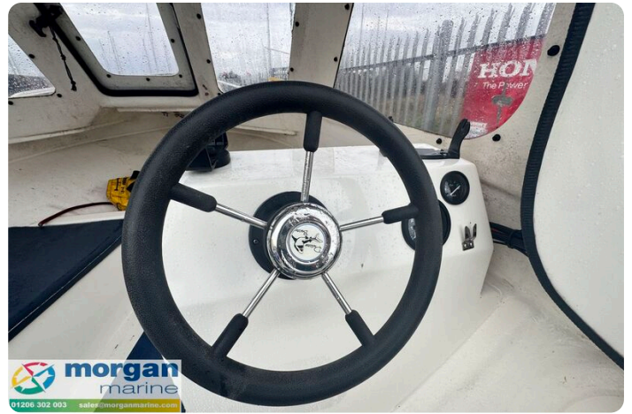
Predator 165 sea angler - wheel 2