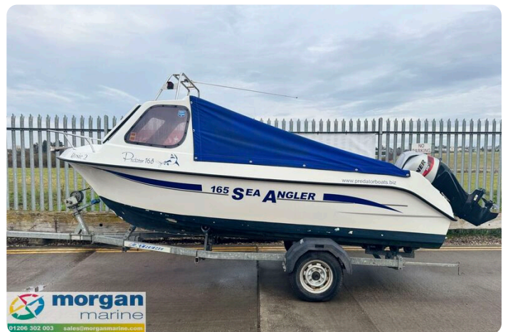
Predator 165 sea angler - Side