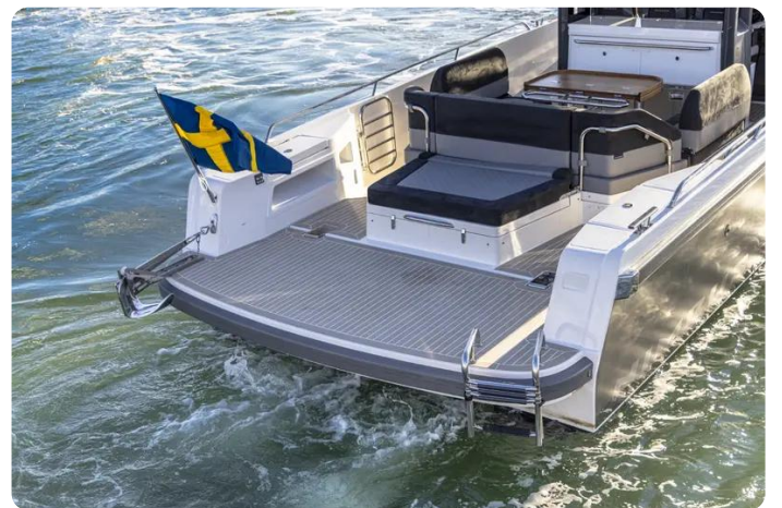
Nimbus Tender 11 (T11) Exterior 14