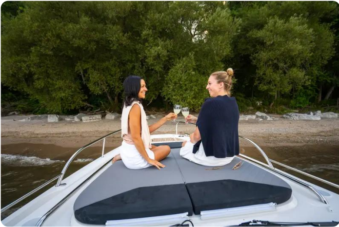
Nimbus Tender 11 (T11) Deck 8