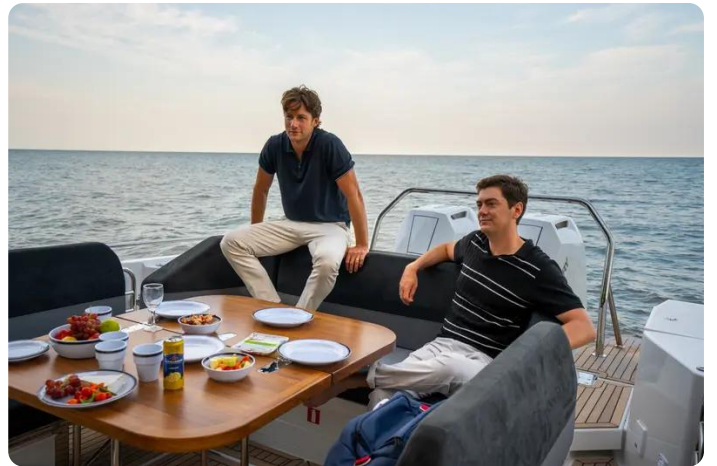
Nimbus Tender 11 (T11) Deck 9