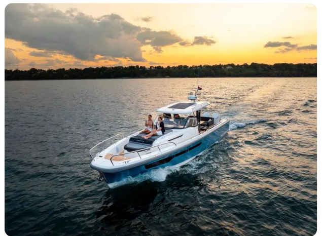
Nimbus Tender 11 (T11) Exterior 1