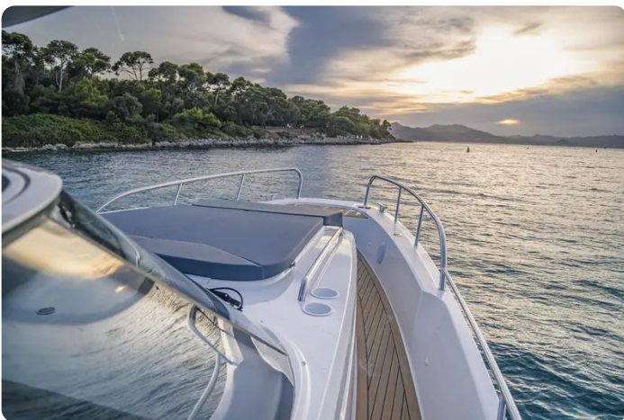
Nimbus Tender 11 (T11) Deck 2