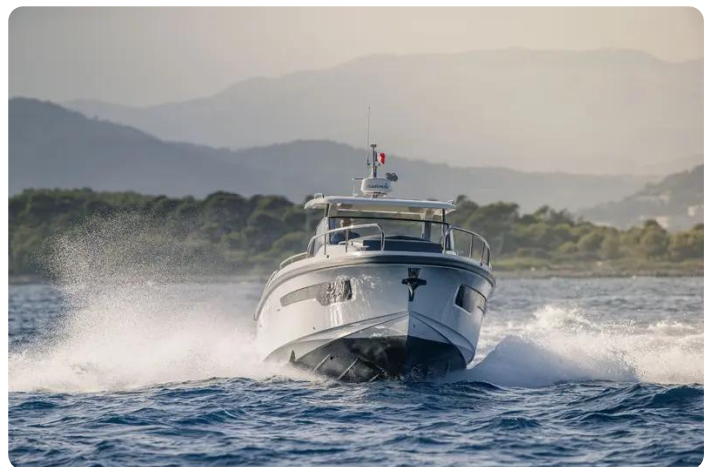
Nimbus Tender 11 (T11) Exterior 2