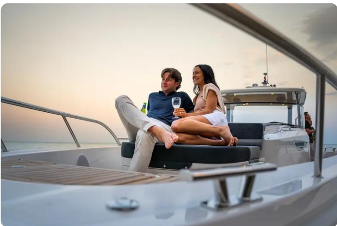
Nimbus Tender 11 (T11) Deck 6