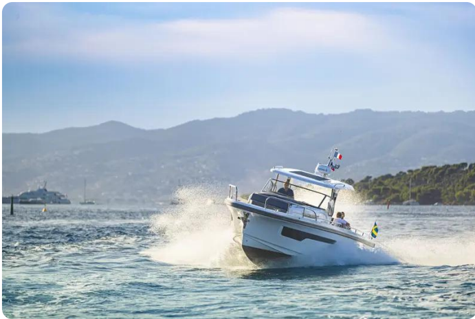
Nimbus Tender 11 (T11) Exterior 3