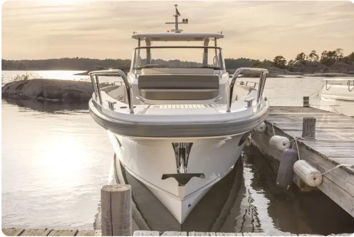
Nimbus Tender 11 (T11) Exterior 5