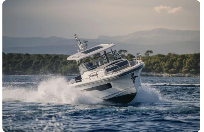
Nimbus Tender 11 (T11) Exterior 12