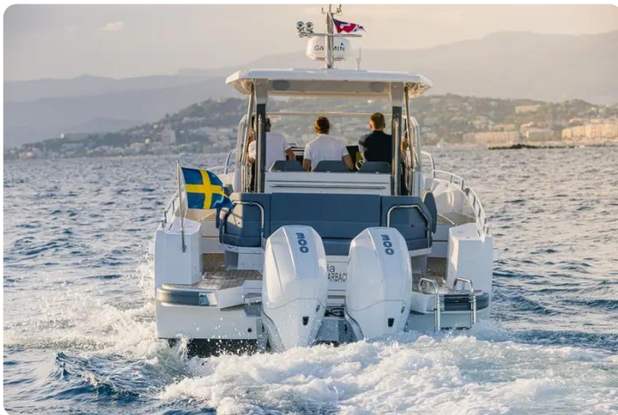
Nimbus Tender 11 (T11) Exterior 13