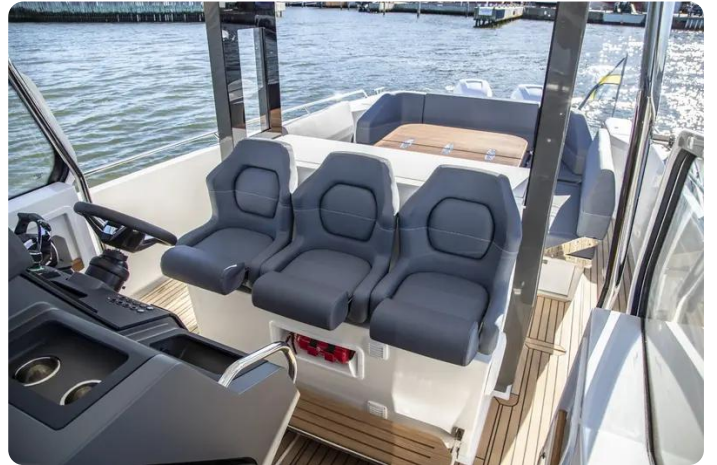
Nimbus Tender 11 (T11) Deck 1