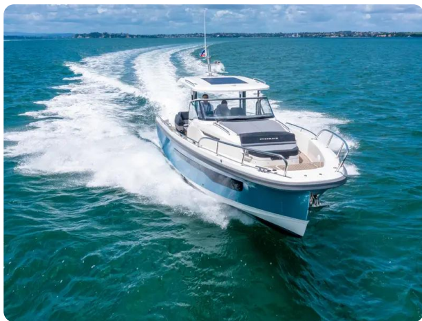
Nimbus Tender 11 (T11) Exterior 6