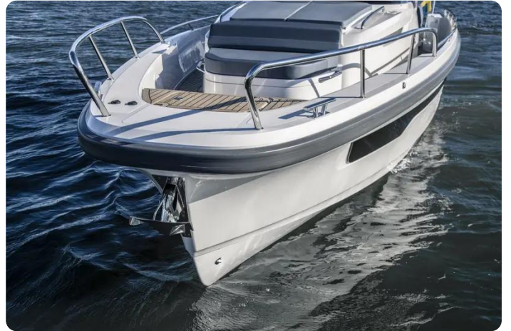
Nimbus Tender 11 (T11) Exterior 4