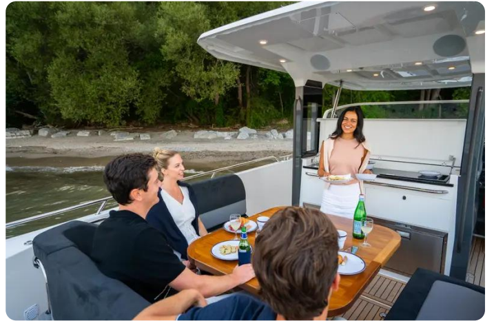
Nimbus Tender 11 (T11) Deck 7