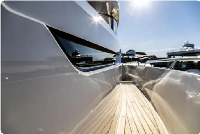
Nimbus Tender 11 (T11) Deck 3