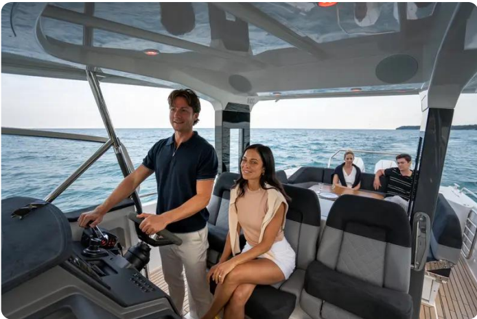
Nimbus Tender 11 (T11) Cabin 1