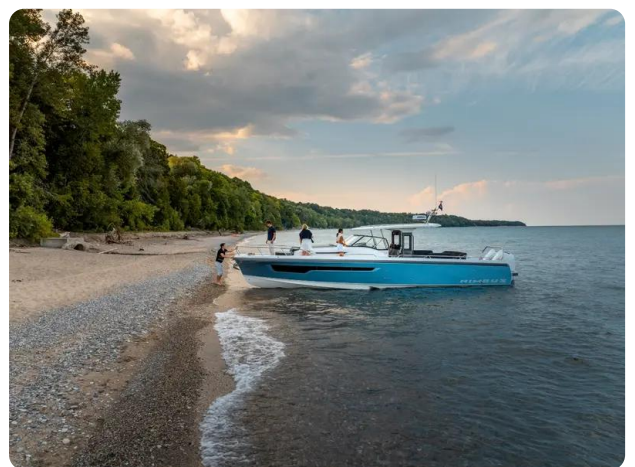
Nimbus Tender 11 (T11) Exterior 8