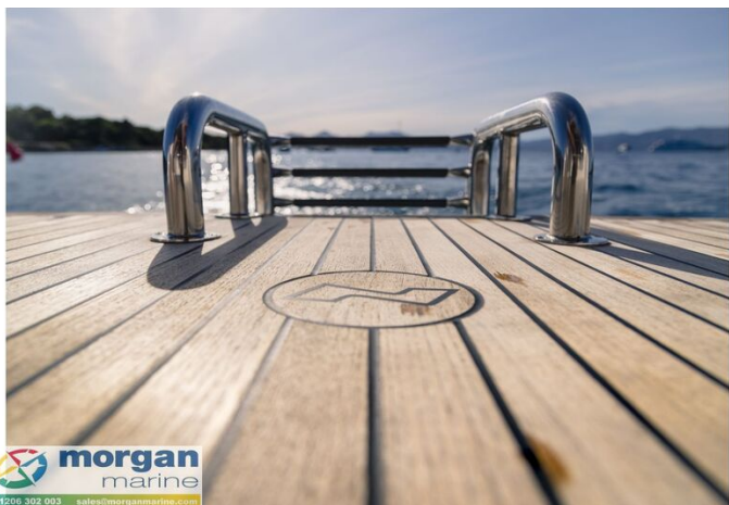
Nimbus 305 Coupe Exterior 21