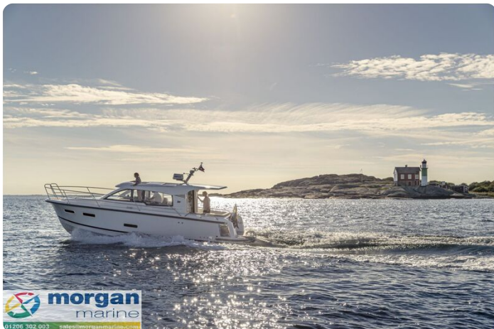
Nimbus 305 Coupe Exterior 2