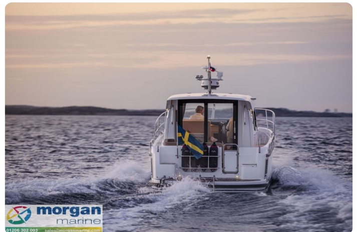
Nimbus 305 Coupe Exterior 4