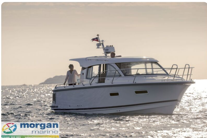
Nimbus 305 Coupe Exterior 1