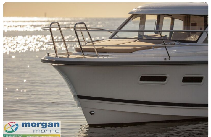
Nimbus 305 Coupe Exterior 7