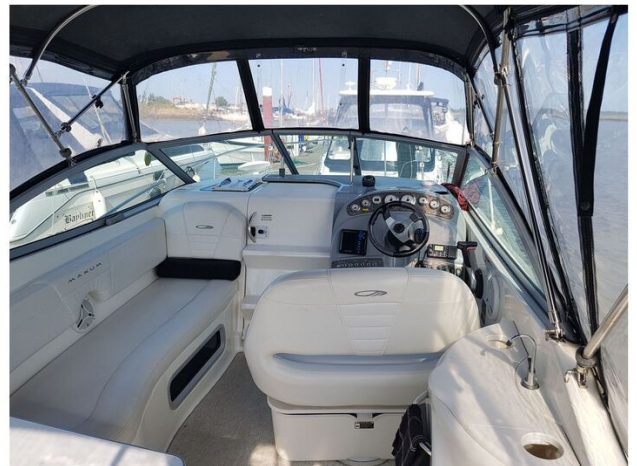
Maxum 2600 SE - cockpit under canopy