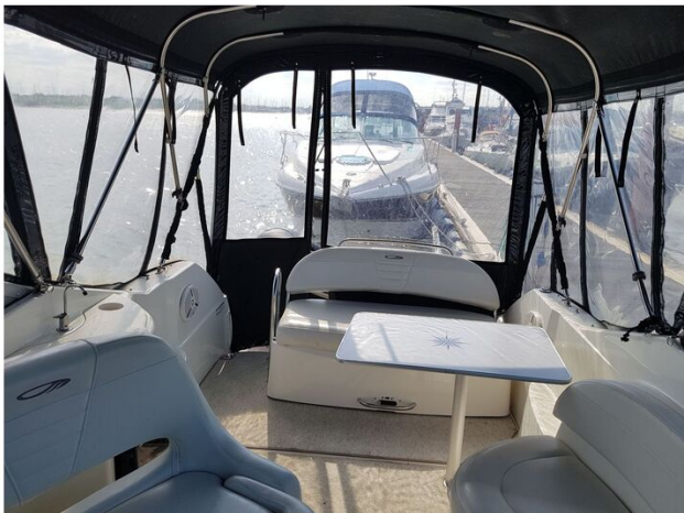
Maxum 2600 SE - looking out of cockpit