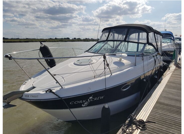
Maxum 2600 SE - port side and bow on pontoon