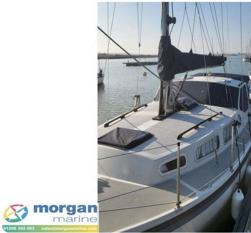
LM 27 Motor Sailer - hatch cover