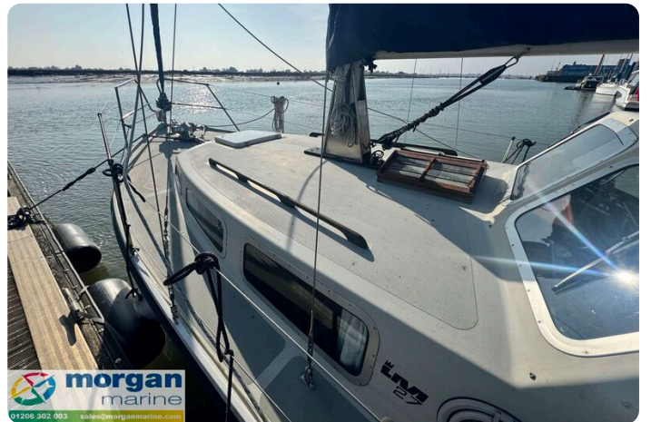
LM 27 Motor Sailer - railings