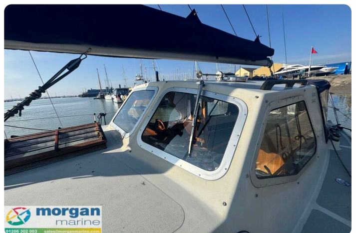
LM 27 Motor Sailer - window