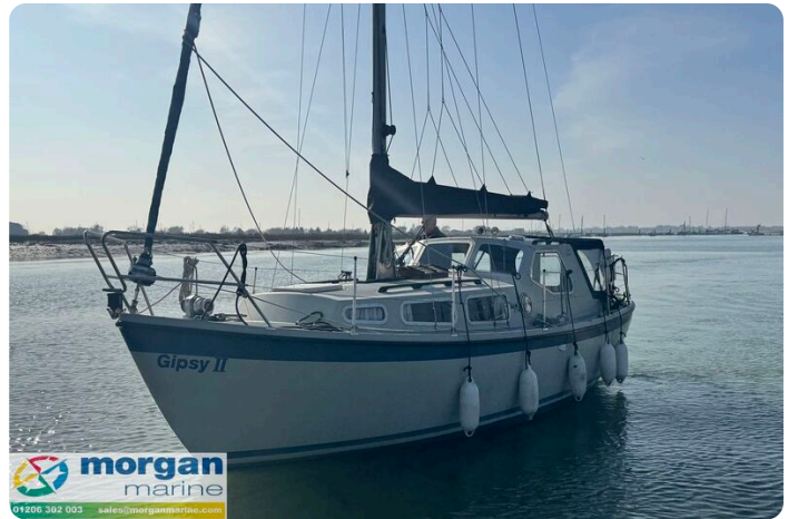
LM 27 Motor Sailer - rails