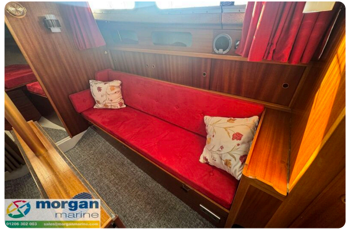
LM 27 Motor Sailer - bench seating