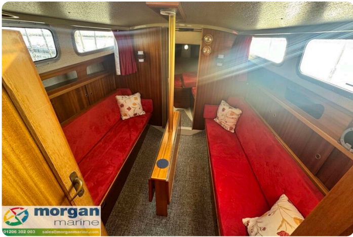
LM 27 Motor Sailer - table