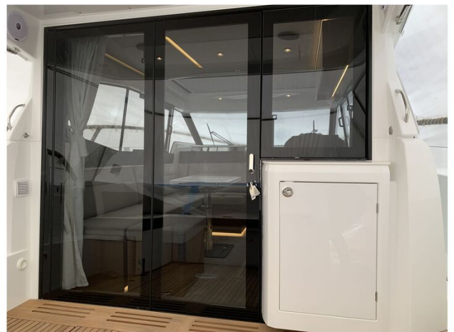
Jeanneau NC 37 twin diesel cruiser - wheelhouse doors