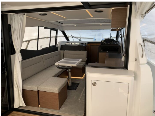
Jeanneau NC 37 twin diesel cruiser - wheelhouse from aft