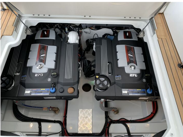
Jeanneau NC 37 twin diesel cruiser - 2x Mercruiser 270HP diesel inboards