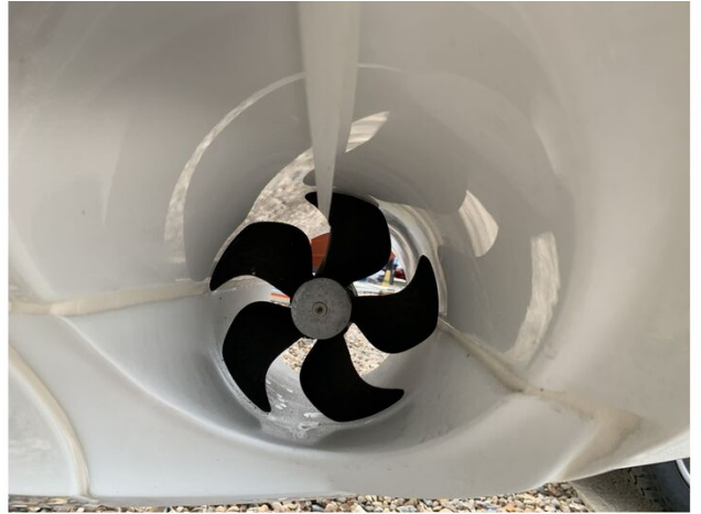
Jeanneau NC 37 twin diesel cruiser - bow thruster