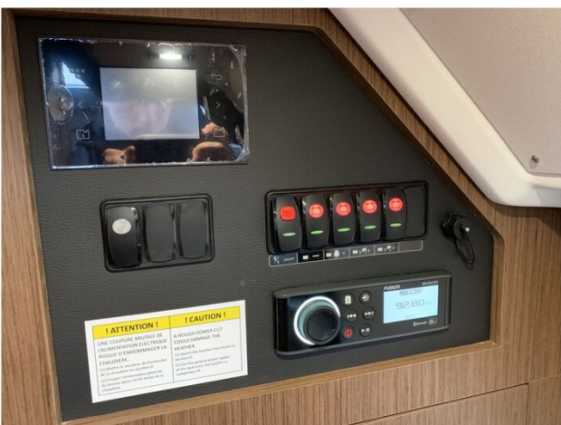
Jeanneau NC 37 twin diesel cruiser - audio controls and switch panel