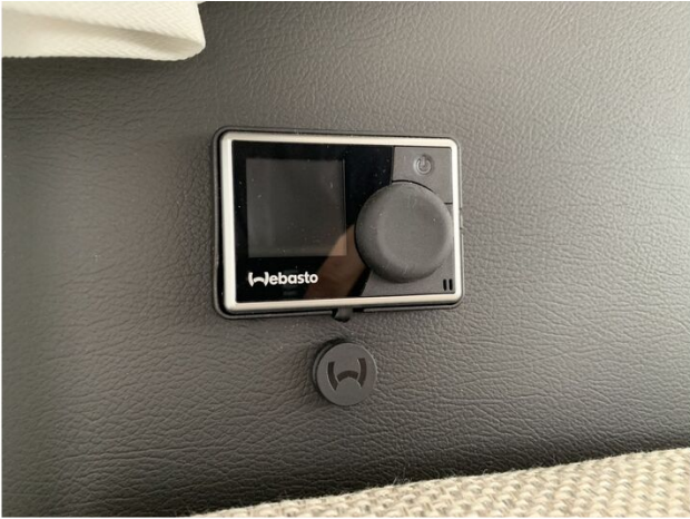
Jeanneau NC 37 twin diesel cruiser - Webasto heating controls