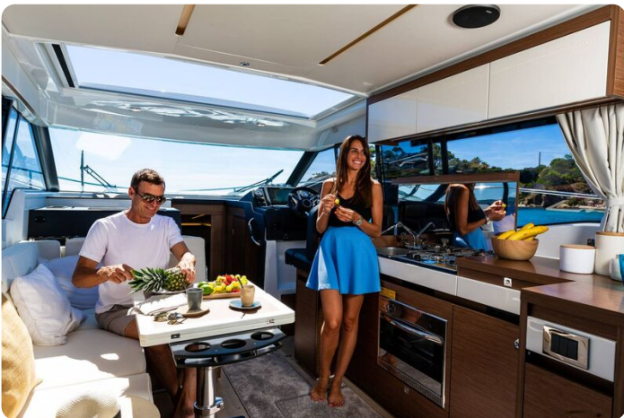
Jeanneau NC 37 twin diesel cruiser - wheelhouse saloon and galley