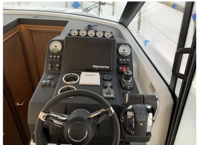
Jeanneau NC 37 twin diesel cruiser - engine controls