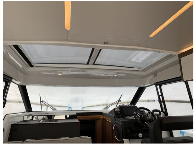
Jeanneau NC 37 twin diesel cruiser - electric sliding roof