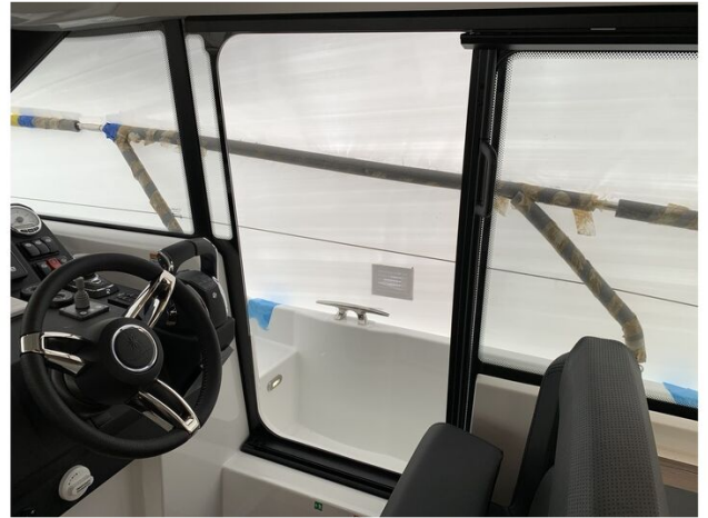
Jeanneau NC 37 twin diesel cruiser - helm side door