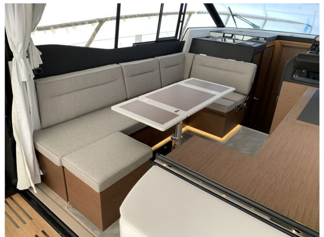
Jeanneau NC 37 twin diesel cruiser - wheelhouse saloon with U shape seating and table