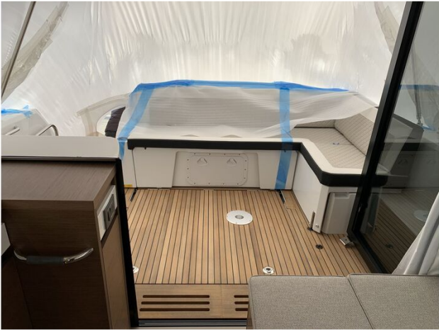
Jeanneau NC 37 twin diesel cruiser - aft sunpad