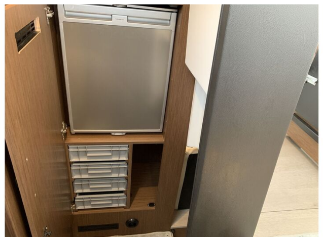
Jeanneau NC 37 twin diesel cruiser - fridge and storage