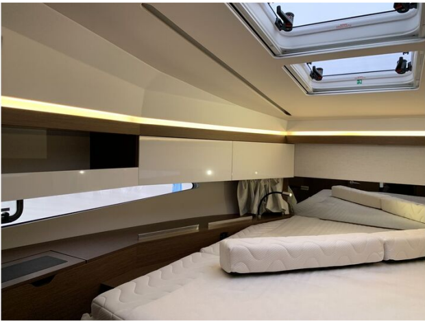
Jeanneau NC 37 twin diesel cruiser - main cabin with 2x hatch to deck