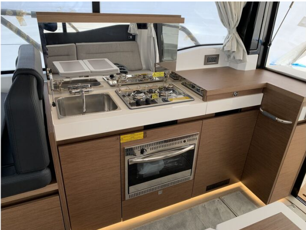
Jeanneau NC 37 twin diesel cruiser - galley with stove, oven and sink