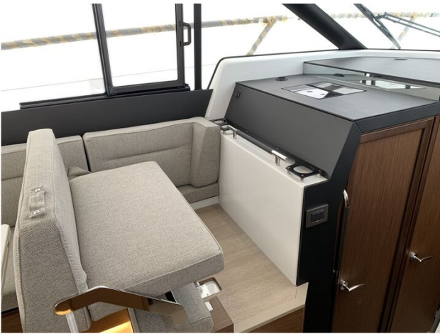
Jeanneau NC 37 twin diesel cruiser - copilot bench