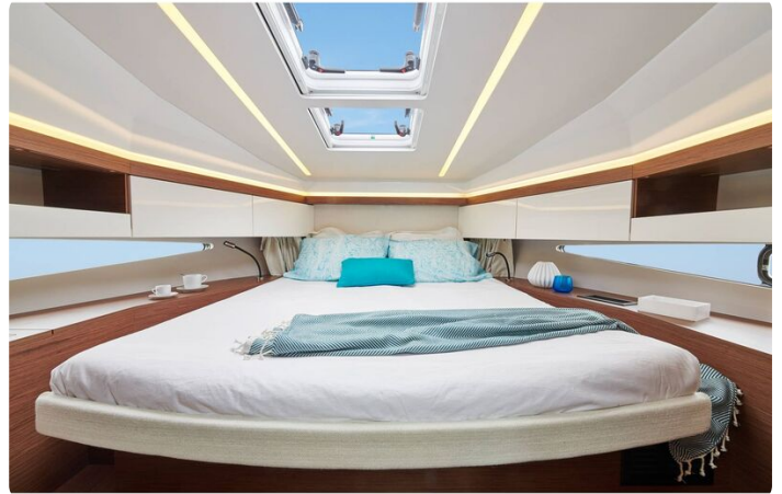
Jeanneau NC 37 twin diesel cruiser - double berth cabin