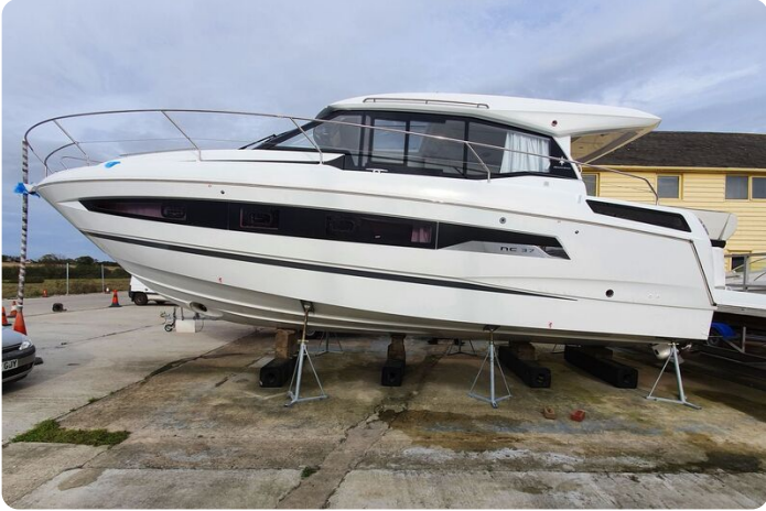
Jeanneau NC 37 twin diesel cruiser