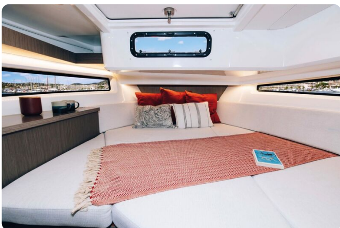
Jeanneau Merry Fisher 895 Sport - forward cabin