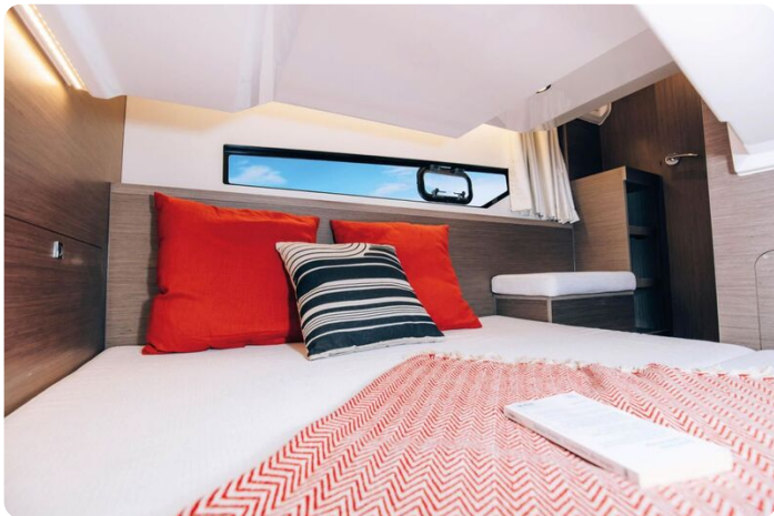
Jeanneau Merry Fisher 895 Sport - aft cabin