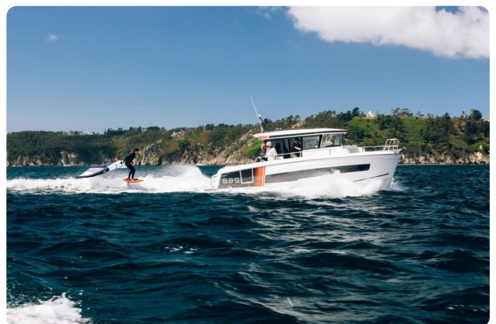
Jeanneau Merry Fisher 895 Sport - moving through the water