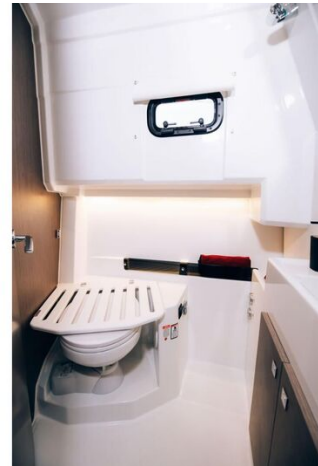
Jeanneau Merry Fisher 895 Sport - toilet and shower compartment