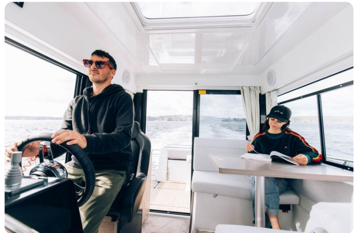
Jeanneau Merry Fisher 895 Sport - view from cabin steps through wheelhouse to aft