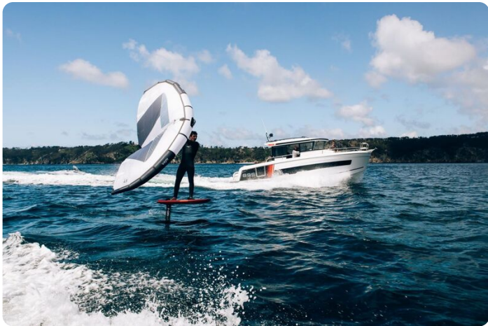
Jeanneau Merry Fisher 895 Sport - fun on the water