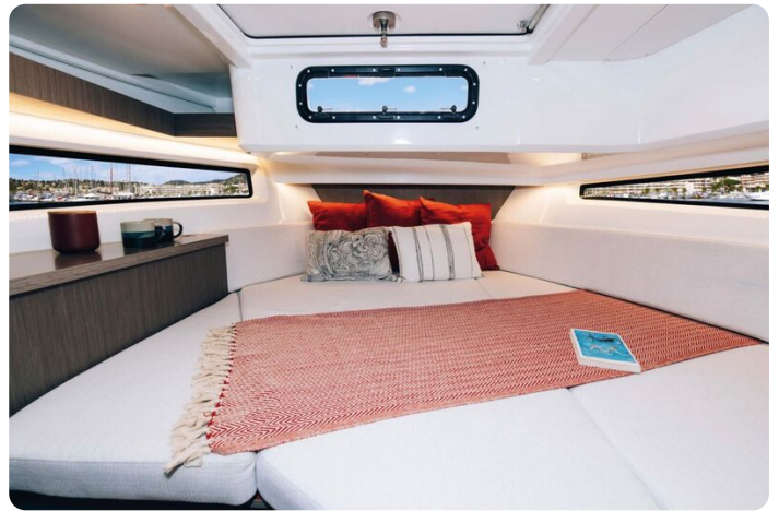
Jeanneau Merry Fisher 895 Sport - Series 2 - forward cabin