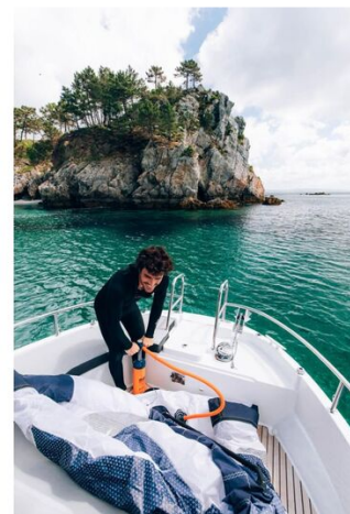
Jeanneau Merry Fisher 895 Sport - Series 2 - bow seating