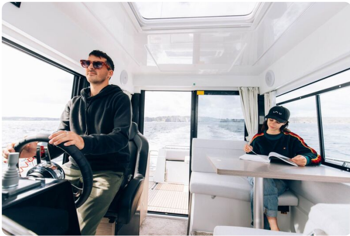
Jeanneau Merry Fisher 895 Sport - Series 2 - helm position and saloon