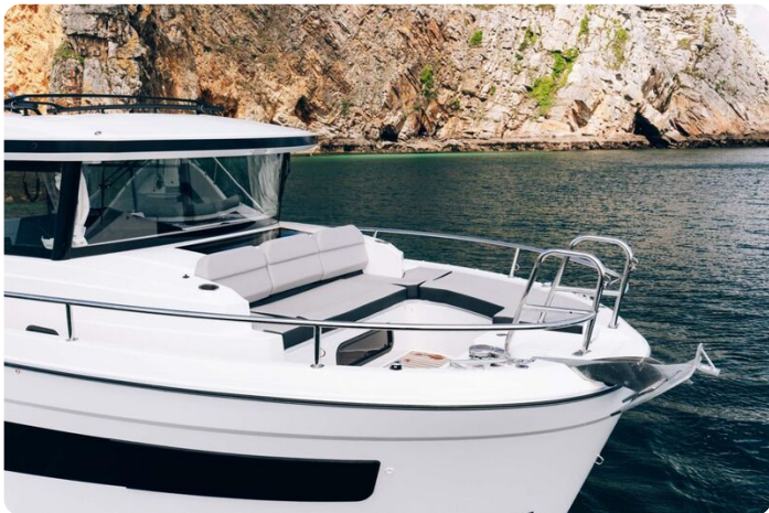
Jeanneau Merry Fisher 895 Sport - Series 2 - bow cushions