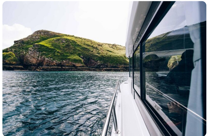
Jeanneau Merry Fisher 895 Sport - Series 2 - port side