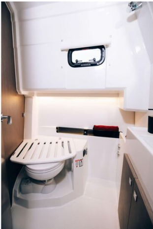
Jeanneau Merry Fisher 895 Sport - Series 2 - toilet and shower compartment