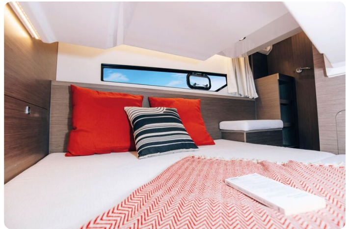
Jeanneau Merry Fisher 895 Sport - Series 2 - aft cabin