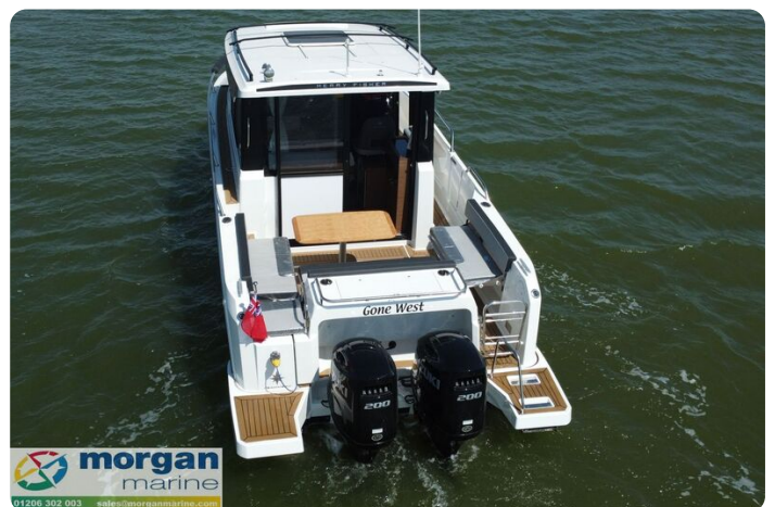
Merry Fisher 895 Sport - back engine