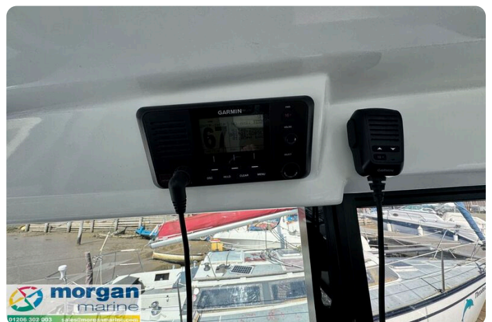
Jeanneau Merry Fisher 895 Sport Gone West - VHF radio