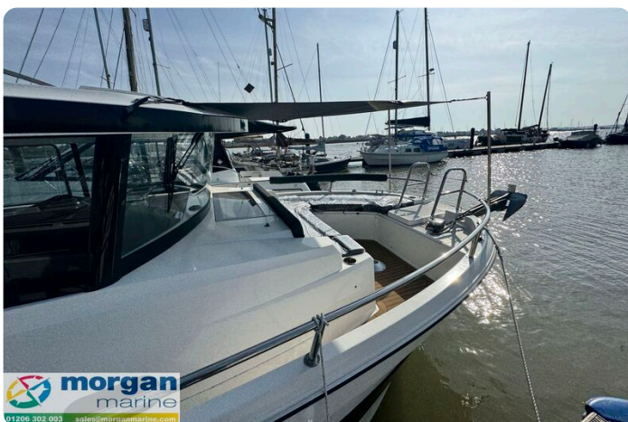
Jeanneau Merry Fisher 895 Sport - sun shade