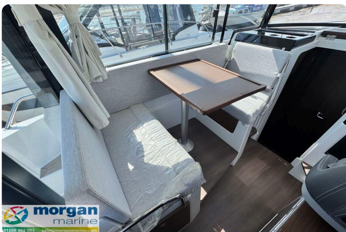
Jeanneau Merry Fisher 895 Sport Gone West - saloon table