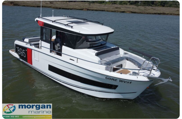
Merry Fisher 895 Sport - side