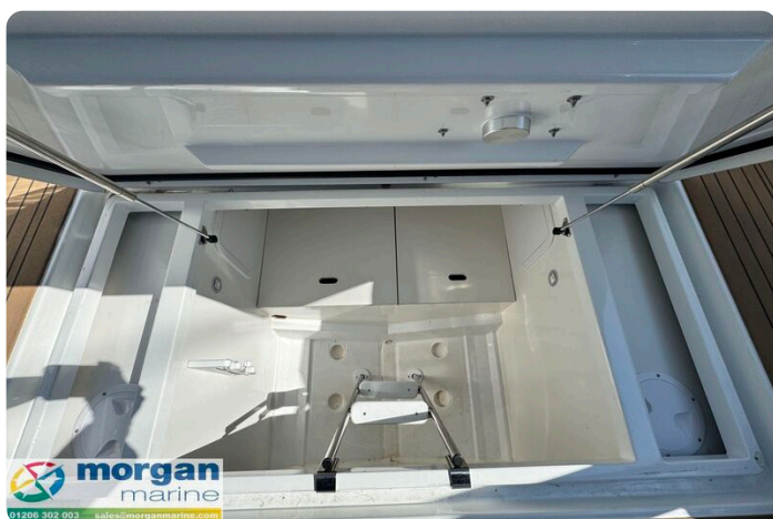
Jeanneau Merry Fisher 895 Sport Gone West - locker