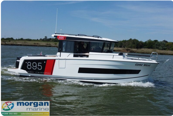
Merry Fisher 895 Sport - side door