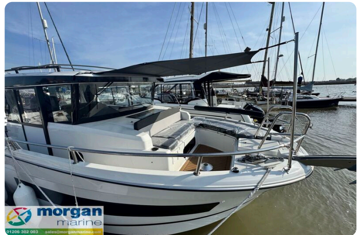
Jeanneau Merry Fisher 895 Sport - sun shade 02