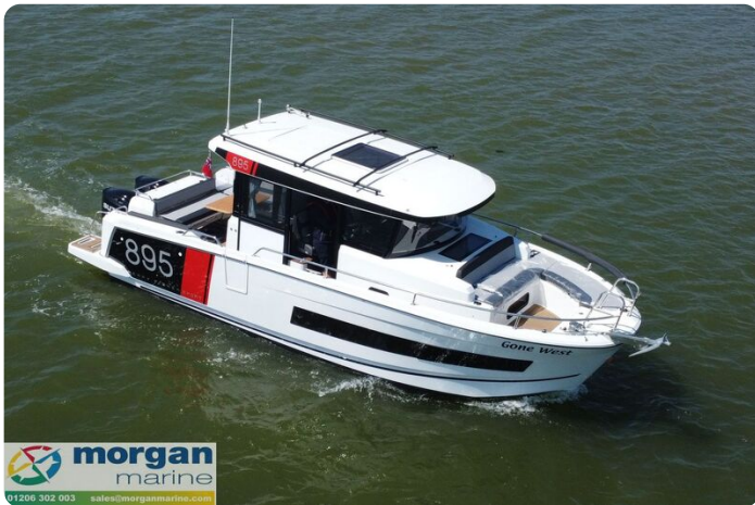
Merry Fisher 895 Sport - roof bars