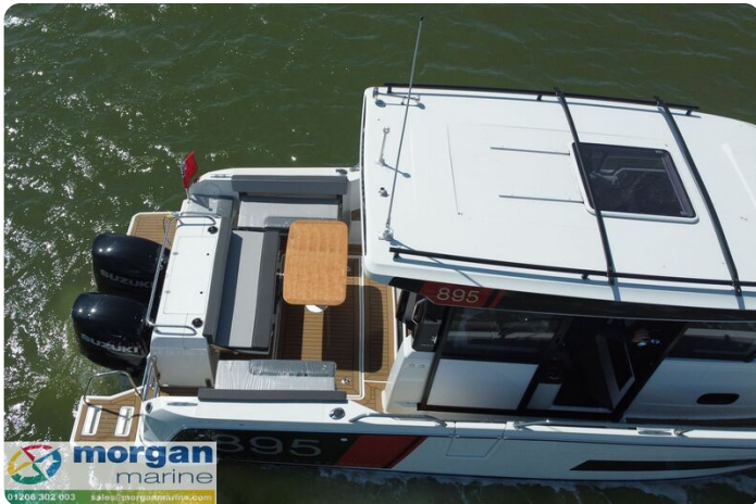
Merry Fisher 895 Sport - seating