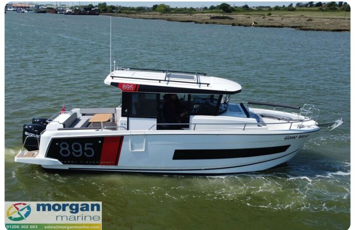
Merry Fisher 895 Sport - side on