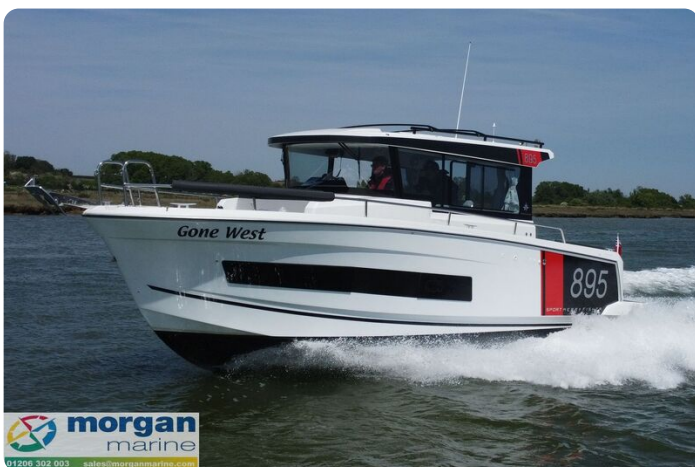
Merry Fisher 895 Sport - speed