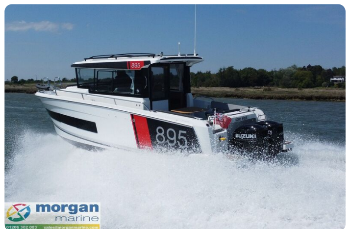
Merry Fisher 895 Sport - speed side