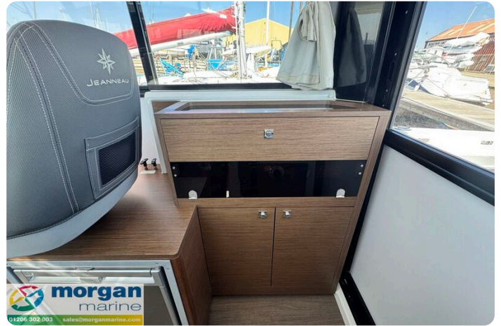
Jeanneau Merry Fisher 895 Sport Gone West - storage