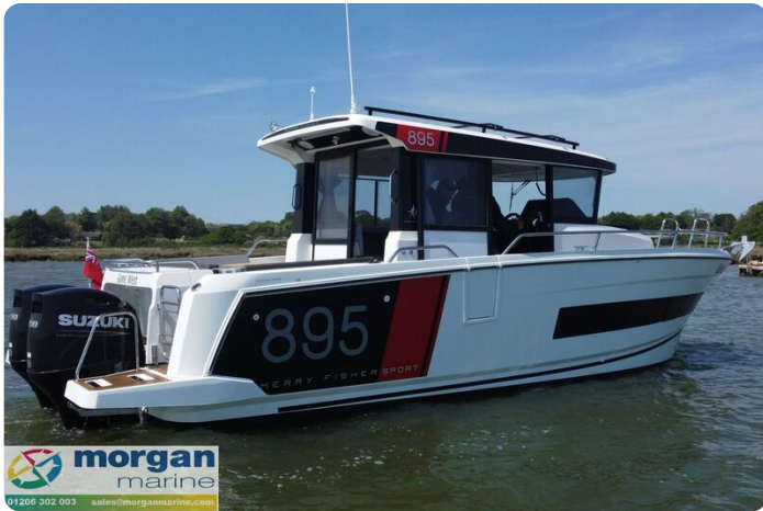
Merry Fisher 895 Sport - back