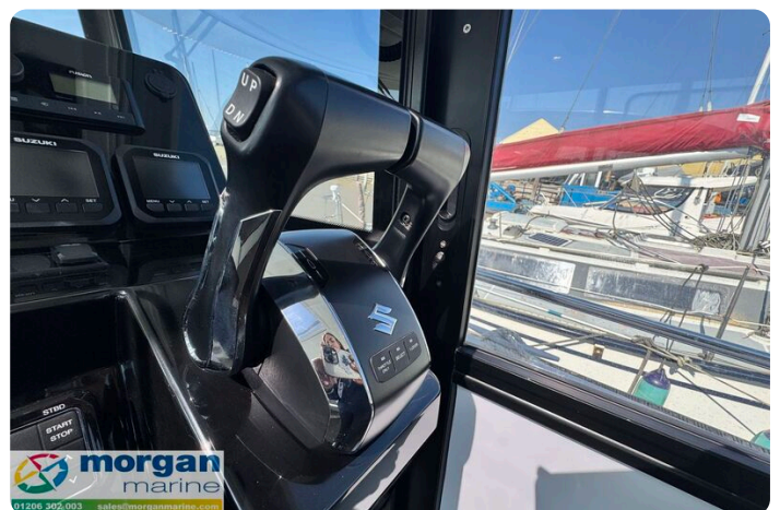
Jeanneau Merry Fisher 895 Sport Gone West - throttle linkage