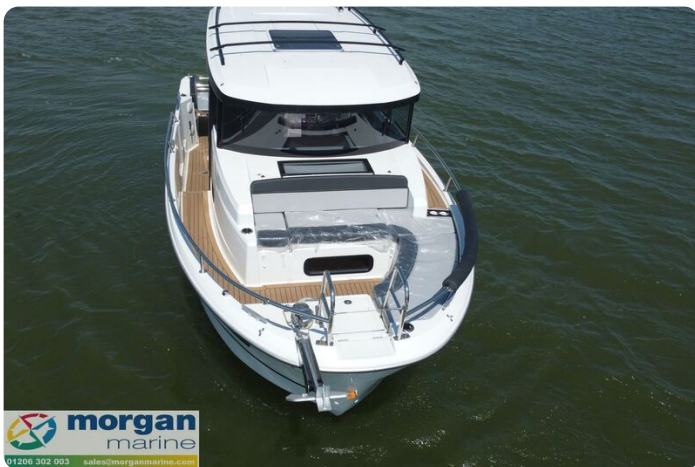
Merry Fisher 895 Sport - bow