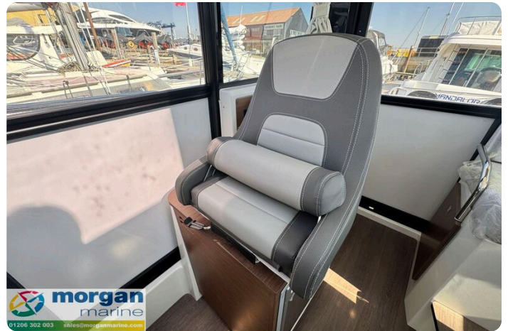
Jeanneau Merry Fisher 895 Sport Gone West - pilot