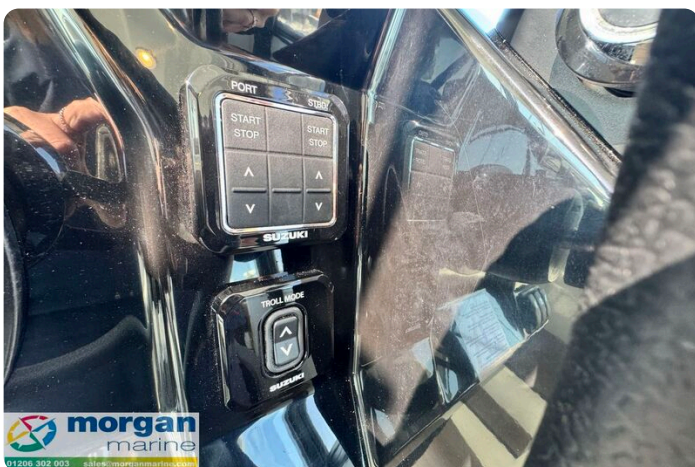
Jeanneau Merry Fisher 895 Sport Gone West - Suzuki