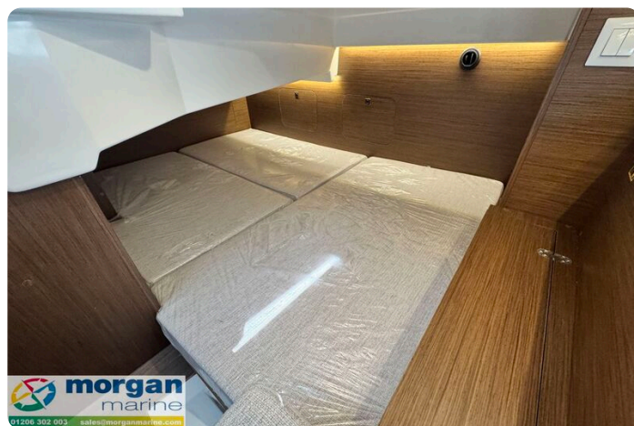
Jeanneau Merry Fisher 895 Sport Gone West - 2nd cabin