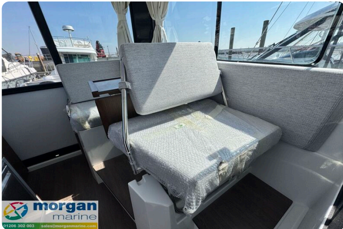
Jeanneau Merry Fisher 895 Sport Gone West - co pilot seat