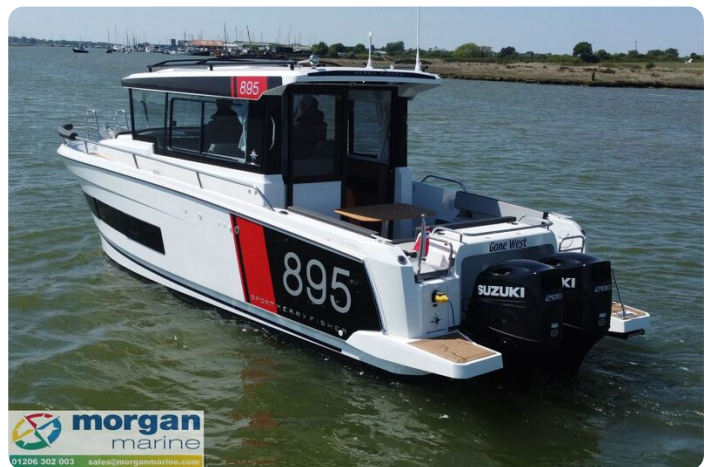
Merry Fisher 895 Sport - platform