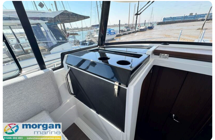
Jeanneau Merry Fisher 895 Sport Gone West - galley