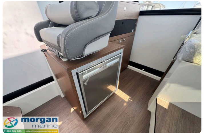
Jeanneau Merry Fisher 895 Sport Gone West - fridge