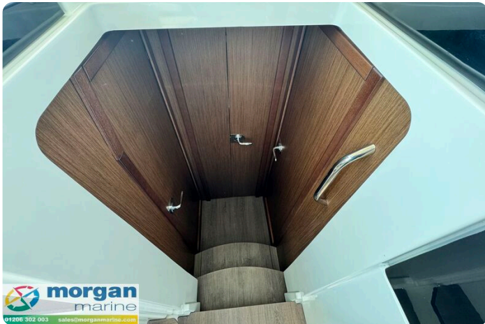
Jeanneau Merry Fisher 895 Sport Gone West - steps