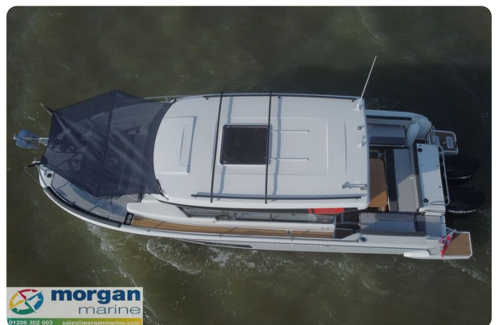
Jeanneau Merry Fisher 895 Sport - roof