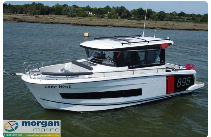
Merry Fisher 895 Sport - Main