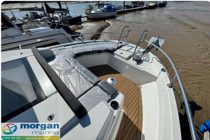
Jeanneau Merry Fisher 895 Sport Gone West - Front cockpit