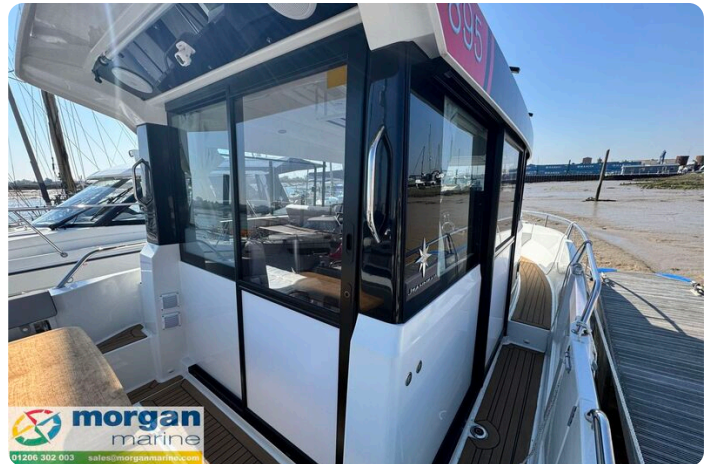
Jeanneau Merry Fisher 895 Sport Gone West - Door