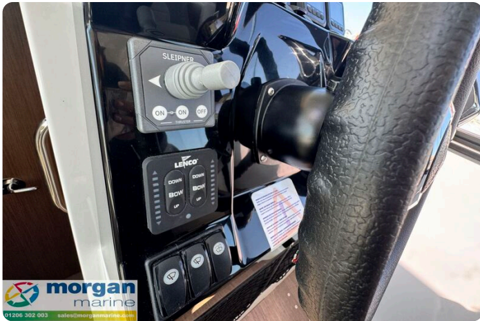
Jeanneau Merry Fisher 895 Sport Gone West - bow thruster