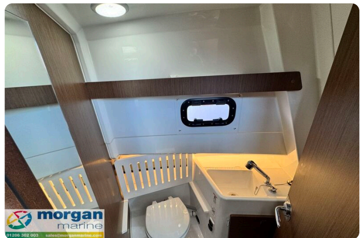
Jeanneau Merry Fisher 895 Sport Gone West - toilet