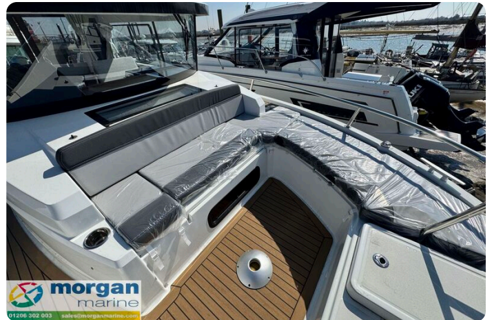
Jeanneau Merry Fisher 895 Sport Gone West - front sun seating