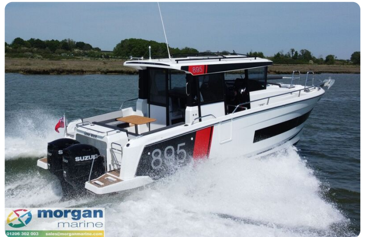
Merry Fisher 895 Sport - speed back