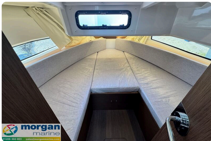
Jeanneau Merry Fisher 895 Sport Gone West - main berth