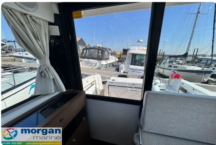
Jeanneau Merry Fisher 895 Sport Gone West - side door