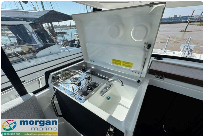
Jeanneau Merry Fisher 895 Sport Gone West - cooker