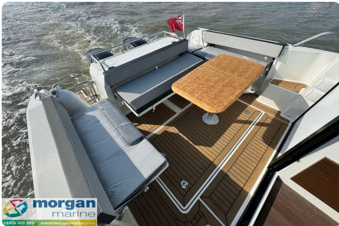
Jeanneau Merry Fisher 895 Sport - cockpit