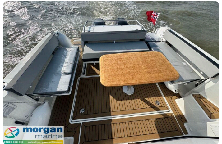
Jeanneau Merry Fisher 895 Sport - table