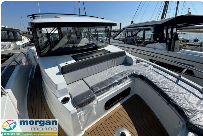
Jeanneau Merry Fisher 895 Sport Gone West - cockpit seating