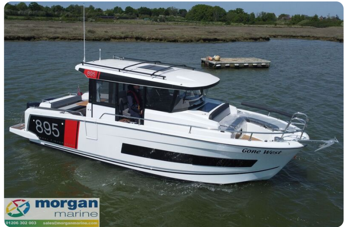
Merry Fisher 895 Sport - rails