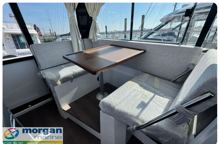
Jeanneau Merry Fisher 895 Sport Gone West - table