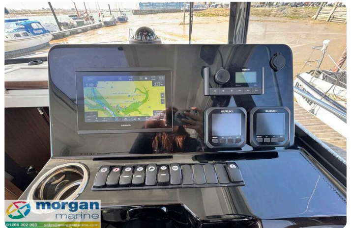
Jeanneau Merry Fisher 895 Sport Gone West - Garmin