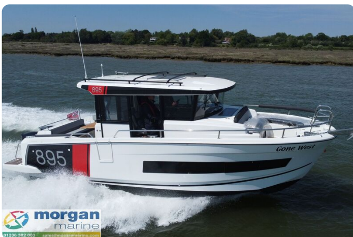
Merry Fisher 895 Sport - side speed