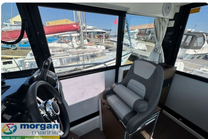
Jeanneau Merry Fisher 895 Sport Gone West - pilot seat