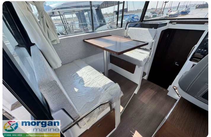
Jeanneau Merry Fisher 895 Sport Gone West - saloon seating