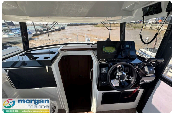
Jeanneau Merry Fisher 895 Sport Gone West - dash