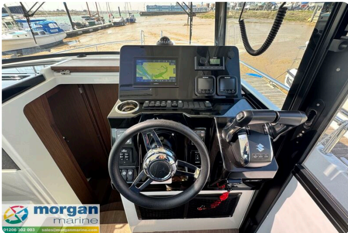
Jeanneau Merry Fisher 895 Sport Gone West - dash