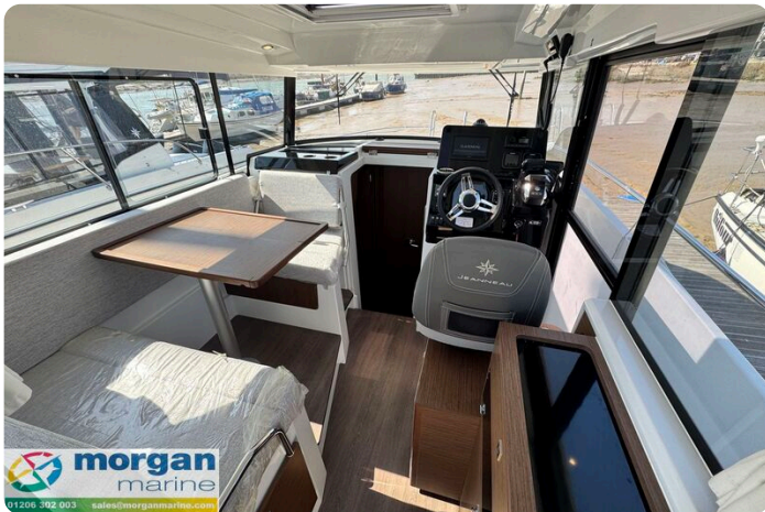
Jeanneau Merry Fisher 895 Sport Gone West - saloon