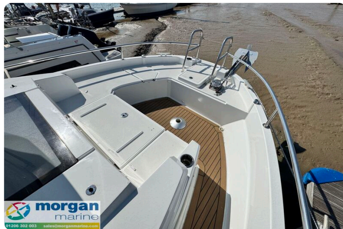
Jeanneau Merry Fisher 895 Sport Gone West - front cockpit