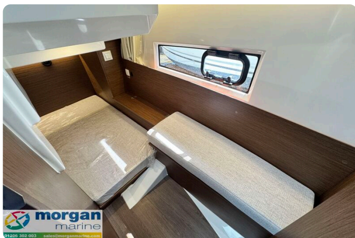
Jeanneau Merry Fisher 895 Sport Gone West - 2nd cabin seating