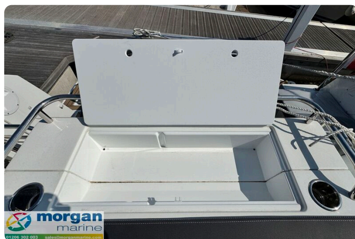
Jeanneau Merry Fisher 895 Sport Gone West - storage