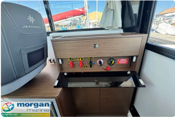
Jeanneau Merry Fisher 895 Sport Gone West - isolators