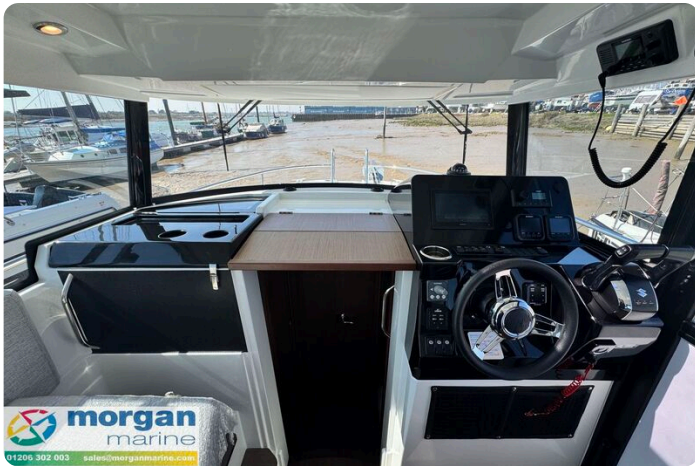
Jeanneau Merry Fisher 895 Sport Gone West - dash