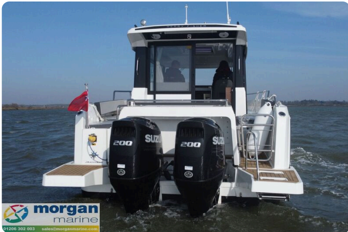
Jeanneau Merry Fisher 895 Sport - outboards