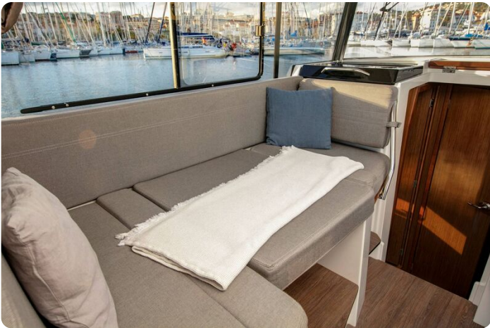
Jeanneau Merry Fisher 895 Sport - wheelhouse saloon seating with berth infill