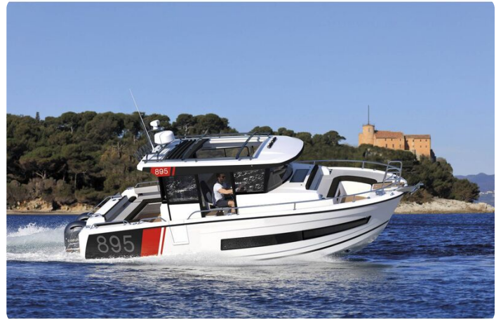
Jeanneau Merry Fisher 895 Sport - planing on the water