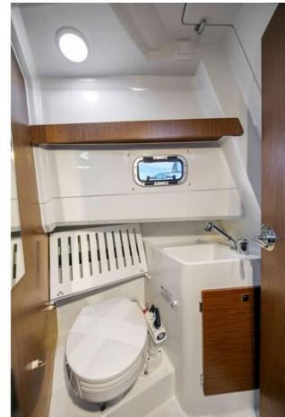
Jeanneau Merry Fisher 895 Sport - toilet compartment