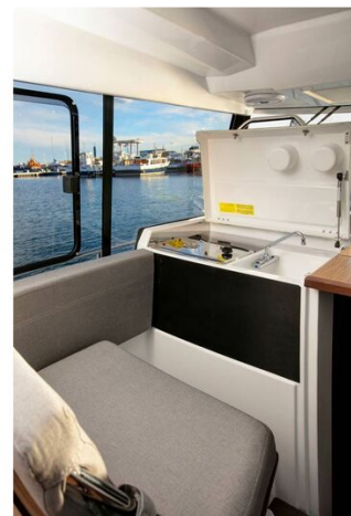
Jeanneau Merry Fisher 895 Sport - co-pilot bench