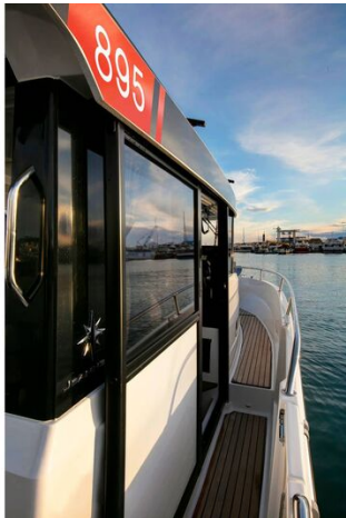
Jeanneau Merry Fisher 895 Sport - side deck towards bow