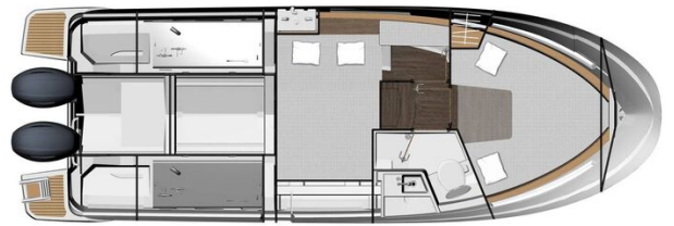
Jeanneau Merry Fisher 895 Sport - layout diagram of cabins