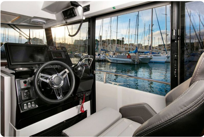
Jeanneau Merry Fisher 895 Sport - helm position and side door