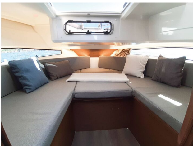
Jeanneau Merry Fisher 895 Sport - forward cabin with hatch to deck