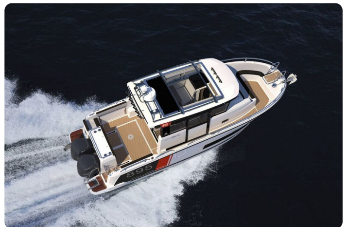
Jeanneau Merry Fisher 895 Sport - overhead view