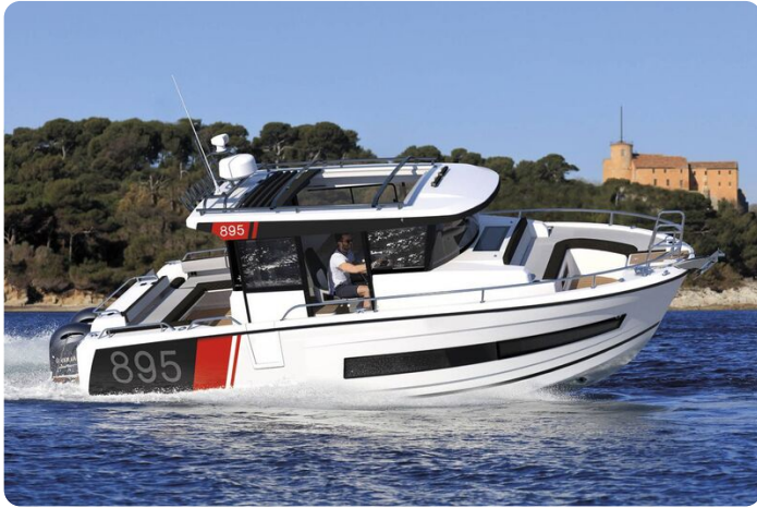
Jeanneau Merry Fisher 895 Sport