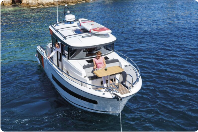
Jeanneau Merry Fisher 895 Sport