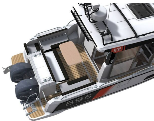
Jeanneau Merry Fisher 895 Sport - render of aft cockpit