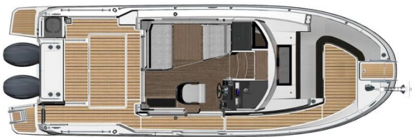
Jeanneau Merry Fisher 895 Sport - layout diagram of deck and wheelhouse interior