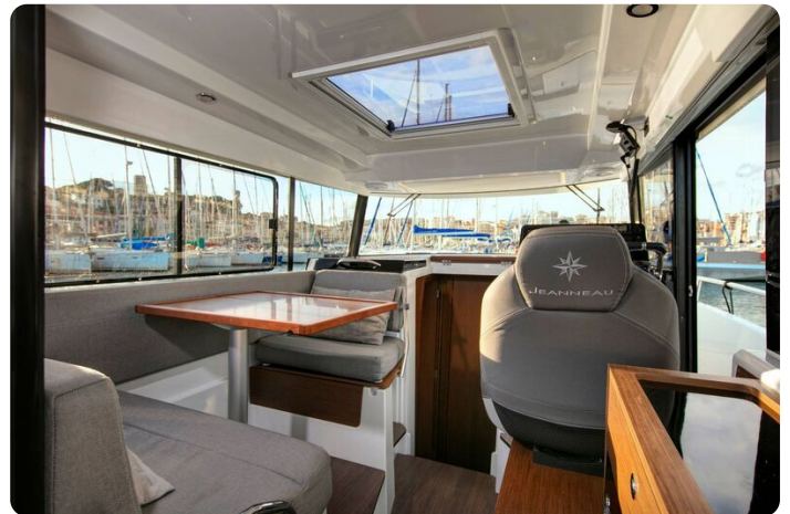
Jeanneau Merry Fisher 895 Sport - wheelhouse with port side seating + table and starboard side helm position