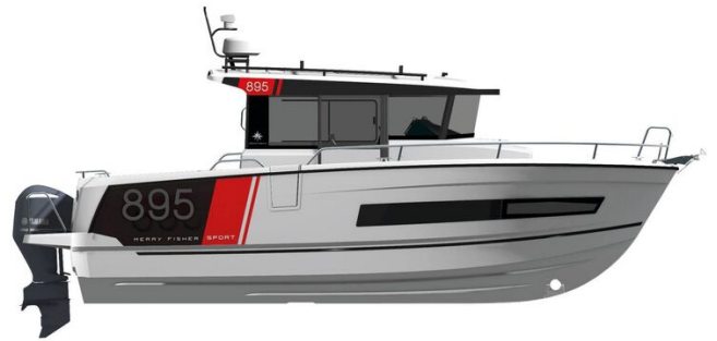
Jeanneau Merry Fisher 895 Sport - layout diagram of starboard side