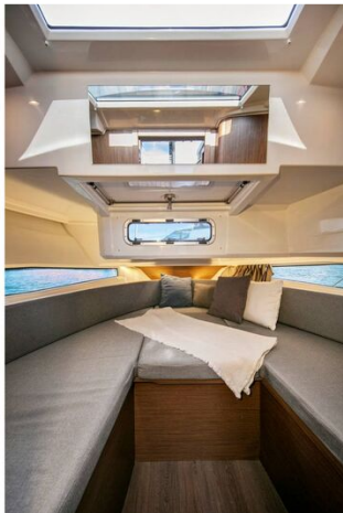
Jeanneau Merry Fisher 895 Sport - entrance to forward cabin