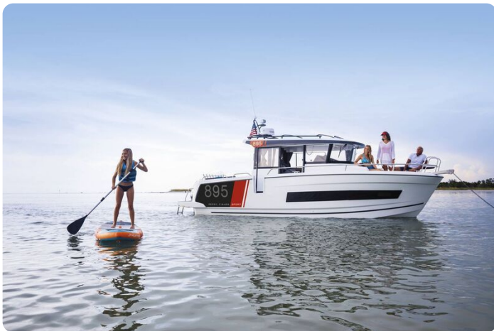
Jeanneau Merry Fisher 895 Sport - great for water-sports and fun on the water