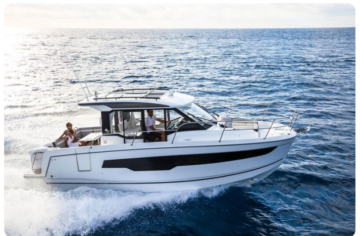
New Jeanneau Merry Fisher 895 - on the water