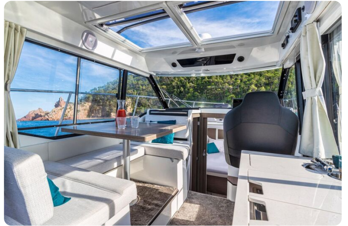
New Jeanneau Merry Fisher 895 - wheelhouse with port side saloon seating and starboard side galley