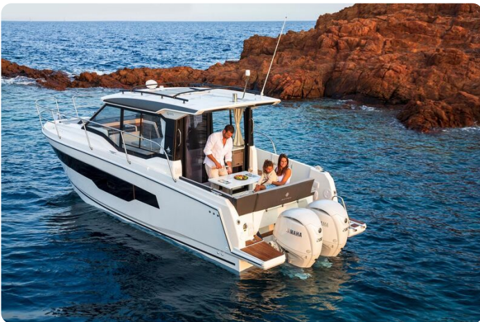
New Jeanneau Merry Fisher 895 - overhead view of transom and swim platform