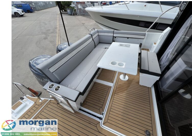
New Jeanneau Merry Fisher 895 - aft cockpit U shape seating