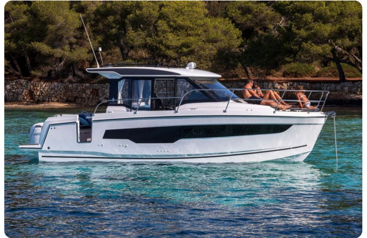
New Jeanneau Merry Fisher 895 - starboard side gate for easy access to moorings