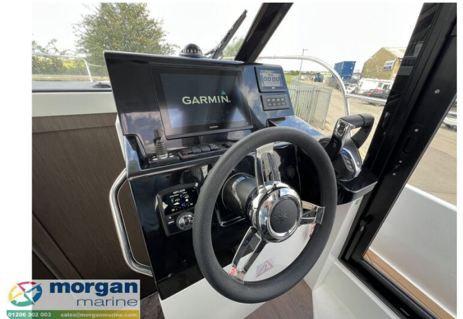
New Jeanneau Merry Fisher 895 - helm position and engine controls