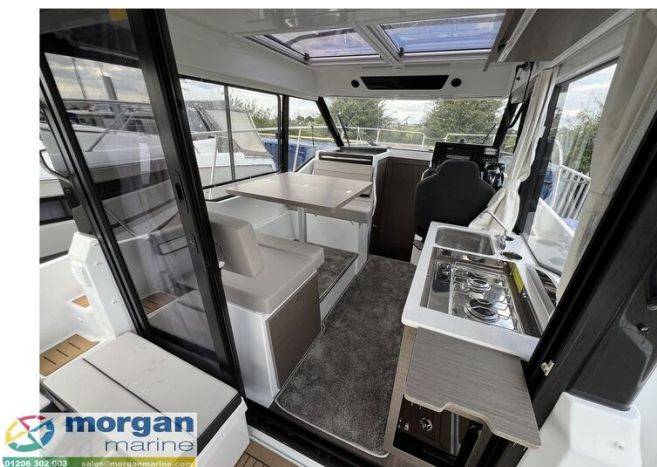
New Jeanneau Merry Fisher 895 - view from aft through wheelhouse