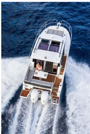
New Jeanneau Merry Fisher 895 - overhead view from aft