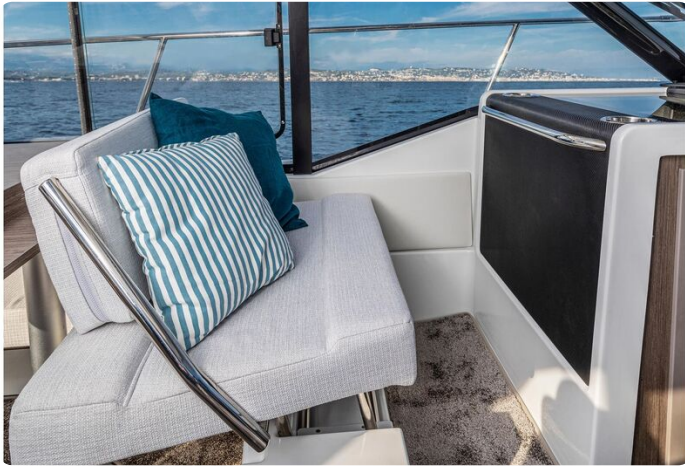
New Jeanneau Merry Fisher 895 - co-pilot seat