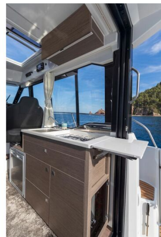
New Jeanneau Merry Fisher 895 - starboard side galley in wheelhouse