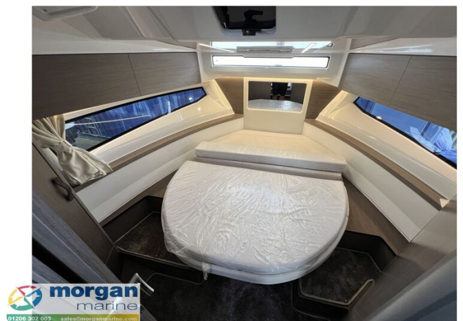
New Jeanneau Merry Fisher 895 - forward cabin