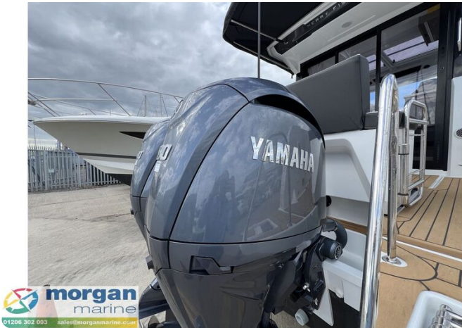
New Jeanneau Merry Fisher 895 - twin Yamaha outboards