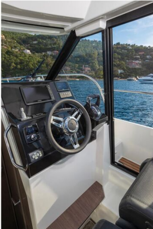
New Jeanneau Merry Fisher 895 - helm position