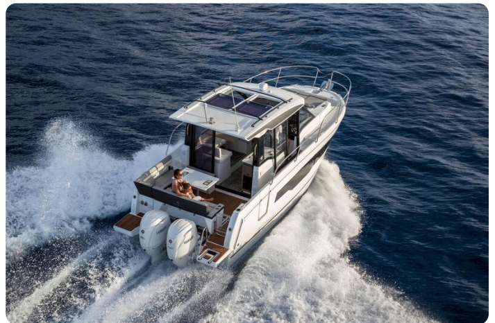
New Jeanneau Merry Fisher 895 - overhead view of cockpit seating