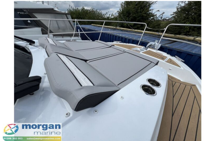
New Jeanneau Merry Fisher 895 - front sunpad