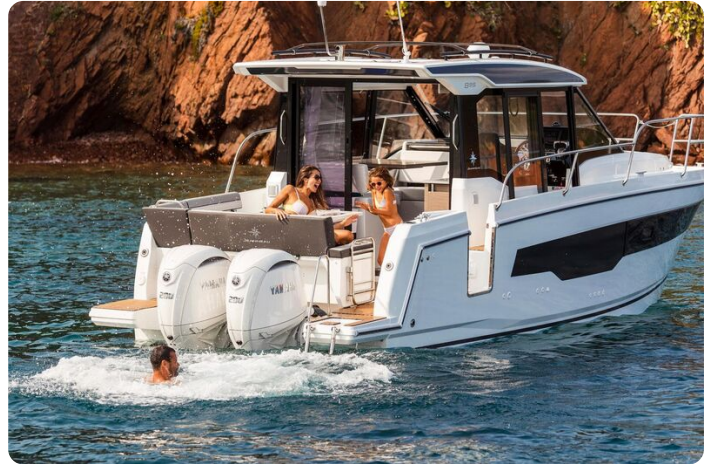
New Jeanneau Merry Fisher 895 - starboard side aft