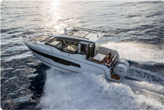
New Jeanneau Merry Fisher 895 - overhead view from port side