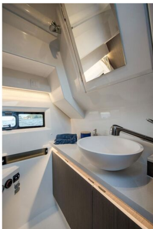
New Jeanneau Merry Fisher 895 - toilet compartment