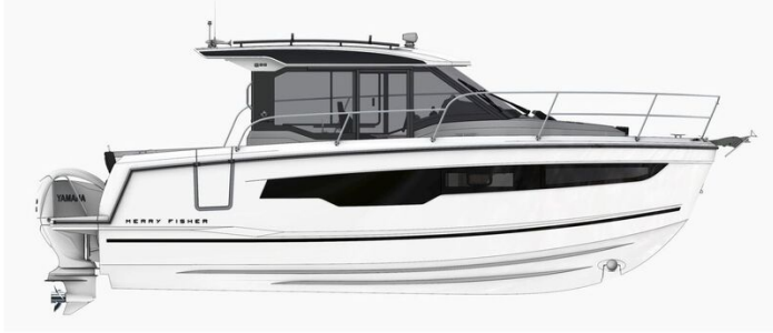
New Jeanneau Merry Fisher 895 - diagram of starboard side