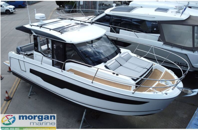
New Jeanneau Merry Fisher 895