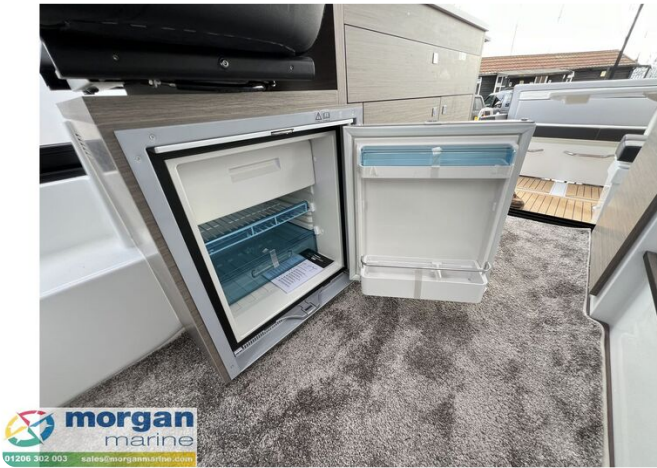
Jeanneau Merry Fisher 895 Series 2 - fridge