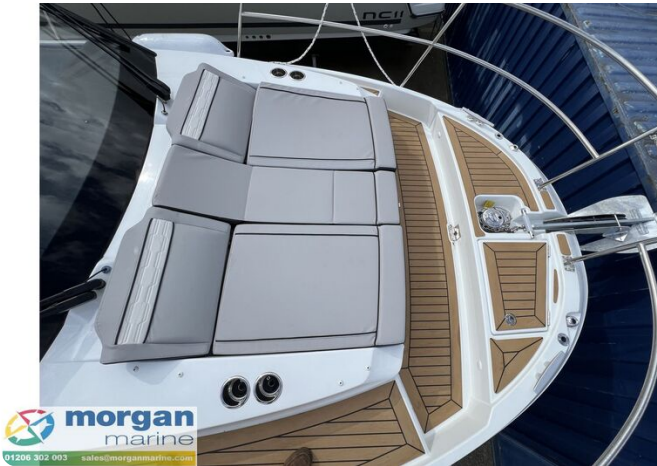
Jeanneau Merry Fisher 895 Series 2 - 3x bow seats