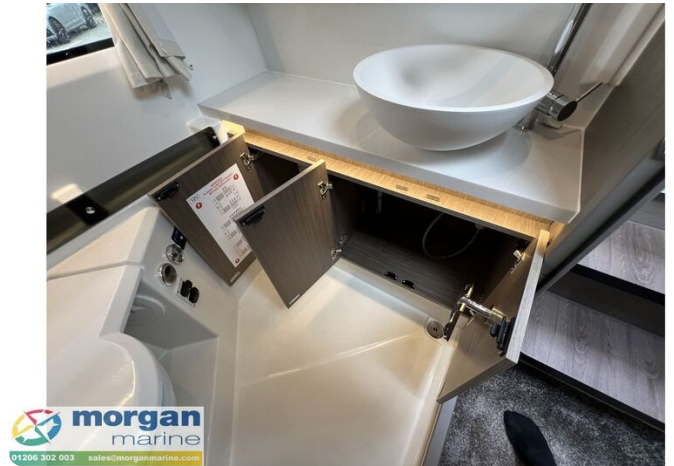
Jeanneau Merry Fisher 895 Series 2 - wash basin