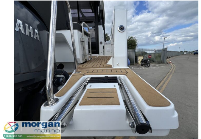
Jeanneau Merry Fisher 895 Series 2 - swim platform with folding boarding ladder