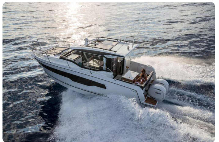
Jeanneau Merry Fisher 895 - port side