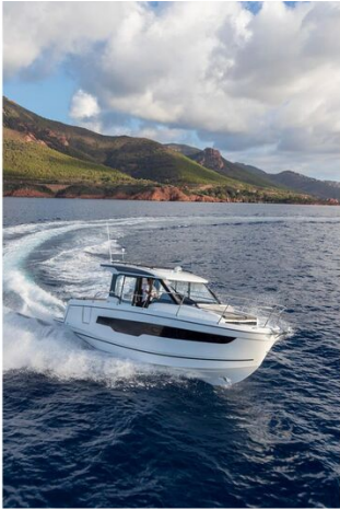
Jeanneau Merry Fisher 895 - on the water with large wake