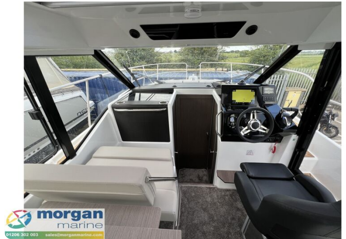
Jeanneau Merry Fisher 895 Series 2 - view from wheelhouse aft to cabin