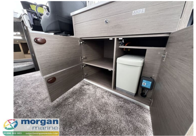
Jeanneau Merry Fisher 895 Series 2 - storage in galley