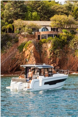
Jeanneau Merry Fisher 895 - near a chateaux