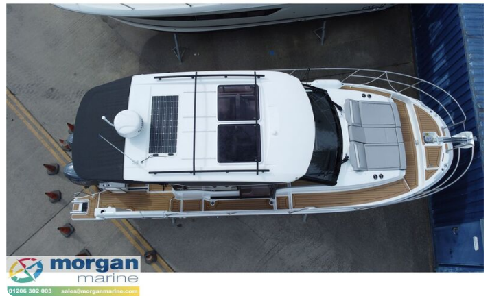
Jeanneau Merry Fisher 895 Series 2 - overhead view