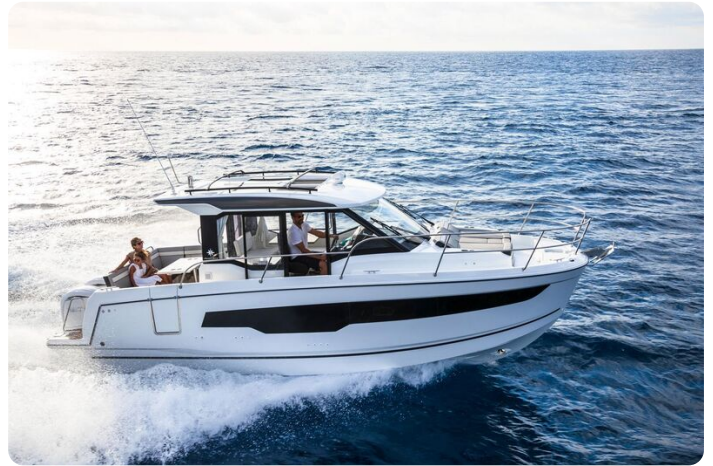
Jeanneau Merry Fisher 895 - starboard side view