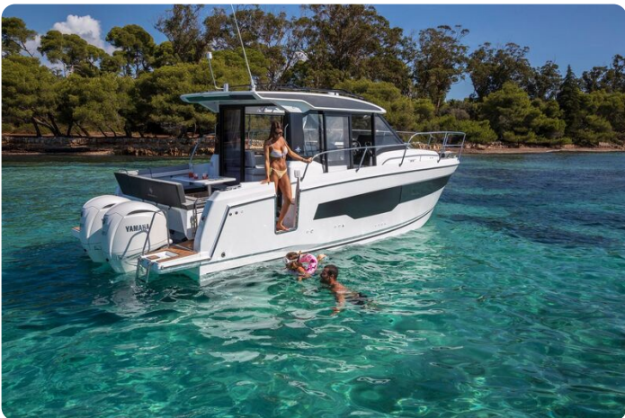
Jeanneau Merry Fisher 895 - wide boarding door on starboard side