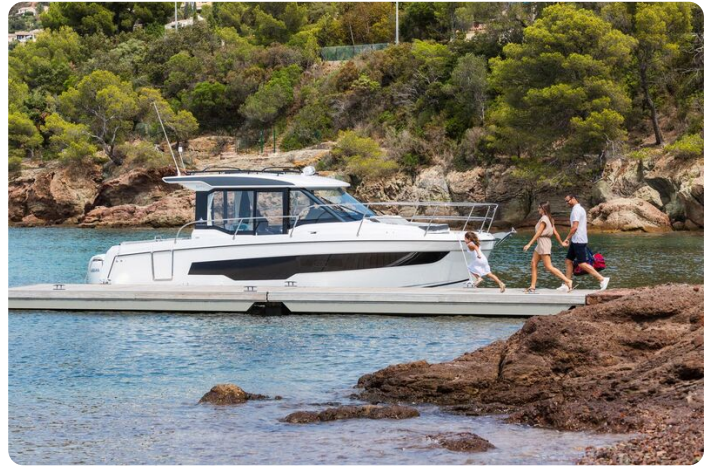
Jeanneau Merry Fisher 895 - walking along the pontoon