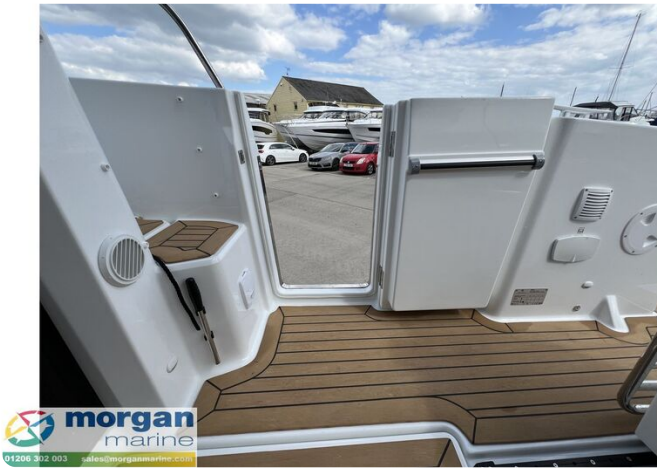
Jeanneau Merry Fisher 895 Series 2 - cockpit side gate