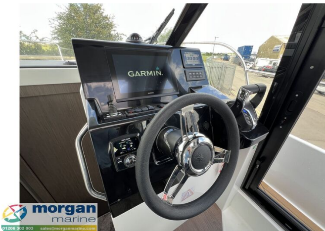
Jeanneau Merry Fisher 895 Series 2 - helm position and side door