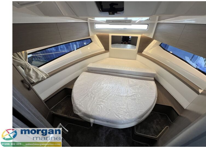
Jeanneau Merry Fisher 895 Series 2 - forward cabin