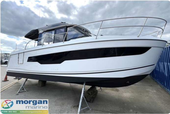
Jeanneau Merry Fisher 895 Series 2 - starboard side