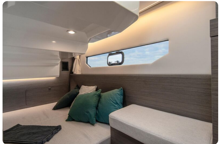
Jeanneau Merry Fisher 895 - aft cabin