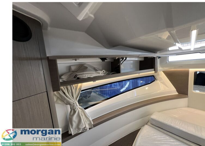
Jeanneau Merry Fisher 895 Series 2 - storage and large window