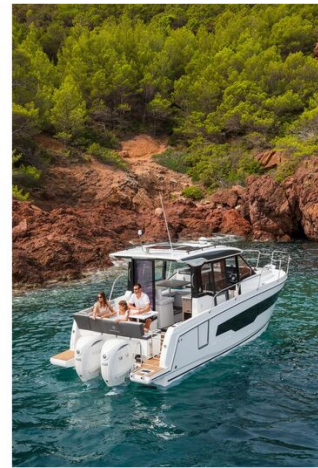
Jeanneau Merry Fisher 895 - in beautiful surroundings