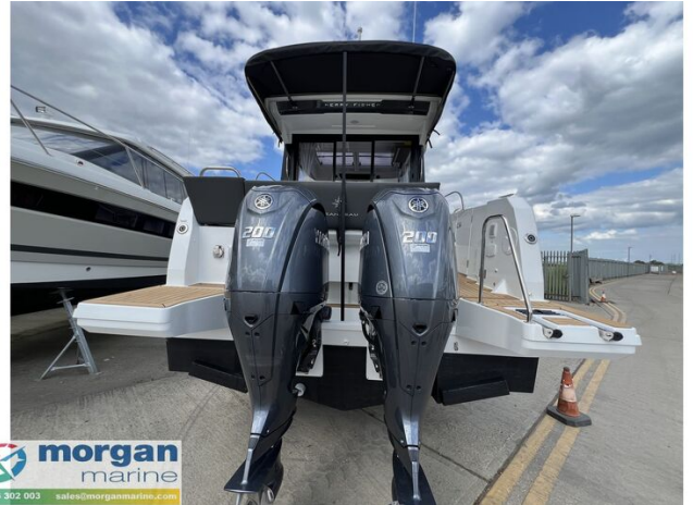
Jeanneau Merry Fisher 895 Series 2 - transom with twin Yamaha 200 outboards