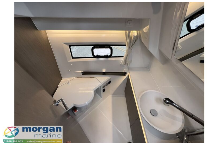
Jeanneau Merry Fisher 895 Series 2 - toilet and shower compartment