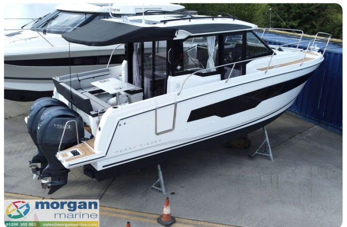
Jeanneau Merry Fisher 895 Series 2 - overhead view from starboard side aft