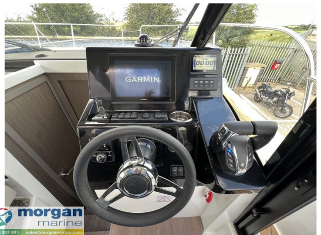
Jeanneau Merry Fisher 895 Series 2 - engine controls