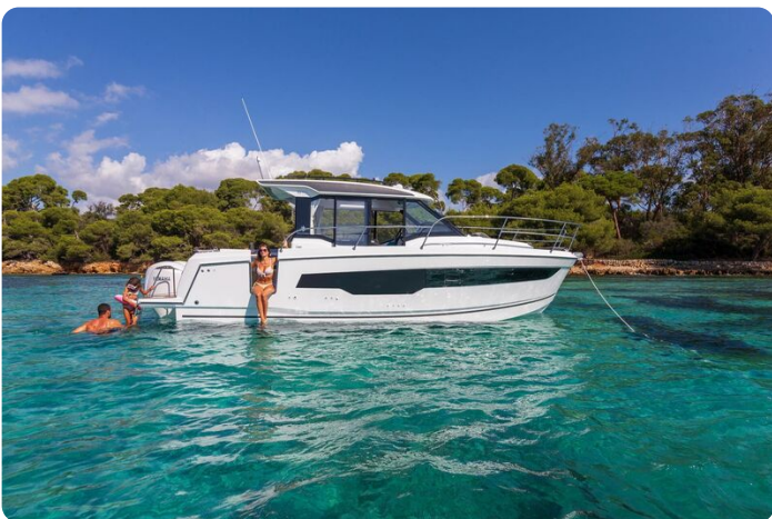
Jeanneau Merry Fisher 895 - easy access to the water from the wide boarding door