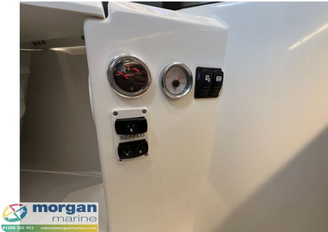
Jeanneau Merry Fisher 895 Series 2 - water system