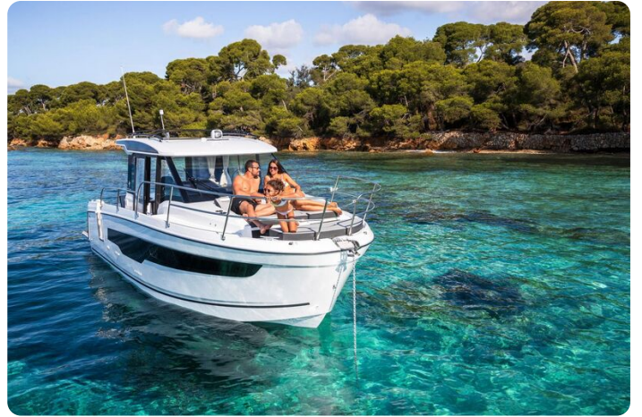
Jeanneau Merry Fisher 895 - relaxing on the forward sun lounger