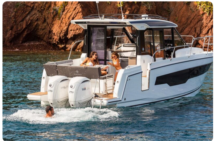
Jeanneau Merry Fisher 895 - transom with twin engines and swim platforms