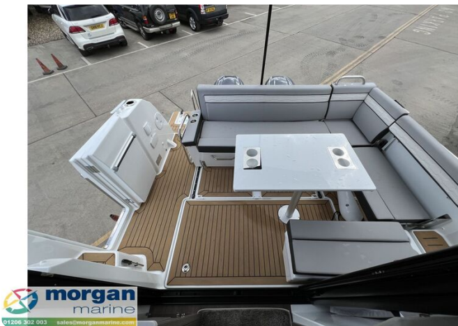
Jeanneau Merry Fisher 895 Series 2 - aft cockpit