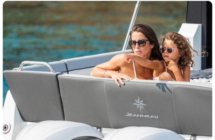
Jeanneau Merry Fisher 895 - people looking out over the aft cockpit bench seat