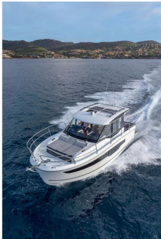
Jeanneau Merry Fisher 895 - on the water