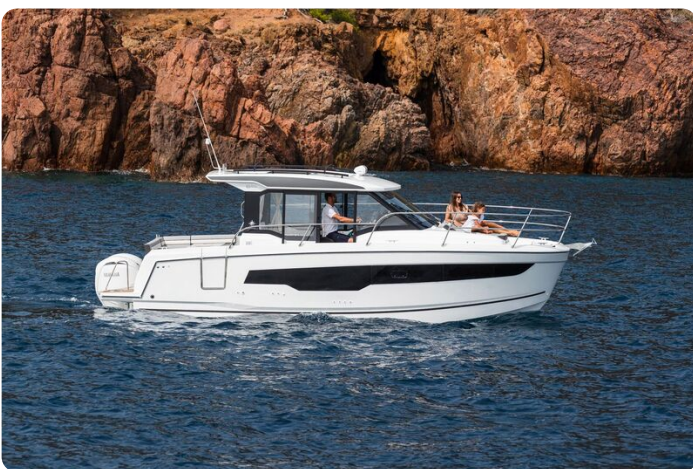
Jeanneau Merry Fisher 895 - on the water