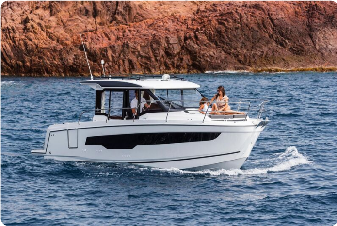
Jeanneau Merry Fisher 895 - relaxing on the water