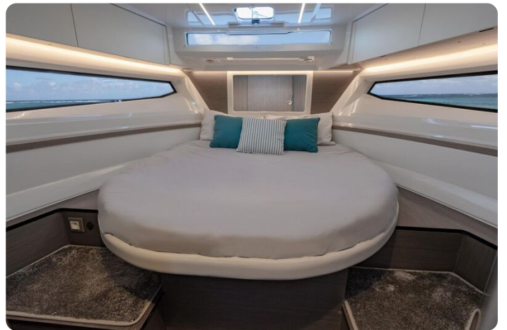
Jeanneau Merry Fisher 895 - forward cabin with double berth