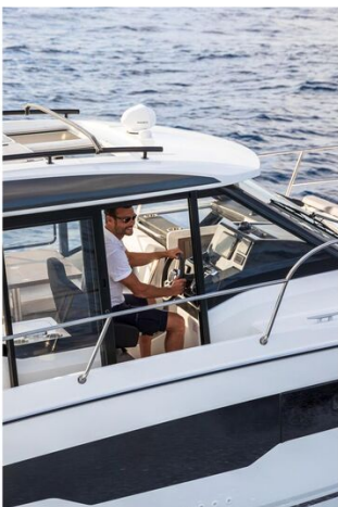
Jeanneau Merry Fisher 895 - helm side door for easy access to the side deck and cleats