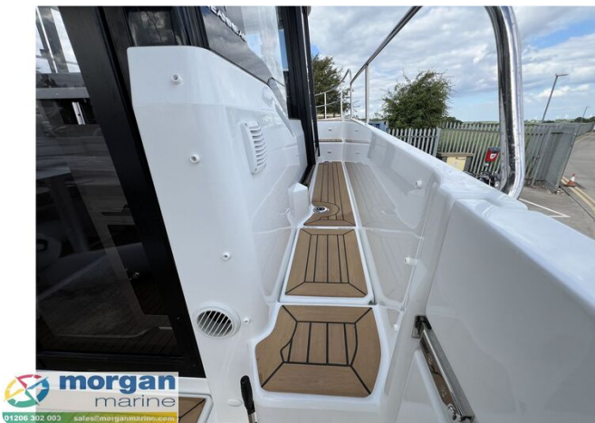
Jeanneau Merry Fisher 895 Series 2 - starboard side deck