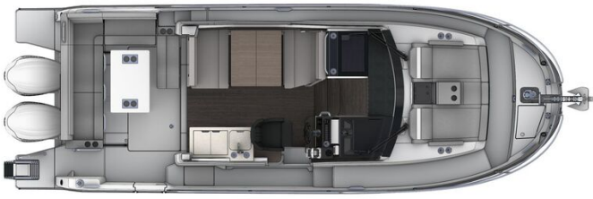
Jeanneau Merry Fisher 895 - diagram of cockpit seating, wheelhouse interior and bow sun lounger