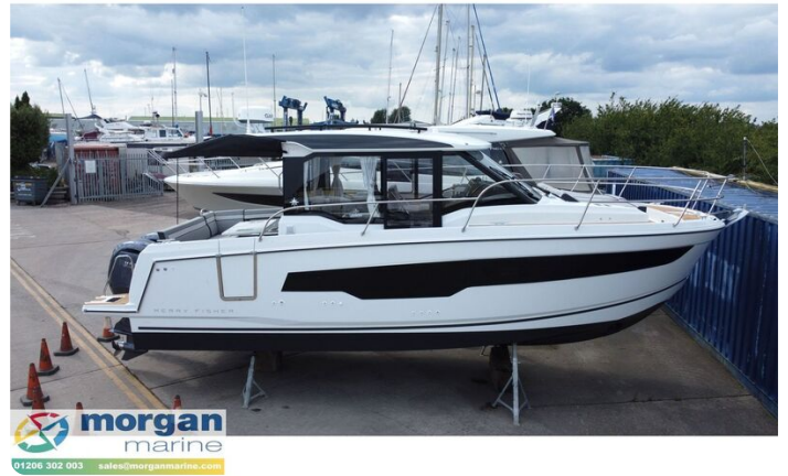
Jeanneau Merry Fisher 895 Series 2 - overhead view to starboard side