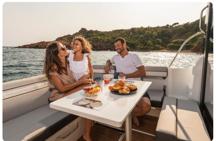
Jeanneau Merry Fisher 895 - dining at the cockpit table