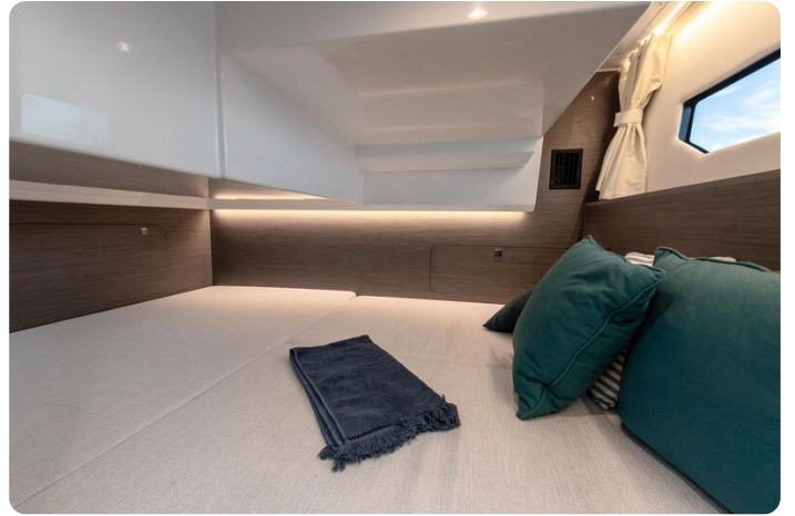
Jeanneau Merry Fisher 895 - double berth in aft cabin