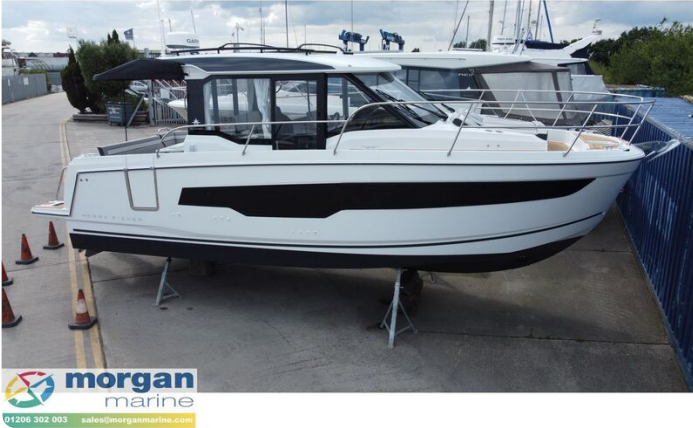
Jeanneau Merry Fisher 895 Series 2 - towards starboard side