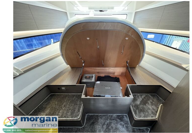
Jeanneau Merry Fisher 895 Series 2 - storage under berth