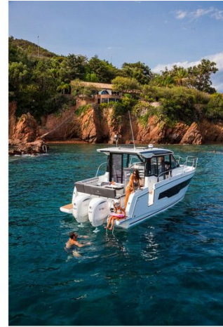
Jeanneau Merry Fisher 895 - swim platforms