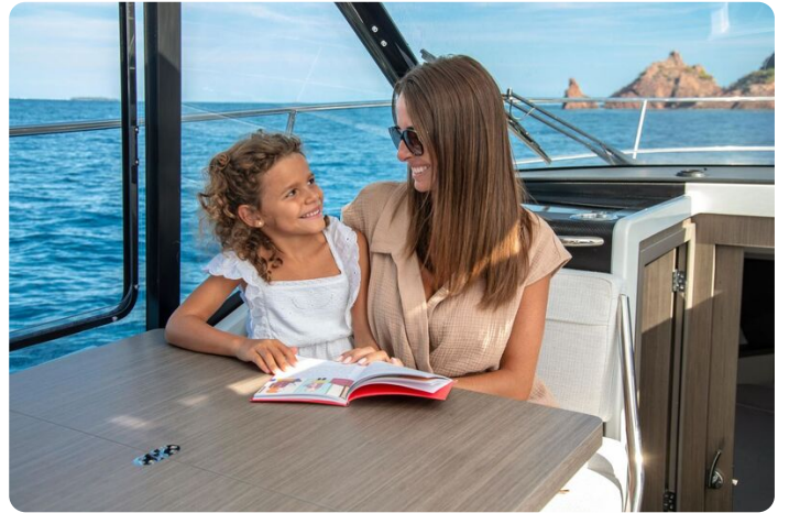
Jeanneau Merry Fisher 895 - sitting at the saloon table