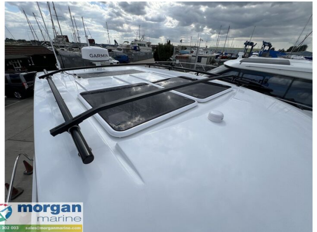
Jeanneau Merry Fisher 895 Series 2 - wheelhouse roof