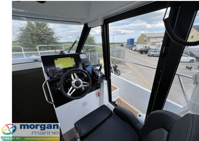
Jeanneau Merry Fisher 895 Series 2 - helm position and side door