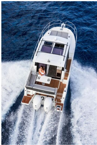
Jeanneau Merry Fisher 895 - overhead view