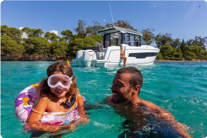
Jeanneau Merry Fisher 895 - fun in the water