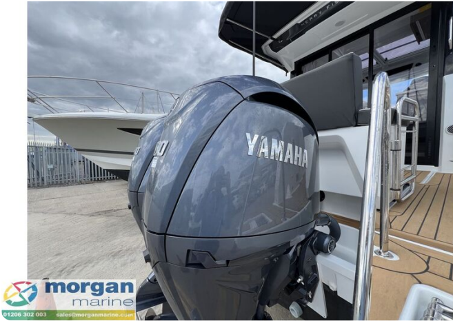
Jeanneau Merry Fisher 895 Series 2 - Yamaha outboard engines