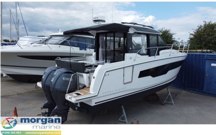
Jeanneau Merry Fisher 895 Series 2 - overhead view to starboard aft