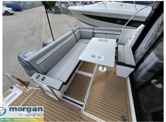
Jeanneau Merry Fisher 895 Series 2 - U shape cockpit seating and table