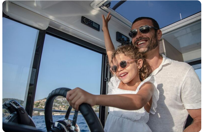
Jeanneau Merry Fisher 895 - sitting at helm position