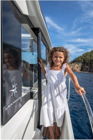
Jeanneau Merry Fisher 895 - deep and safe side decks