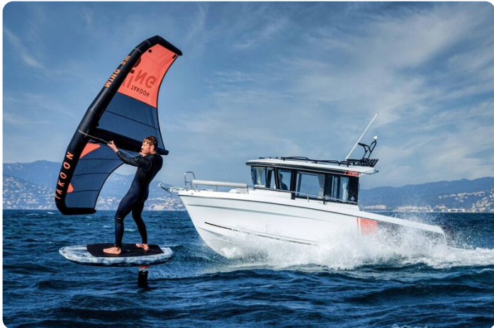
Jeanneau Merry Fisher 795 Sport - Series 2 - great for paddleboards and fun on the water