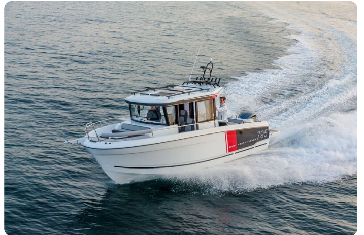
Jeanneau Merry Fisher 795 Sport - Series 2 - on the water