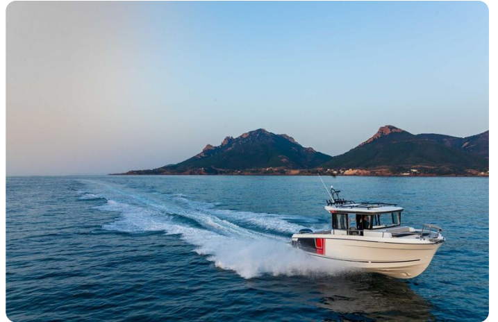
Jeanneau Merry Fisher 795 Sport - Series 2 - moving through the water