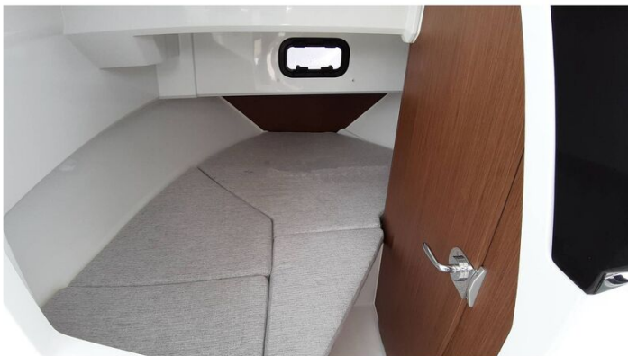
Jeanneau Merry Fisher 795 Sport - Series 2 - forward cuddy with cushions