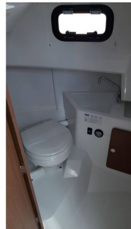
Jeanneau Merry Fisher 795 Sport - Series 2 - toilet compartment