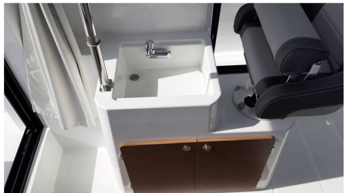
Jeanneau Merry Fisher 795 Sport - Series 2 - galley behind helm seat