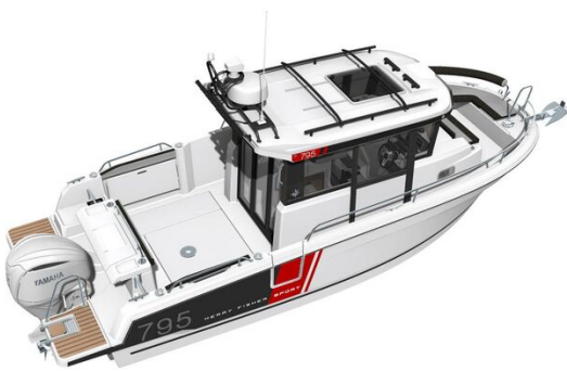
Jeanneau Merry Fisher 795 Sport - Series 2 - render of overhead view