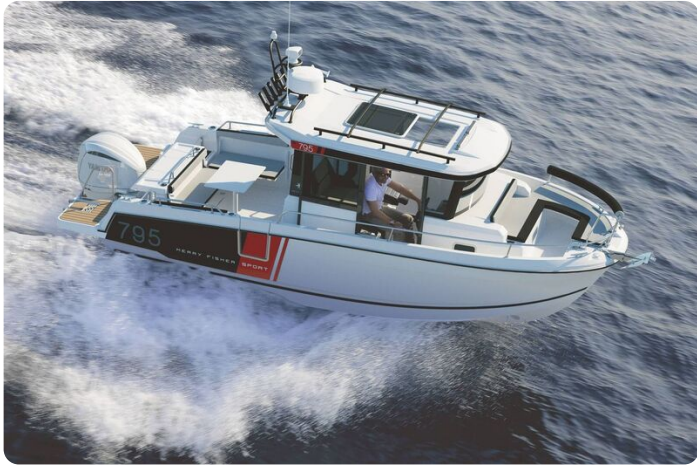
Jeanneau Merry Fisher 795 Sport - Series 2