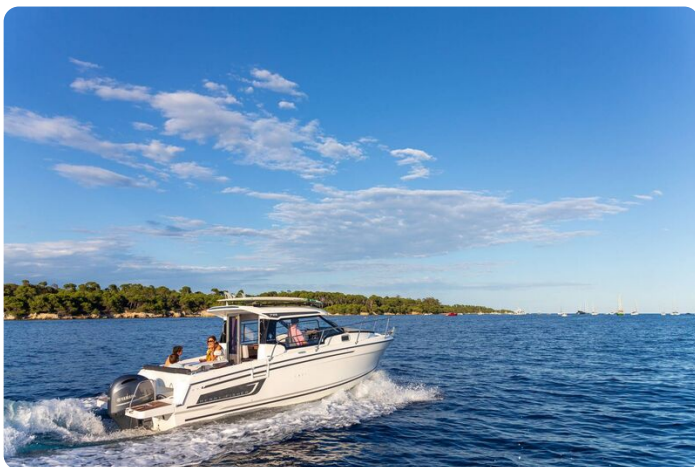
Jeanneau Merry Fisher 795 - on the water