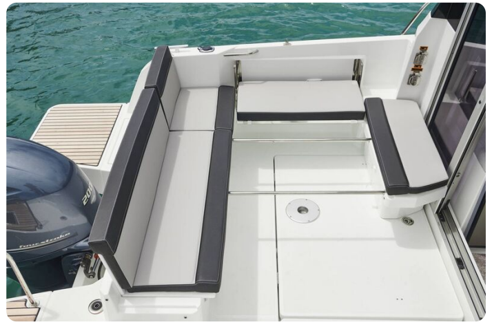
Jeanneau Merry Fisher 795 - U-shape cockpit seating