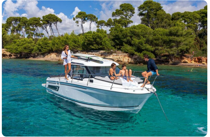
Jeanneau Merry Fisher 795 - side deck for easy access to bow