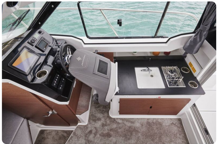
Jeanneau Merry Fisher 795 - helm seat folds forward for access to galley