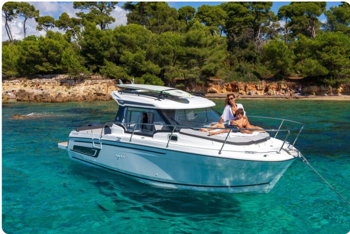
Jeanneau Merry Fisher 795 - relaxing on the bow cushions