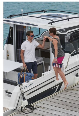
Jeanneau Merry Fisher 795 - cockpit side gate for easy access to pontoons