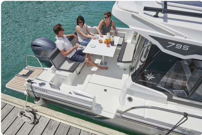
Jeanneau Merry Fisher 795 - sitting around cockpit table