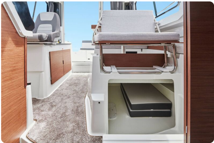
Jeanneau Merry Fisher 795 - storage under seating