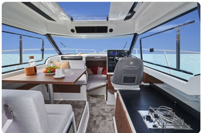
Jeanneau Merry Fisher 795 - wheelhouse with roof hatch, port side saloon and starboard side galley