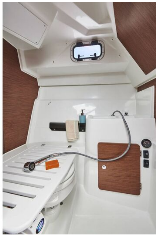
Jeanneau Merry Fisher 795 - toilet and shower compartment