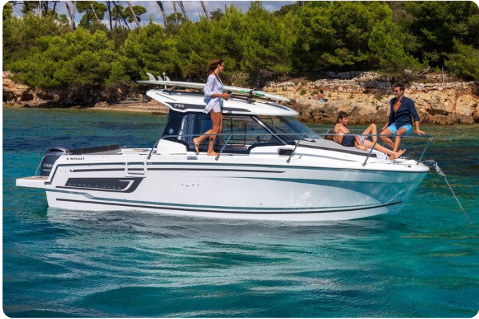
Jeanneau Merry Fisher 795