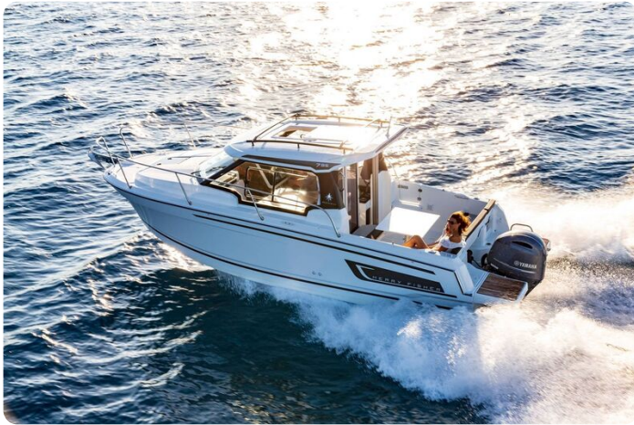
Jeanneau Merry Fisher 795 - on beautiful water