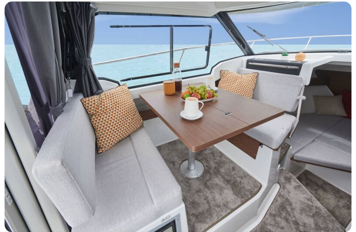
Jeanneau Merry Fisher 795 - wheelhouse saloon with table and seating