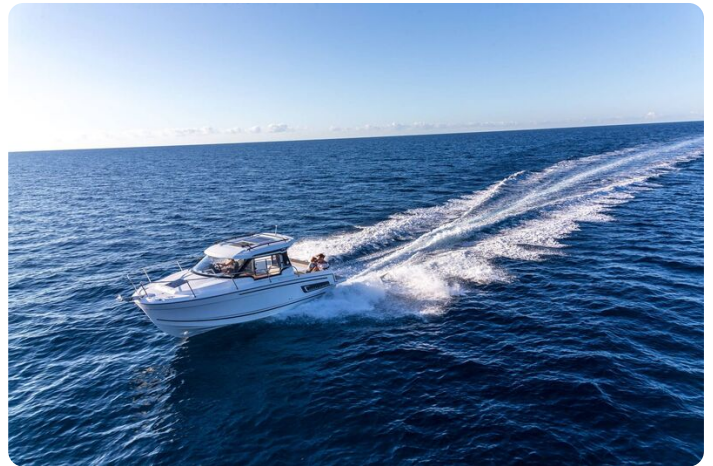
Jeanneau Merry Fisher 795 - on the water with long wake