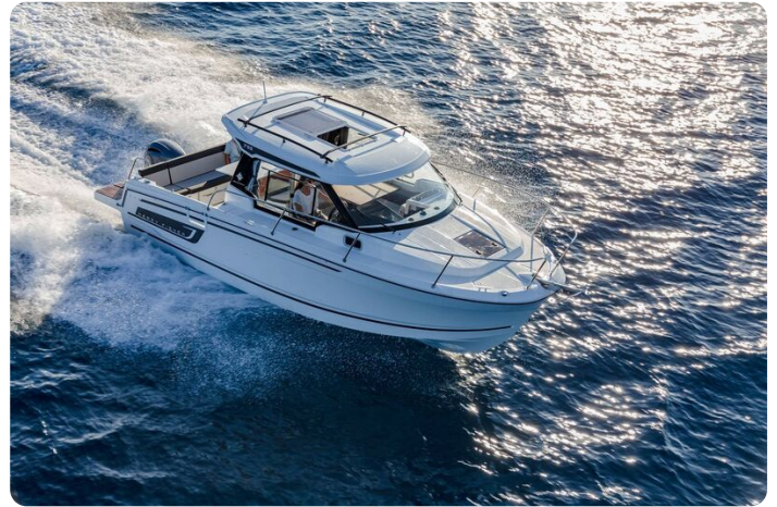
Jeanneau Merry Fisher 795 - overhead view towards bow