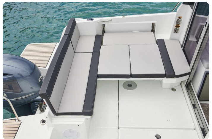
Jeanneau Merry Fisher 795 - cockpit saloon converts to sun lounger