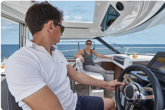
Jeanneau Merry Fisher 795 - pilot and co-pilot seating