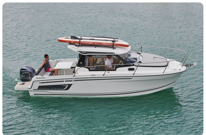
Jeanneau Merry Fisher 795 Series 2 - overhead view from starboard side with storage rack on roof