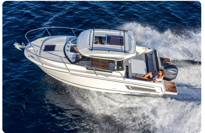
Jeanneau Merry Fisher 795 Series 2 - overhead view from port side