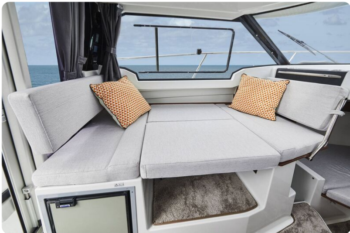
Jeanneau Merry Fisher 795 Series 2 - table in wheelhouse converts to berth