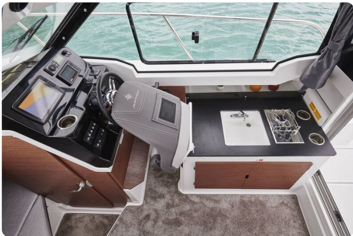
Jeanneau Merry Fisher 795 Series 2 - helm seat folds forward for easier access to galley