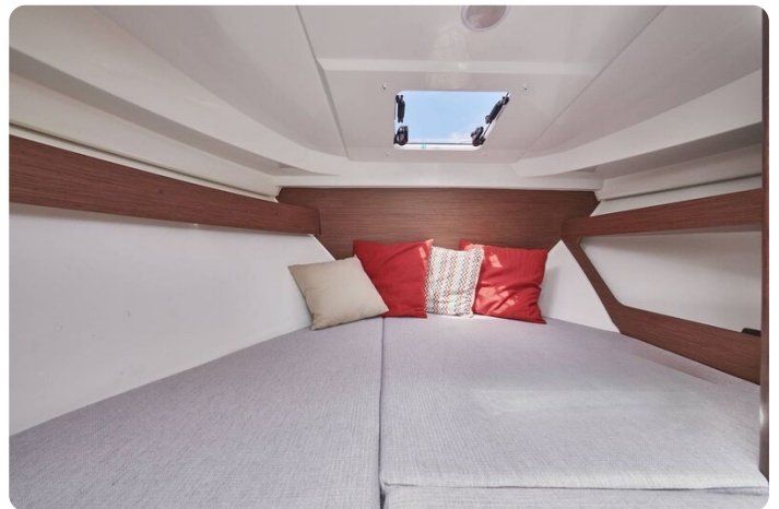
Jeanneau Merry Fisher 795 Series 2 - cabin with double berth and hatch to deck