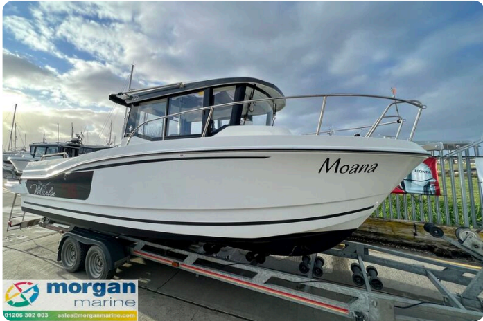
Jeanneau Merry Fisher 795 Marlin - starboard side