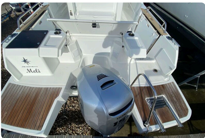
Jeanneau Merry Fisher 795 Marlin-engine