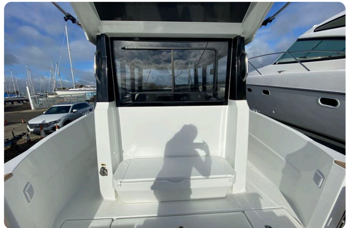
Jeanneau Merry Fisher 795 Marlin-window