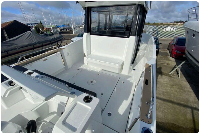
Jeanneau Merry Fisher 795 Marlin-back-deck