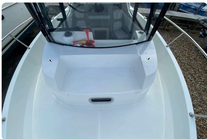
Jeanneau Merry Fisher 795 Marlin-front-seating