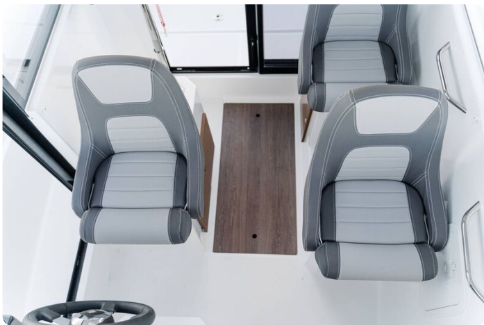
Jeanneau Merry Fisher 695 Sport - render of wheelhouse seating