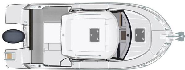
Jeanneau Merry Fisher 605 - diagram of overhead view