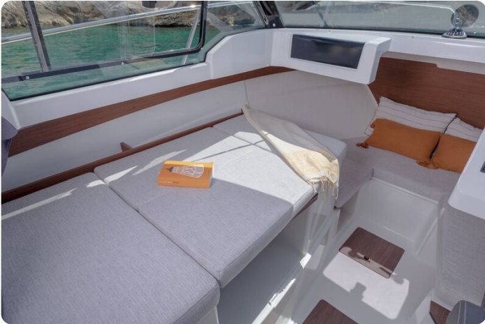
Jeanneau Merry Fisher 605 - saloon table converts to berth