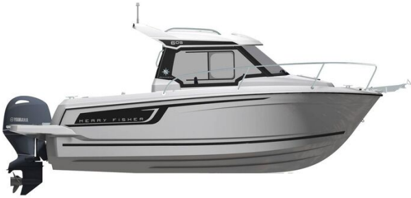
Jeanneau Merry Fisher 605 - diagram of side view