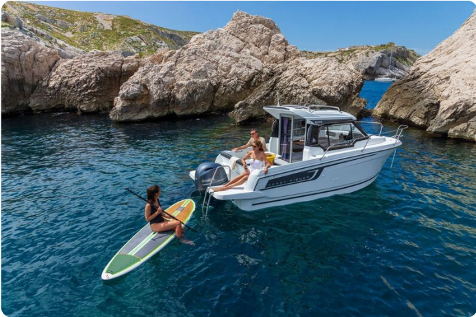
Jeanneau Merry Fisher 605 - great for fun on the water