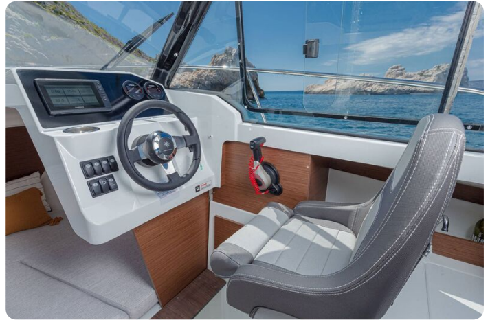
Jeanneau Merry Fisher 605 - helm position with dash and starboard side window