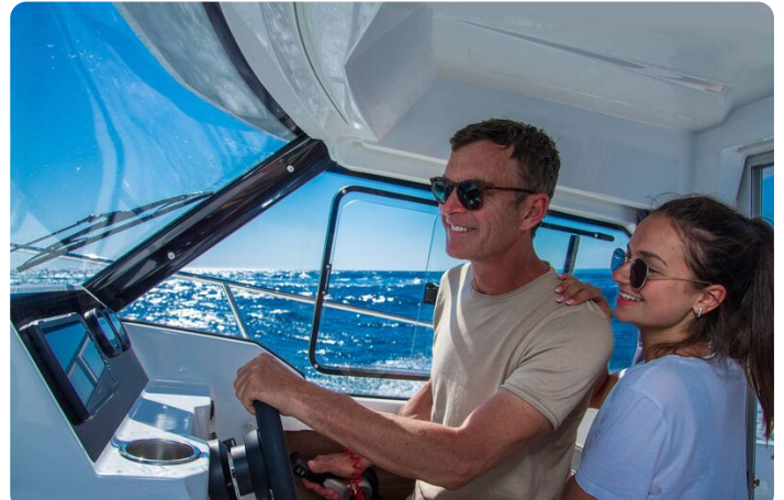
Jeanneau Merry Fisher 605 - helm seat