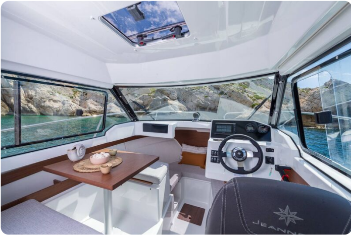
Jeanneau Merry Fisher 605 - wheelhouse view towards helm seat