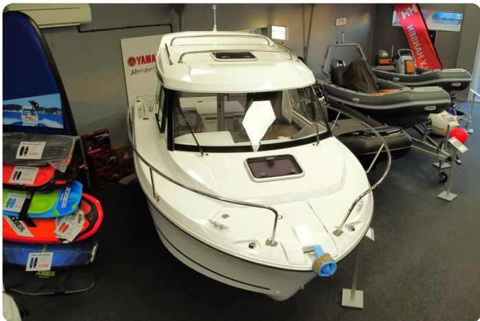
Jeanneau Merry Fisher 605 - bow