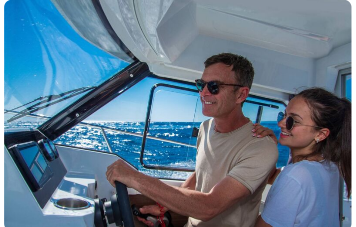
Jeanneau Merry Fisher 605 - helm seat