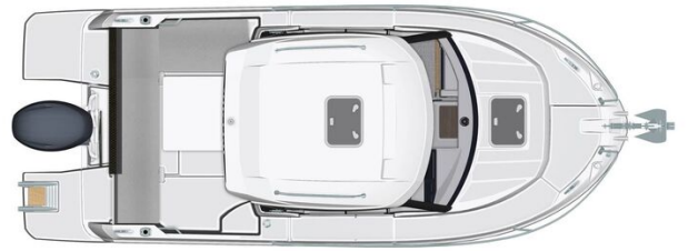
Jeanneau Merry Fisher 605 - diagram of overhead view