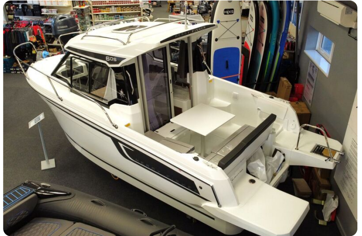
Jeanneau Merry Fisher 605 - aft cockpit saloon and table