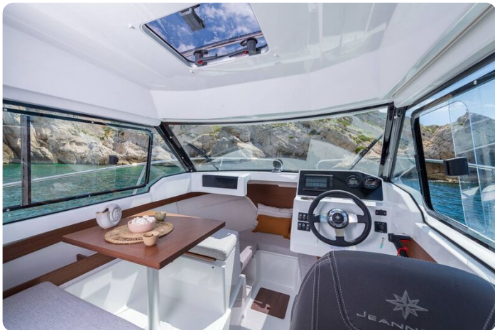
Jeanneau Merry Fisher 605 - wheelhouse view towards helm seat