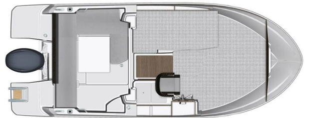
Jeanneau Merry Fisher 605 - diagram of cabin layout