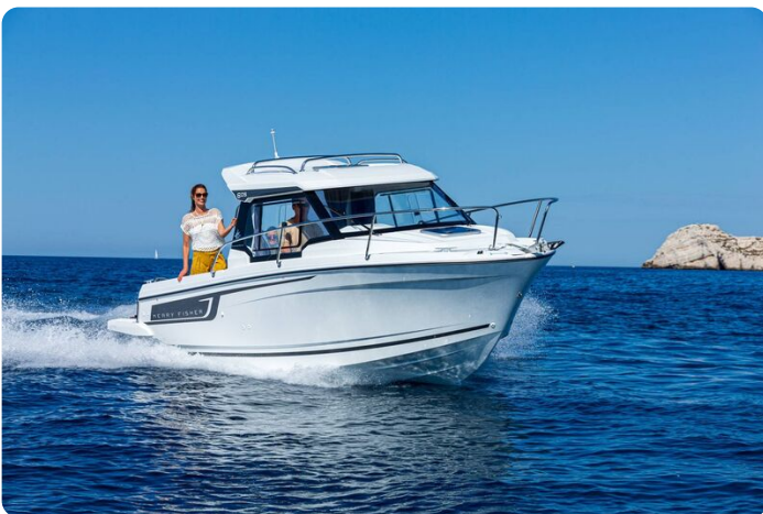
Jeanneau Merry Fisher 605 - on the water