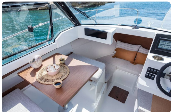
Jeanneau Merry Fisher 605 - wheelhouse with port side saloon