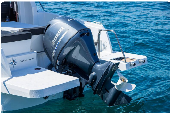
Jeanneau Merry Fisher 605 - swim transom and swim platforms