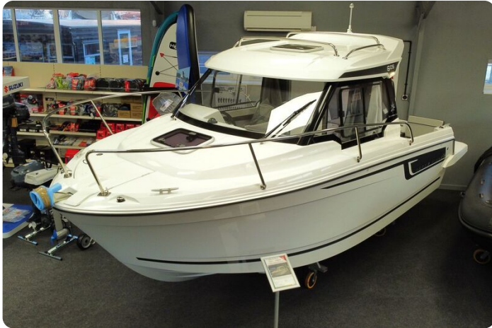
Jeanneau Merry Fisher 605