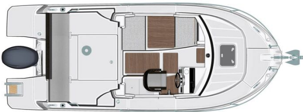
Jeanneau Merry Fisher 605 - diagram of wheelhouse layout