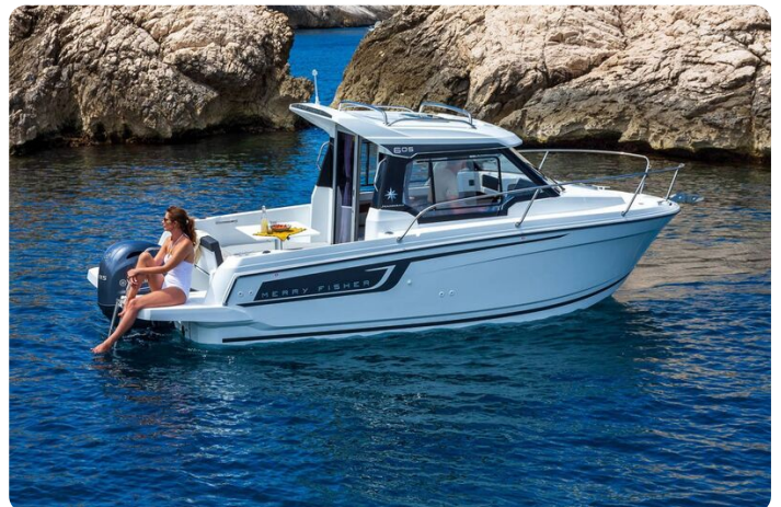
Jeanneau Merry Fisher 605 - on the water