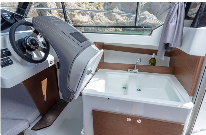
Jeanneau Merry Fisher 605 - helm seat folds forwards for access to galley