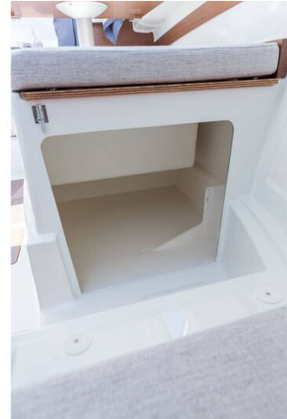
Jeanneau Merry Fisher 605 - storage under seating