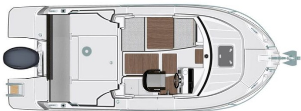
Jeanneau Merry Fisher 605 - diagram of wheelhouse layout