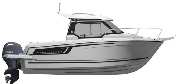
Jeanneau Merry Fisher 605 - diagram of side view