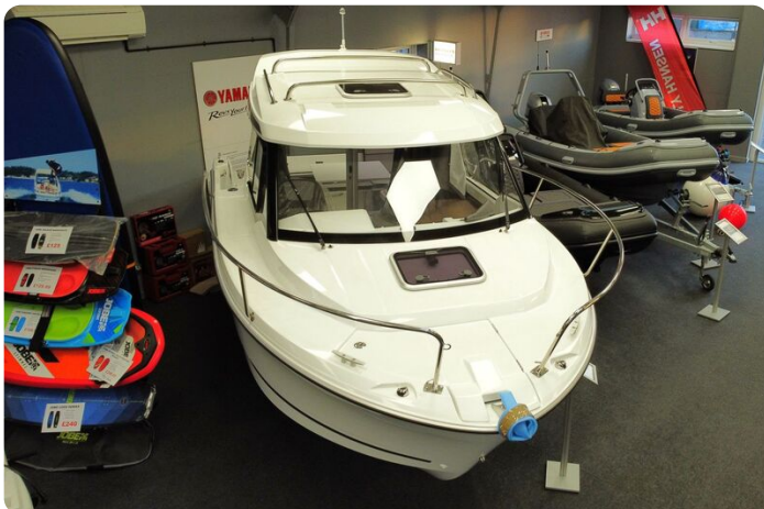
Jeanneau Merry Fisher 605 - bow