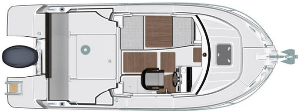
Jeanneau Merry Fisher 605 - diagram of wheelhouse layout