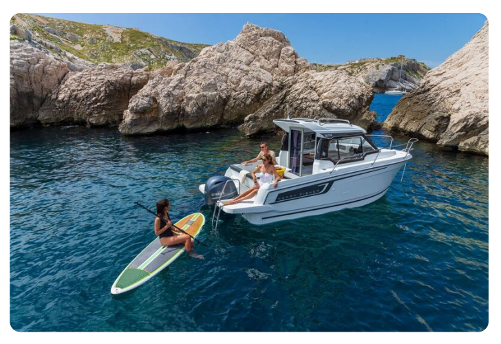
Jeanneau Merry Fisher 605 - fun on the water with a paddleboard