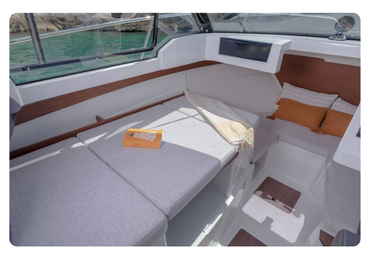
Jeanneau Merry Fisher 605 - saloon table converts to berth