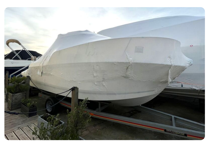
Jeanneau Merry Fisher 605 - still wrapped up