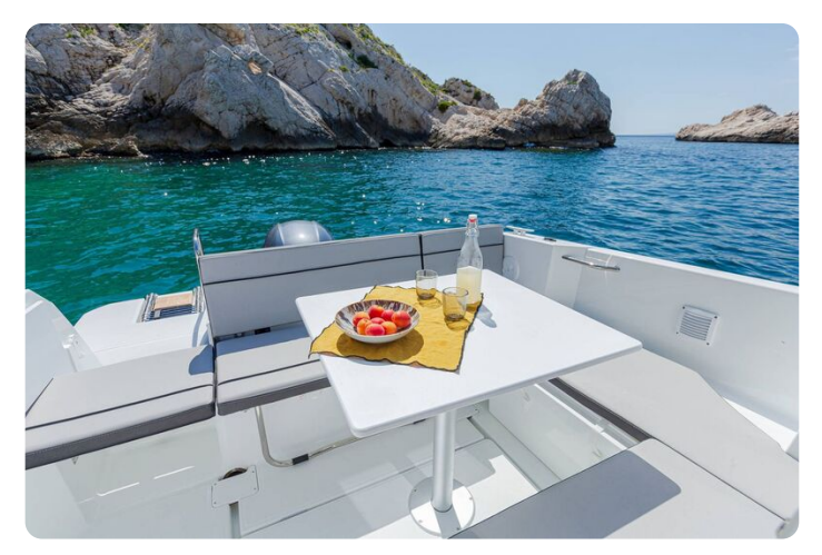
Jeanneau Merry Fisher 605 - view towards aft