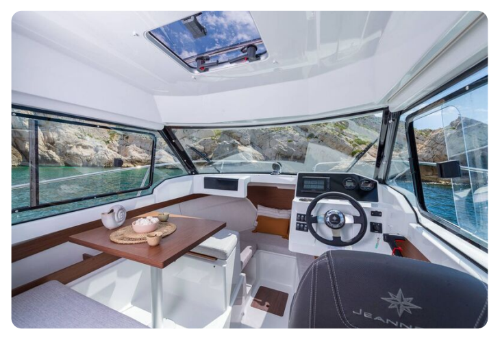
Jeanneau Merry Fisher 605 - wheelhouse with helm position, saloon and roof hatch