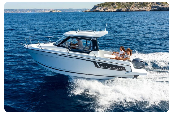
Jeanneau Merry Fisher 605 - port side view on the water