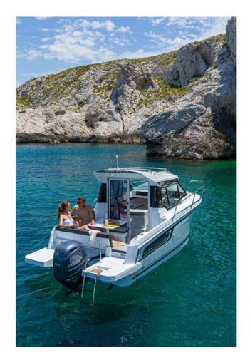
Jeanneau Merry Fisher 605 - in beautiful surroundings