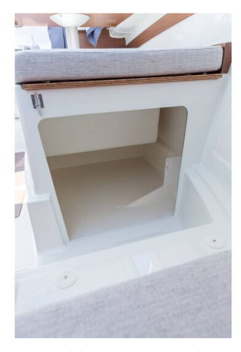
Jeanneau Merry Fisher 605 - storage under co-pilot seat