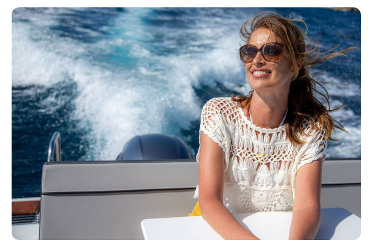
Jeanneau Merry Fisher 605 - view of wake from outboard