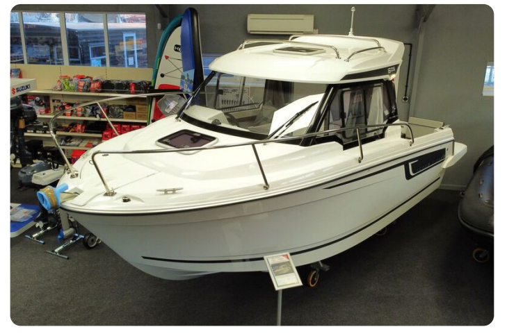
Jeanneau Merry Fisher 605 - in stock at Morgan Marine - view towards bow