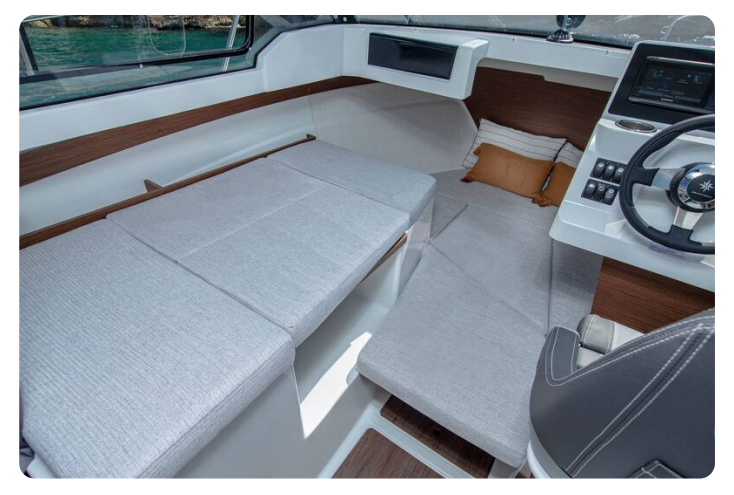
Jeanneau Merry Fisher 605 - all cushions in wheelhouse for two double berths