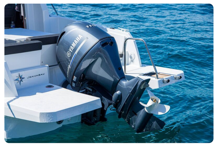
Jeanneau Merry Fisher 605 - transom with swim platforms and outboard engine