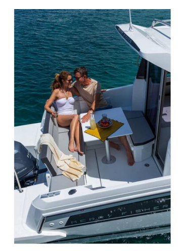
Jeanneau Merry Fisher 605 - relaxing in the U-shaped cockpit saloon