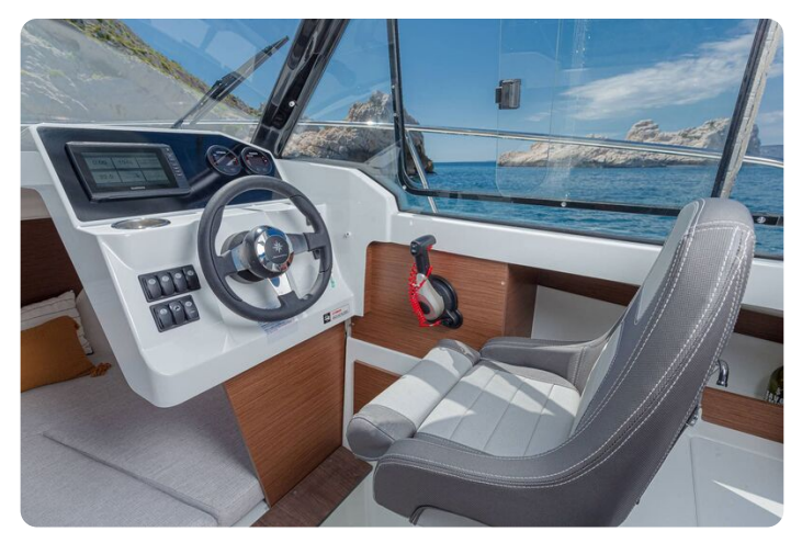
Jeanneau Merry Fisher 605 - helm position