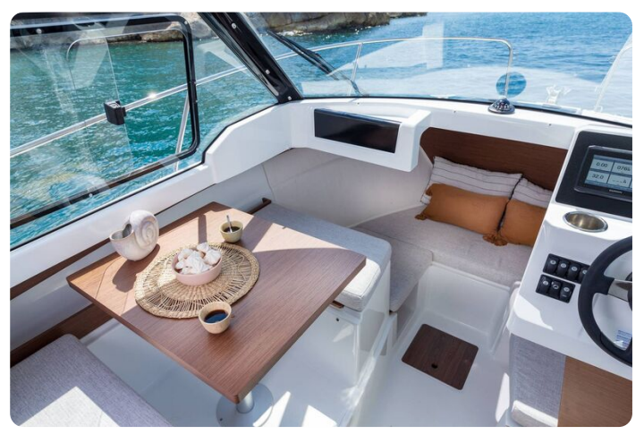
Jeanneau Merry Fisher 605 - port side saloon table and forward berth