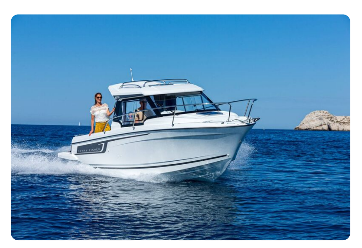
Jeanneau Merry Fisher 605 - on the water