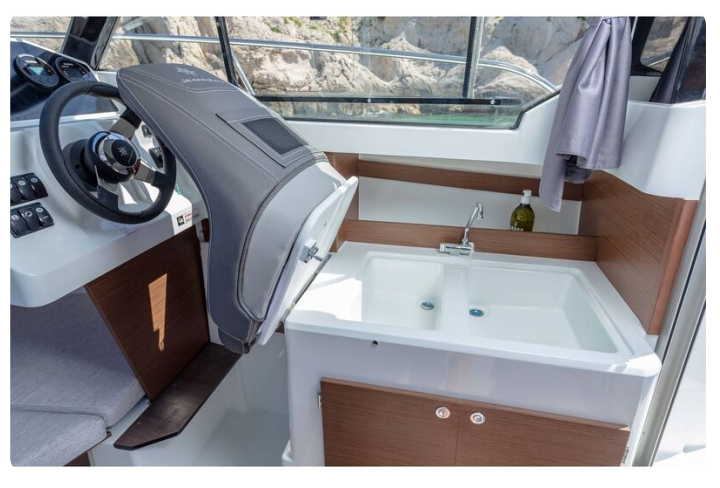
Jeanneau Merry Fisher 605 - helm seat folds forward for access to galley