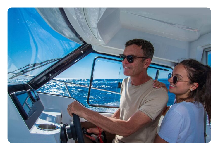
Jeanneau Merry Fisher 605 - starboard side window at helm

Jeanneau Merry Fisher 605 - diagram of side view