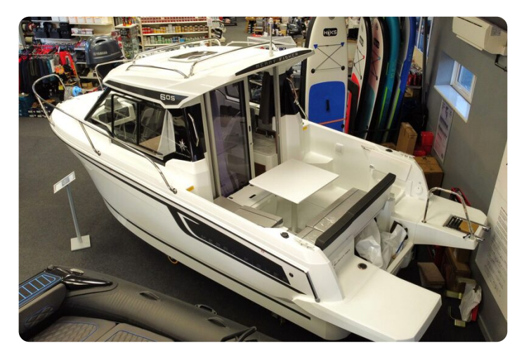
Jeanneau Merry Fisher 605 - in stock at Morgan Marine - view towards cockpit