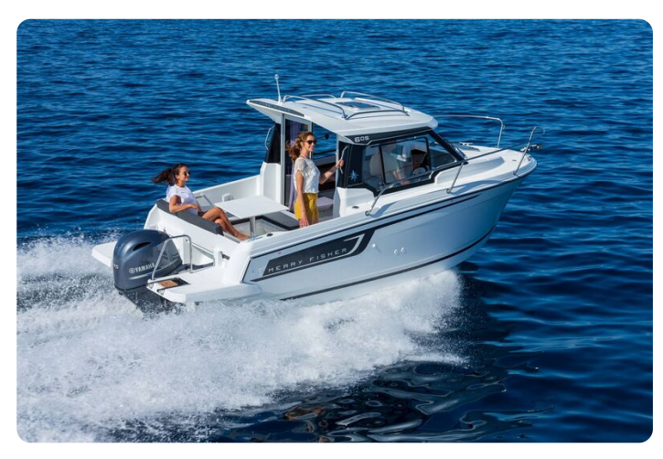
Jeanneau Merry Fisher 605 - relaxing on the water