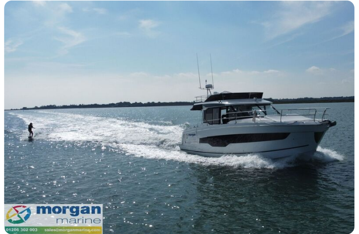
Jeanneau Merry Fisher 1295 Flybridge - wakeboarding - starboard side view