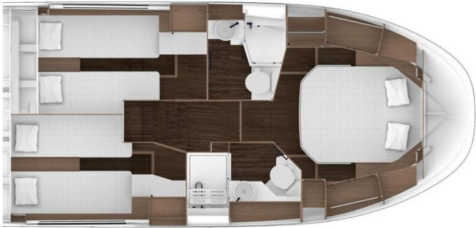
Jeanneau Merry Fisher 1295 Flybridge - diagram of cabins layout