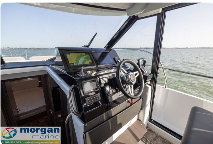
Jeanneau Merry Fisher 1295 Flybridge - helm position with side door