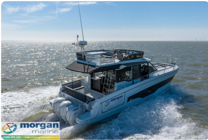
Jeanneau Merry Fisher 1295 Flybridge - overhead view from starboard side aft