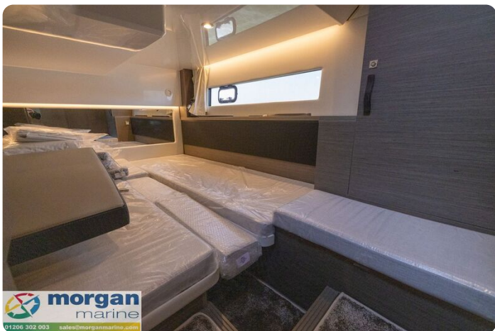
Jeanneau Merry Fisher 1295 Flybridge - 3rd cabin with two single berths