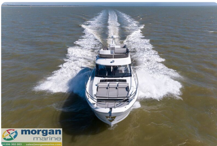
Jeanneau Merry Fisher 1295 Fly - overhead view coming towards camera