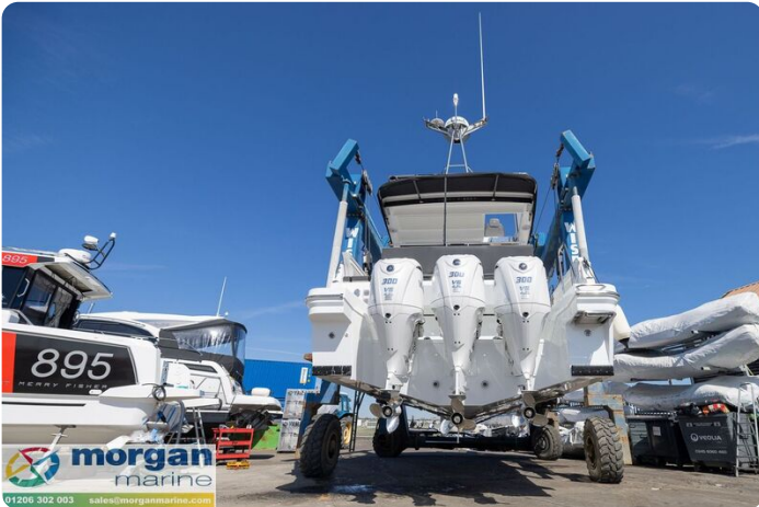
Jeanneau Merry Fisher 1295 Fly - triple Yamaha engines