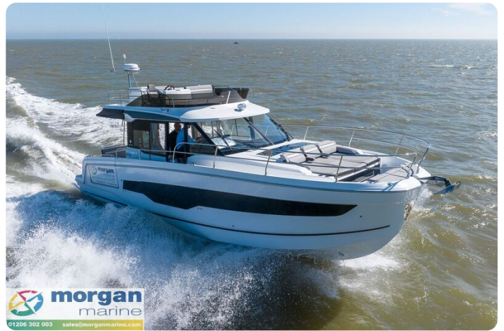
Jeanneau Merry Fisher 1295 Flybridge - overhead view from starboard side