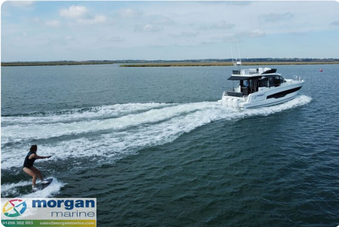
Jeanneau Merry Fisher 1295 Fly - wakeboarding - view towards aft