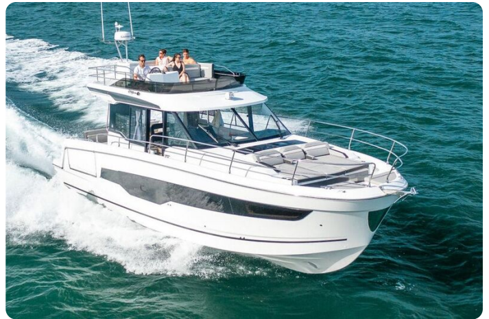
Jeanneau Merry Fisher 1295 Flybridge