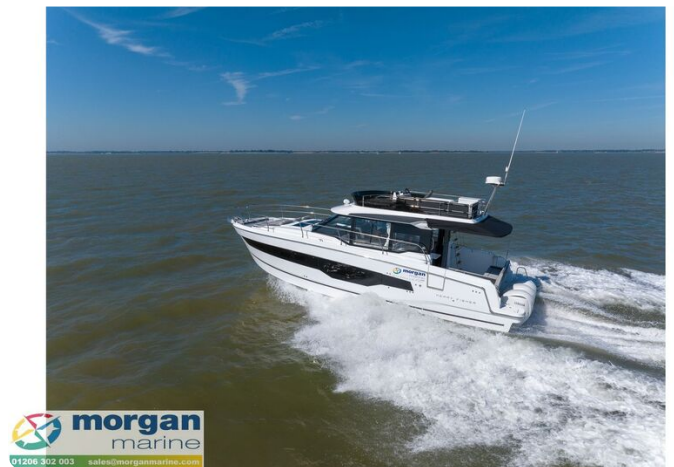
Jeanneau Merry Fisher 1295 Flybridge - port side on the water