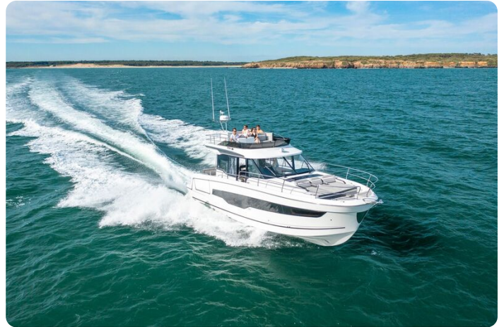
Jeanneau Merry Fisher 1295 Flybridge - on the water