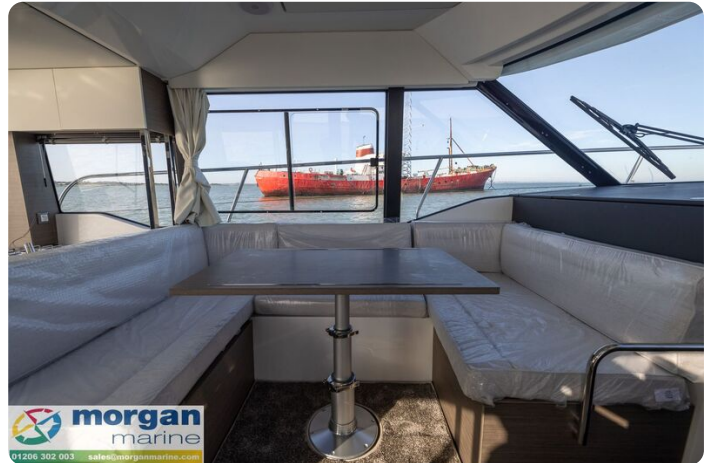
Jeanneau Merry Fisher 1295 Flybridge - saloon seating and table