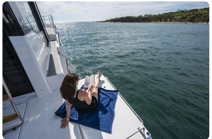
Jeanneau Merry Fisher 1295 Flybridge - folding terrace