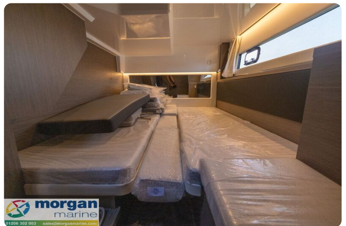
Jeanneau Merry Fisher 1295 Flybridge - 3rd cabin with two single berths and infill