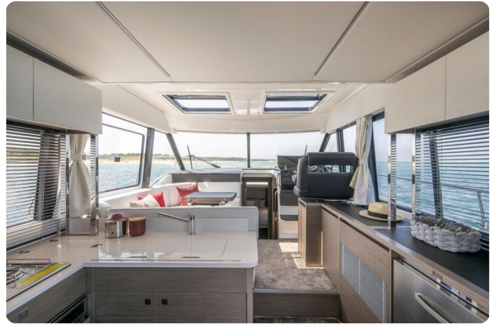
Jeanneau Merry Fisher 1295 Coupe - starboard side and aft galley