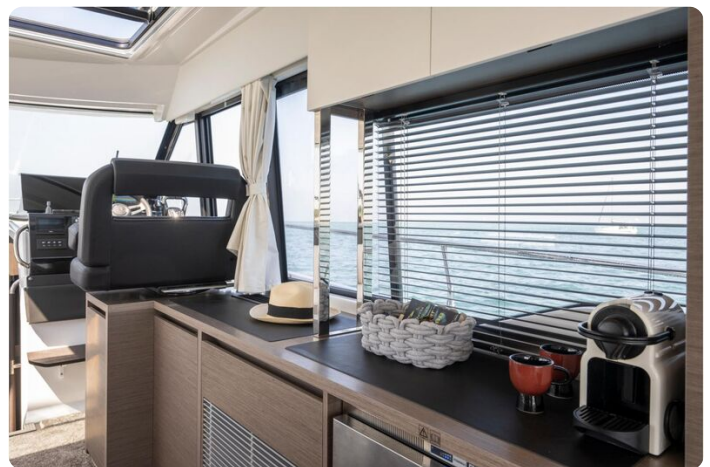
Jeanneau Merry Fisher 1295 Coupe - starboard side galley