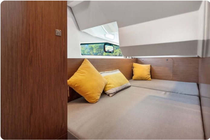
Jeanneau Merry Fisher 1095 Fly - 3rd cabin