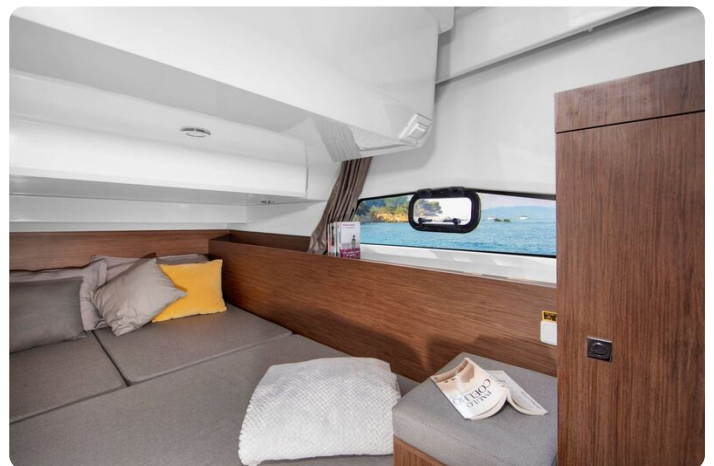
Jeanneau Merry Fisher 1095 Fly - 2nd cabin