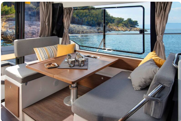
Jeanneau Merry Fisher 1095 Fly - wheelhouse saloon