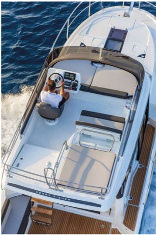
Jeanneau Merry Fisher 1095 Fly - overhead view of flybridge