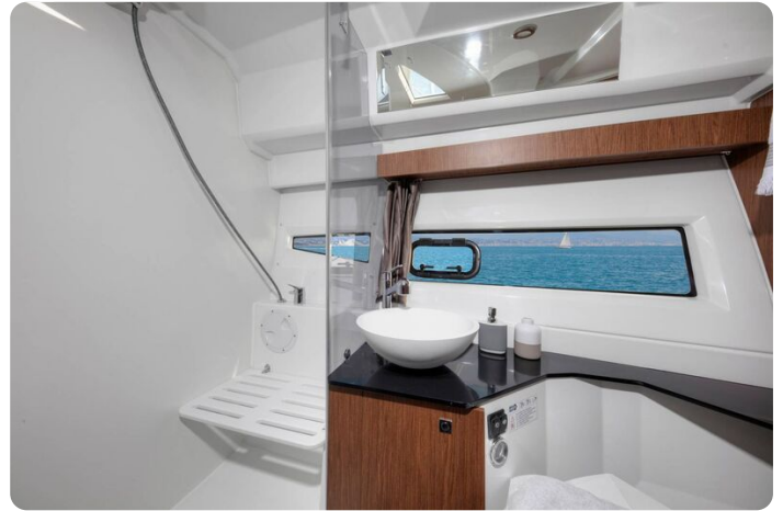
Jeanneau Merry Fisher 1095 Fly - toilet and shower compartment