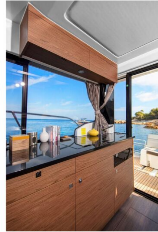
Jeanneau Merry Fisher 1095 Fly - wheelhouse galley