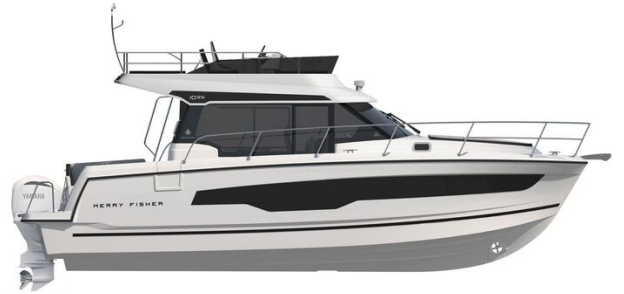
Jeanneau Merry Fisher 1095 Fly - diagram of side view