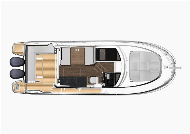
Jeanneau Merry Fisher 1095 Fly - diagram of top view and wheelhouse interior