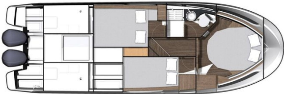
Jeanneau Merry Fisher 1095 Flybridge - diagram of cabins layout