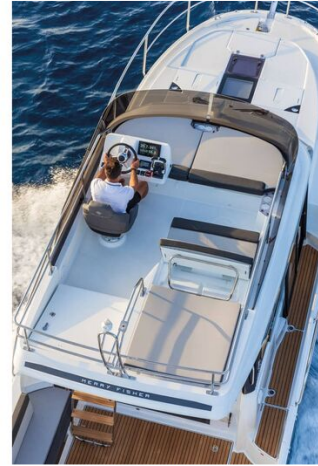
Jeanneau Merry Fisher 1095 Flybridge - overhead view of flybridge