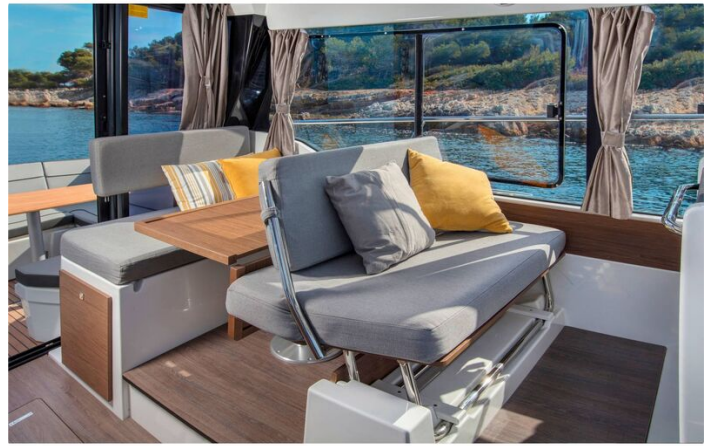
Jeanneau Merry Fisher 1095 Flybridge - co-pilot seat converts to seating at saloon table