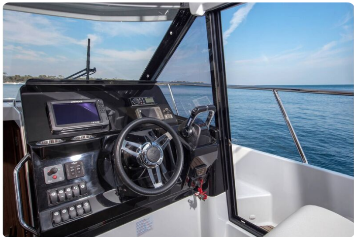
Jeanneau Merry Fisher 1095 Flybridge - helm position