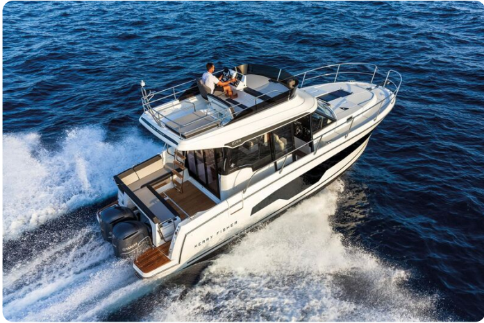
Jeanneau Merry Fisher 1095 Flybridge