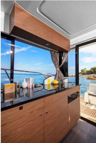
Jeanneau Merry Fisher 1095 Flybridge - wheelhouse galley