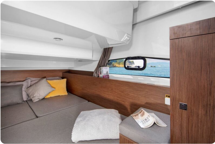
Jeanneau Merry Fisher 1095 Flybridge - 2nd cabin