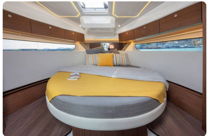
Jeanneau Merry Fisher 1095 Flybridge - main cabin