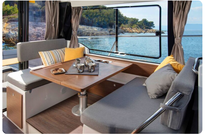
Jeanneau Merry Fisher 1095 Flybridge - saloon table