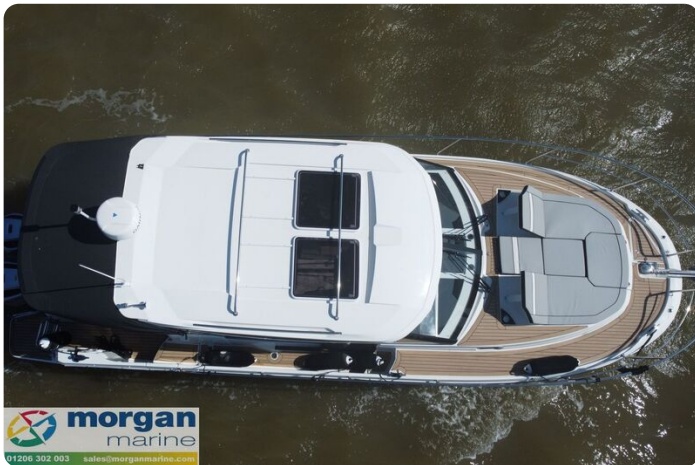
Merry Fisher 1095 - roof bars