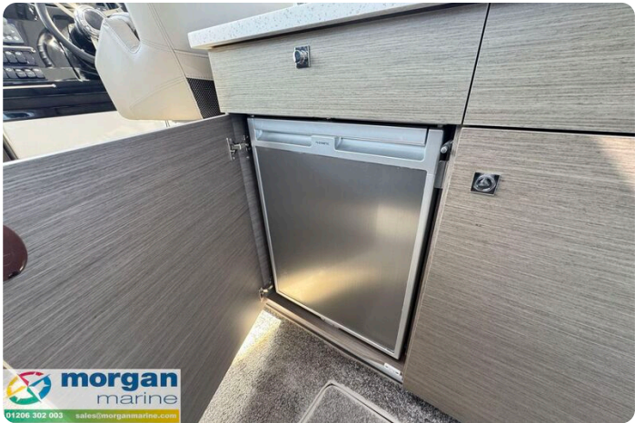
Merry Fisher 1095 - fridge