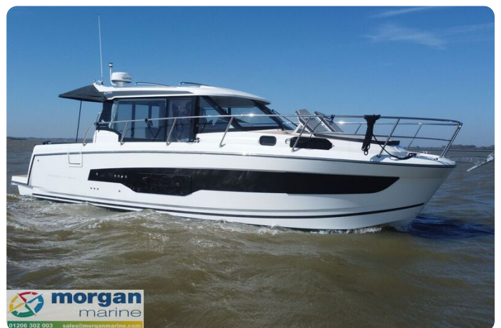
Merry Fisher 1095 - bow view