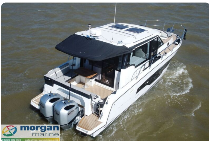
Merry Fisher 1095 - canopy