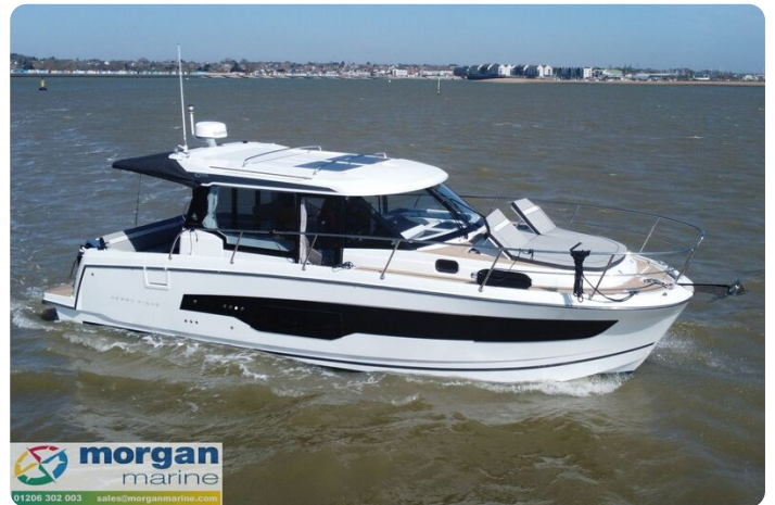
Merry Fisher 1095 - calm