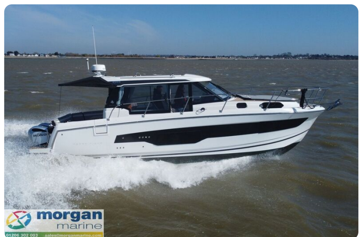
Merry Fisher 1095 - action