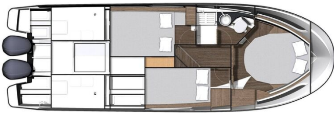
Jeanneau Merry Fisher 1095 - diagram of cabin layout