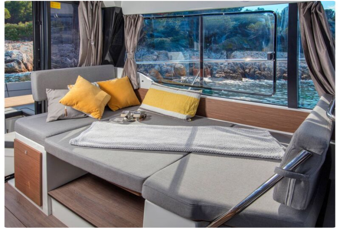
Jeanneau Merry Fisher 1095 - table in wheelhouse converts to berth