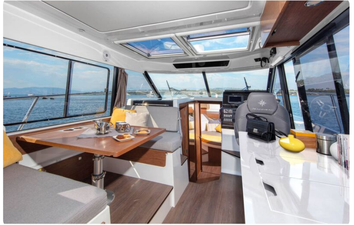
Jeanneau Merry Fisher 1095 - wheelhouse with port side seating and starboard side helm position and galley