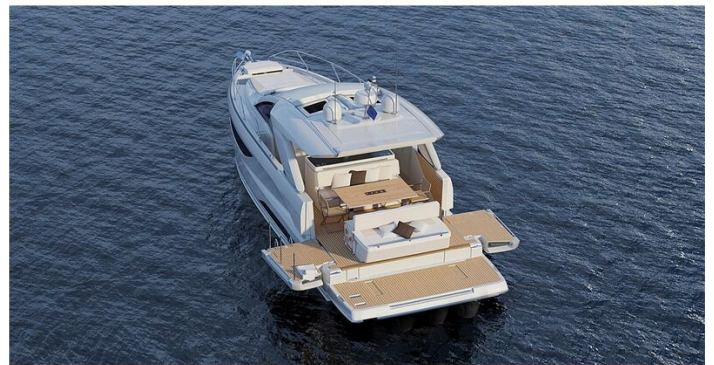
Jeanneau DB 43 inboard - overhead view of terraces