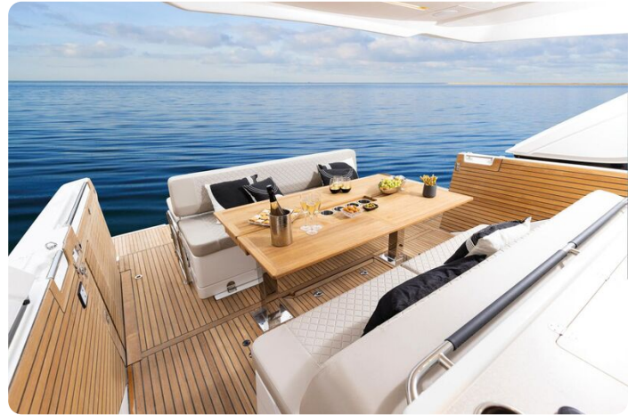
Jeanneau DB 43 inboard - aft cockpit table