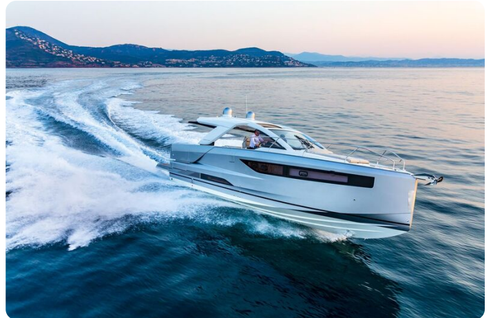
Jeanneau DB 43 inboard - on the water