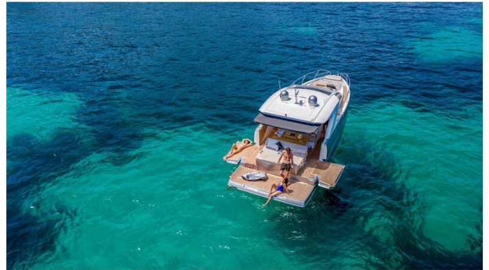
Jeanneau DB 43 inboard - view from high above