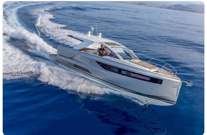
Jeanneau DB 43 inboard - speeding through the water