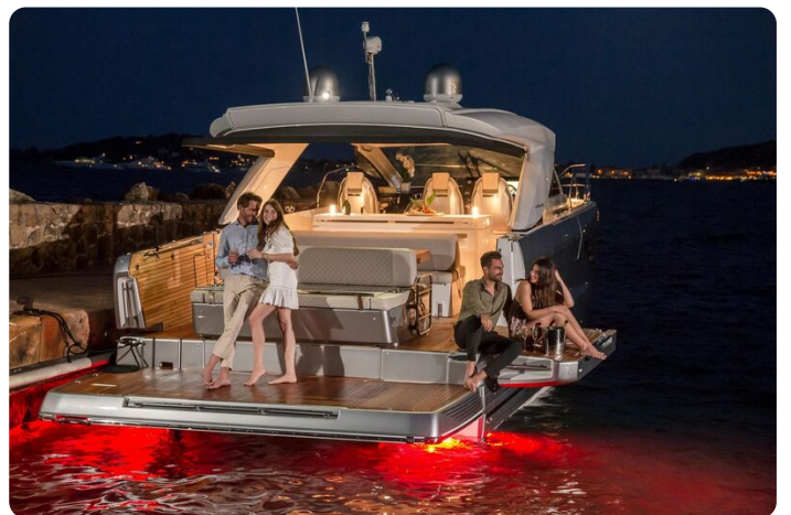
Jeanneau DB 43 inboard - socialising at night on the terraces with under water lights