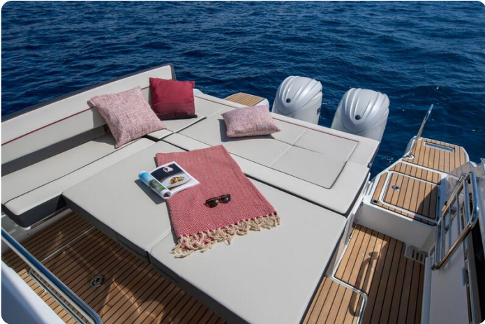
Jeanneau Cap Camarat 9.0 WA - aft cockpit bench folds down to extend sun lounger