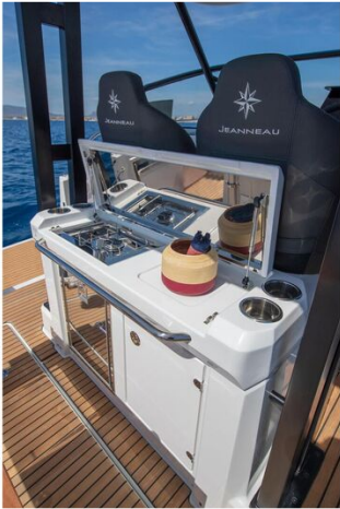
Jeanneau Cap Camarat 9.0 WA - exterior galley