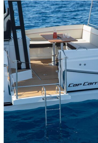
Jeanneau Cap Camarat 9.0 WA - port side terrace with boarding ladder