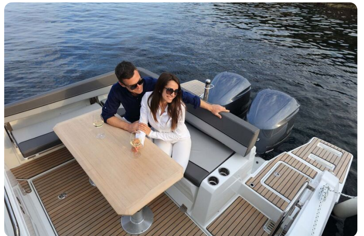
Jeanneau Cap Camarat 9.0 CC - aft cockpit bench seat and table