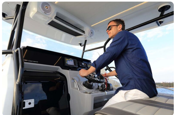
Jeanneau Cap Camarat 9.0 CC - helm position and plexi door to cabin