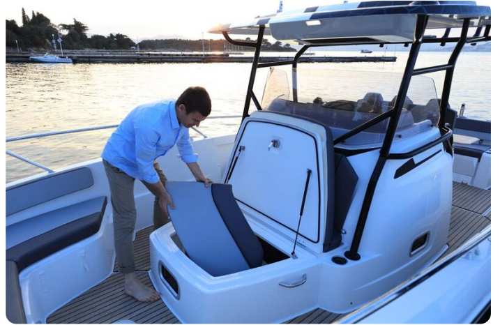
Jeanneau Cap Camarat 9.0 CC - access to cabin from bow