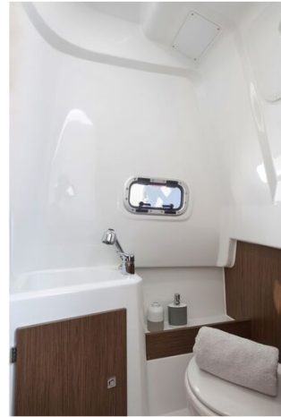
Jeanneau Cap Camarat 9.0 CC - toilet and shower compartment