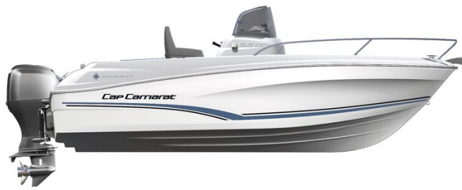
Jeanneau Cap Camarat 5.5 CC - diagram of side view