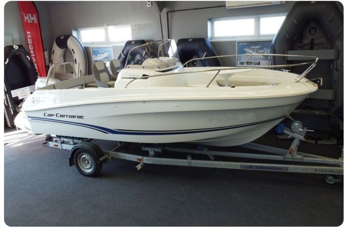
Jeanneau Cap Camarat 5.5 CC - starboard side