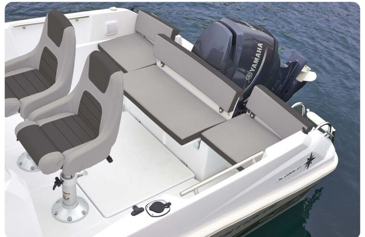
Jeanneau Cap Camarat 5.5 CC - sliding aft bench