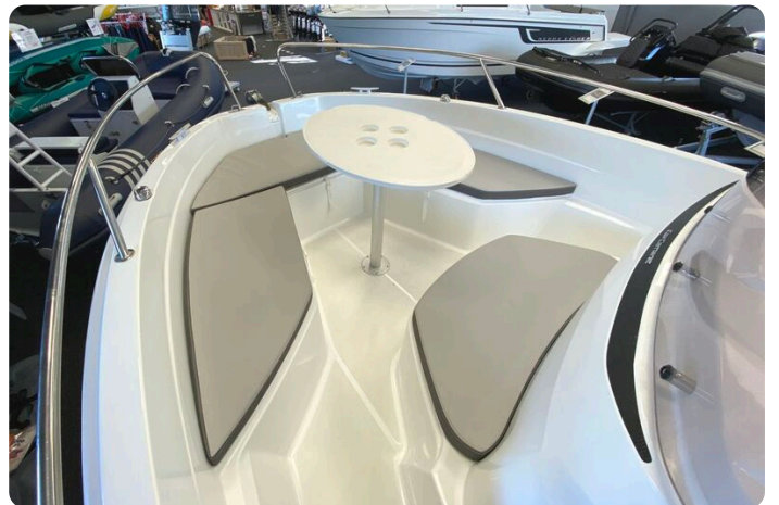
Jeanneau Cap Camarat 5.5 CC - bow seating with seating in-front of console