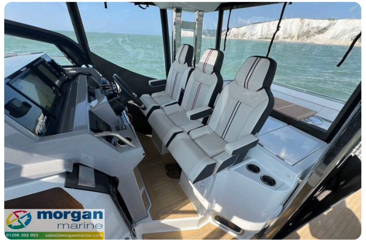
Jeanneau Cap Camarat 12.5 WA - engine controls and triple seats