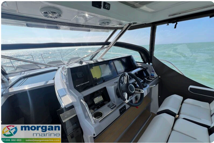
Jeanneau Cap Camarat 12.5 WA - helm position with great visibility