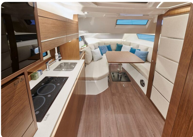
Jeanneau Cap Camarat 12.5 WA - galley in forward cabin / saloon