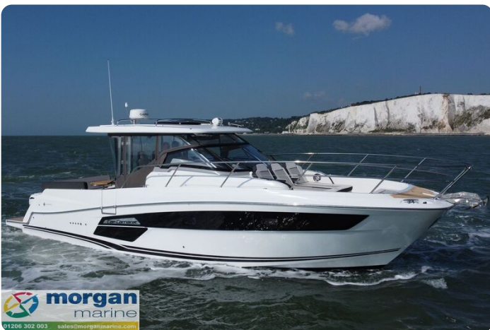
Jeanneau Cap Camarat 12.5 WA - bow from starboard side