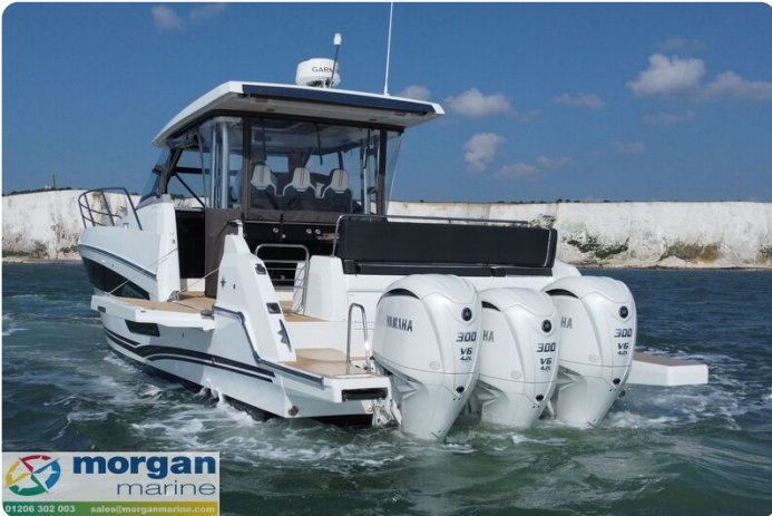
Jeanneau Cap Camarat 12.5 WA - view of transom from port side aft