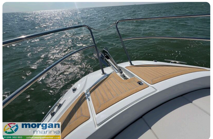
Jeanneau Cap Camarat 12.5 WA - anchor locker and pulpit rails