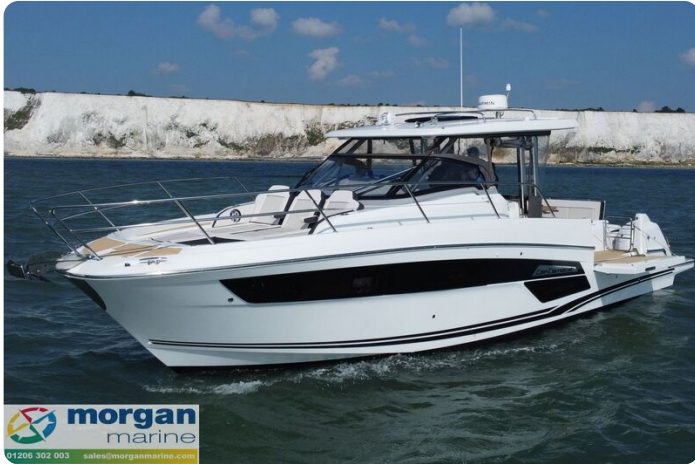
Jeanneau Cap Camarat 12.5 WA