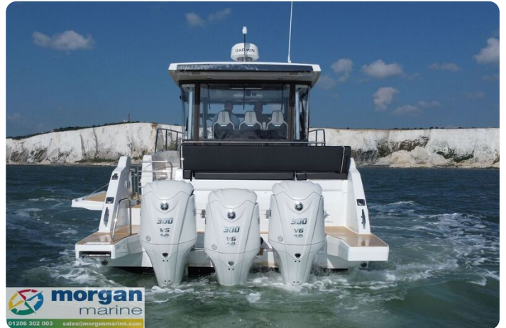
Jeanneau Cap Camarat 12.5 WA - transom with triple Yamaha outboards