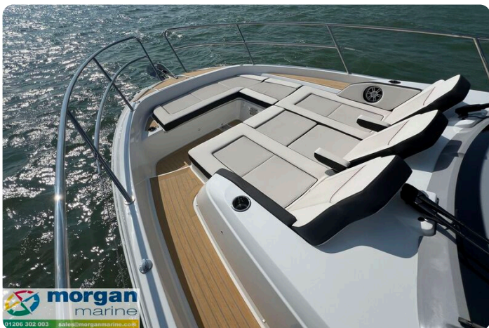
Jeanneau Cap Camarat 12.5 WA - side deck towards bow