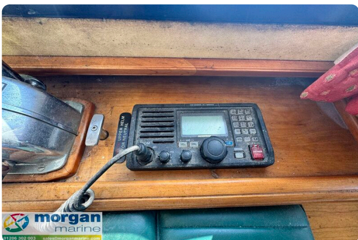
Humber 42 TSDY - plotter