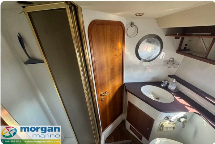
Humber 42 TSDY - sink