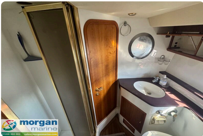
Humber 42 TSDY - sink