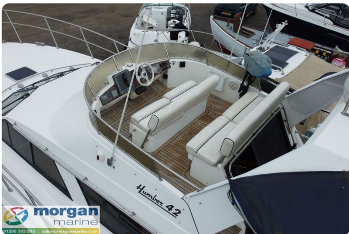
Humber 42 - pilot seat