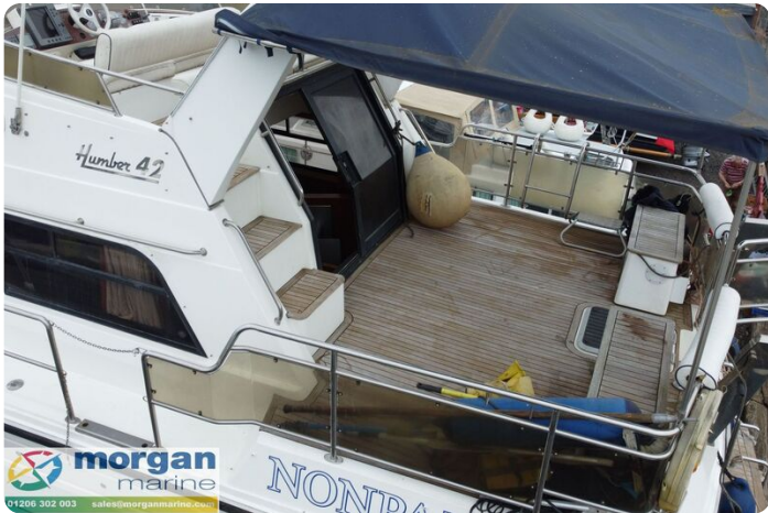
Humber 42 - fenders