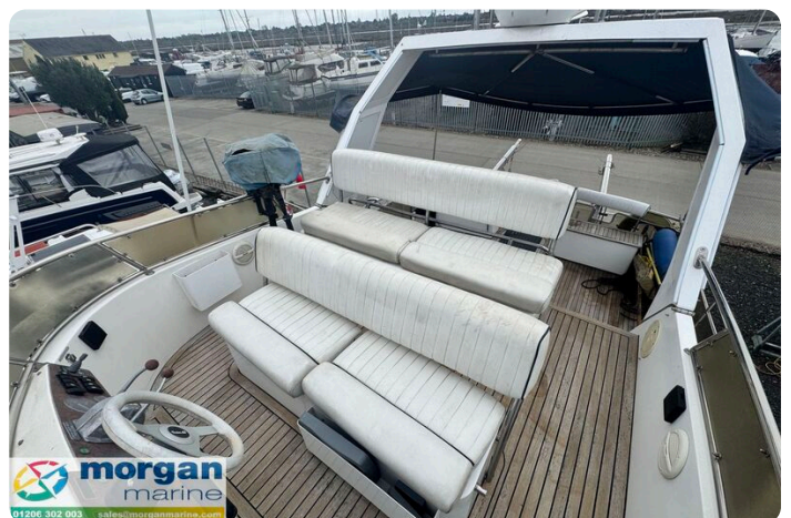
Humber 42 - fly seats