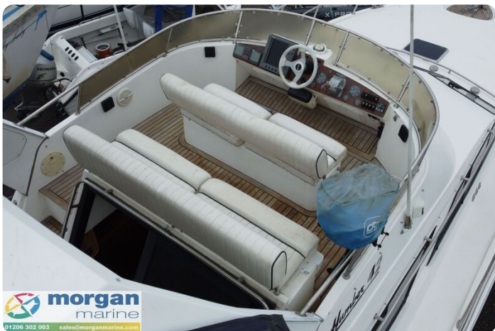
Humber 42 - fly seating