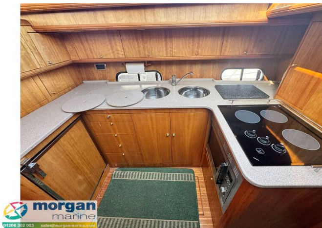
Humber 42 TSDY - sink