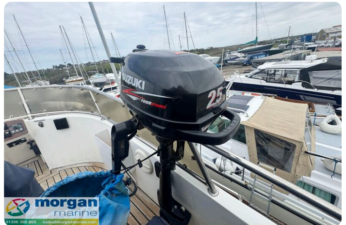
Humber 42 - aux