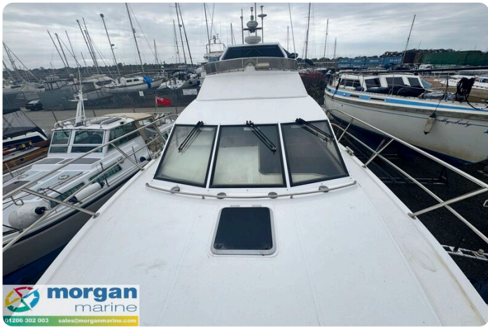
Humber 42 - wipers