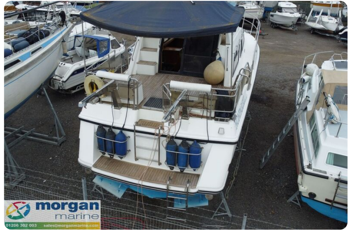
Humber 42 - back view