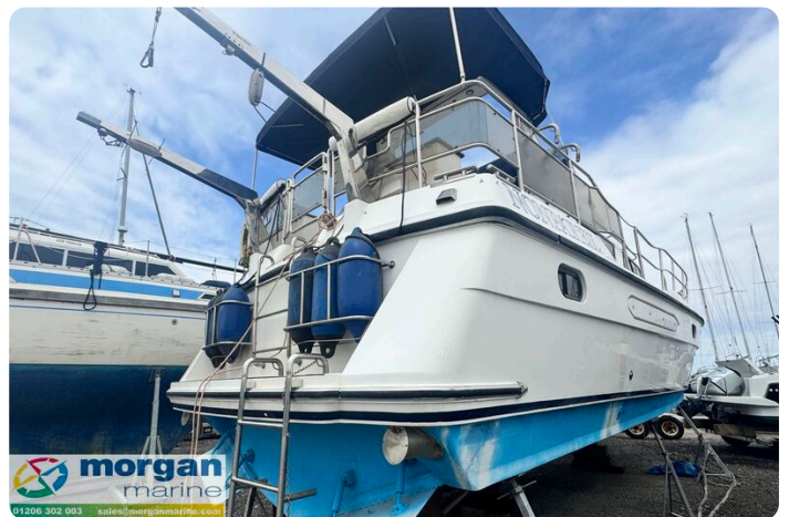
Humber 42 - ladder