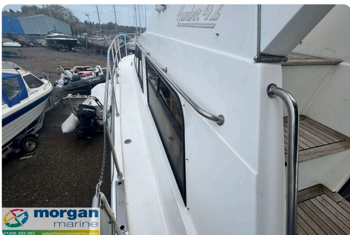
Humber 42 - walk way