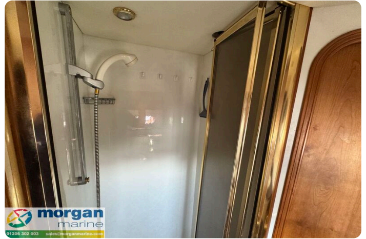
Humber 42 TSDY - shower