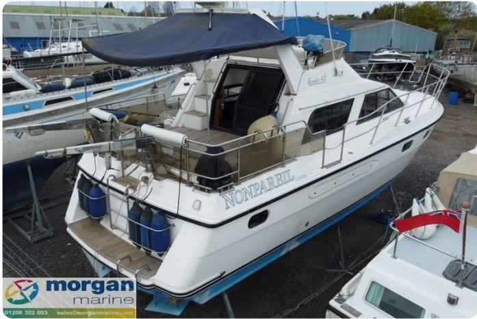
Humber 42 - fenders