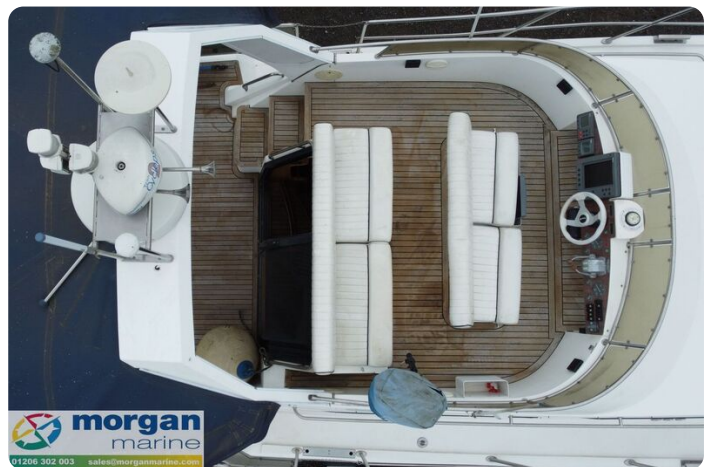
Humber 42 - seating