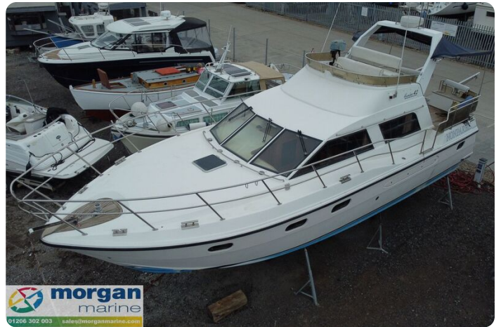
Humber 42 - side view