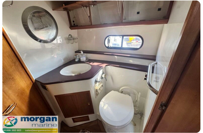
Humber 42 TSDY - toilet 1