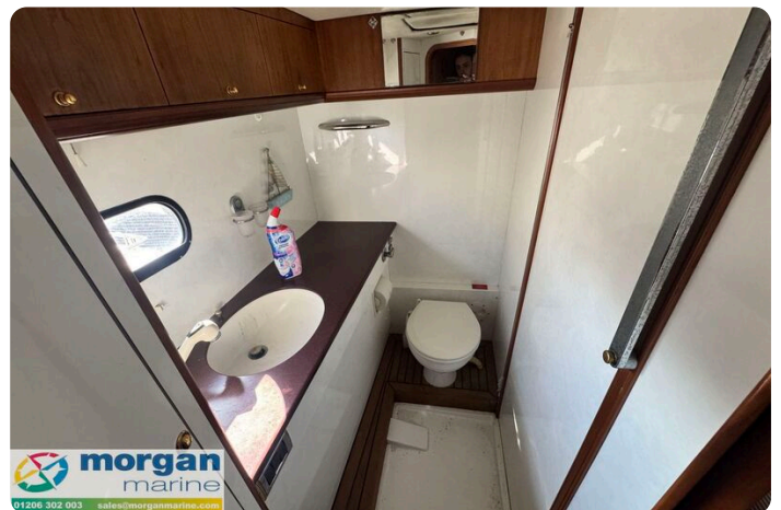
Humber 42 TSDY - aft toilet