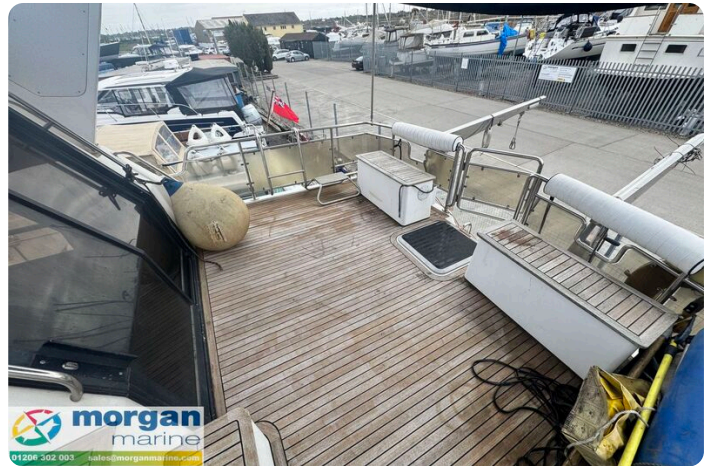
Humber 42 - deck