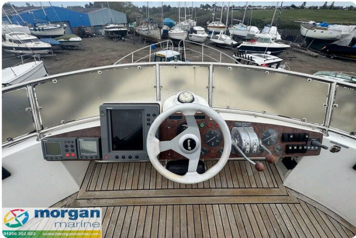
Humber 42 - fly wheel