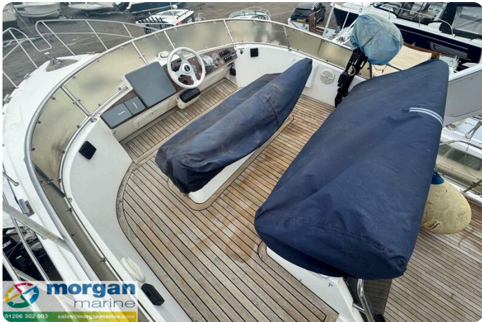
Humber 42 - fly covers