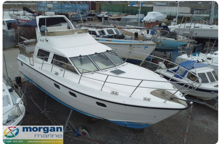
Humber 42 - top view