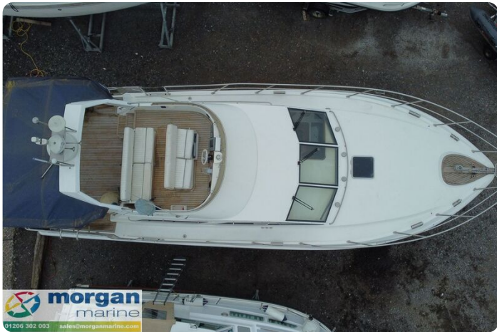
Humber 42 - top view