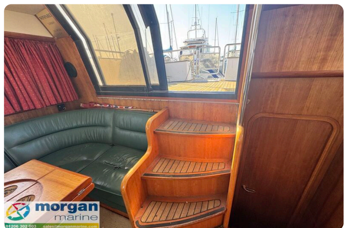
Humber 42 TSDY - saloon stairs