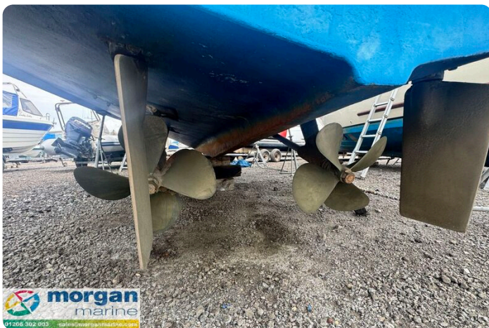
Humber 42 - props