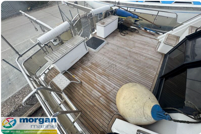
Humber 42 - decks