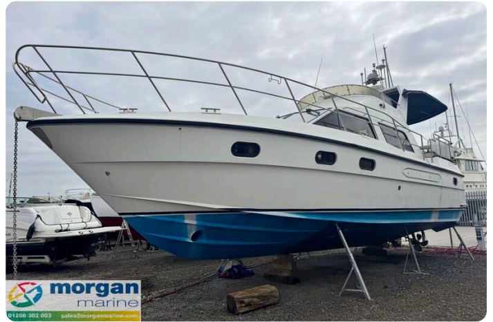
Humber 42 - side