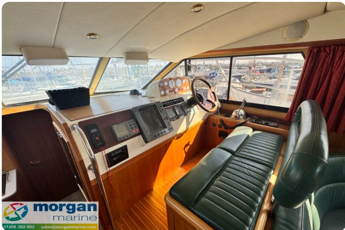
Humber 42 TSDY - pilot seat