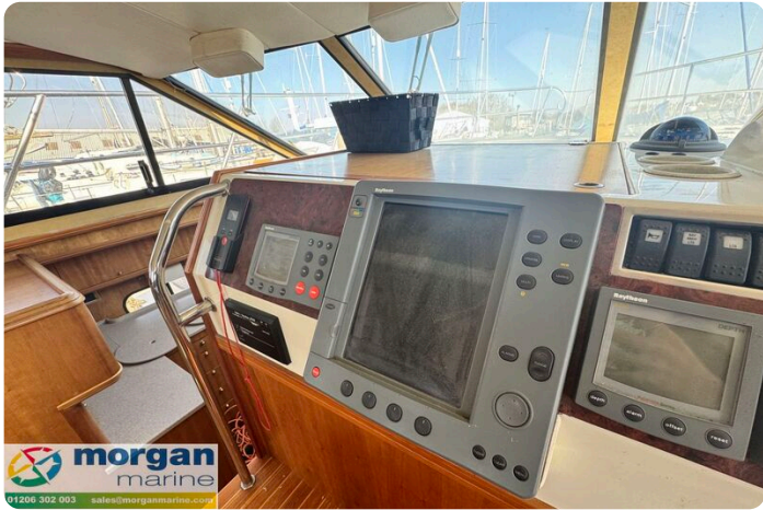
Humber 42 TSDY - plotter