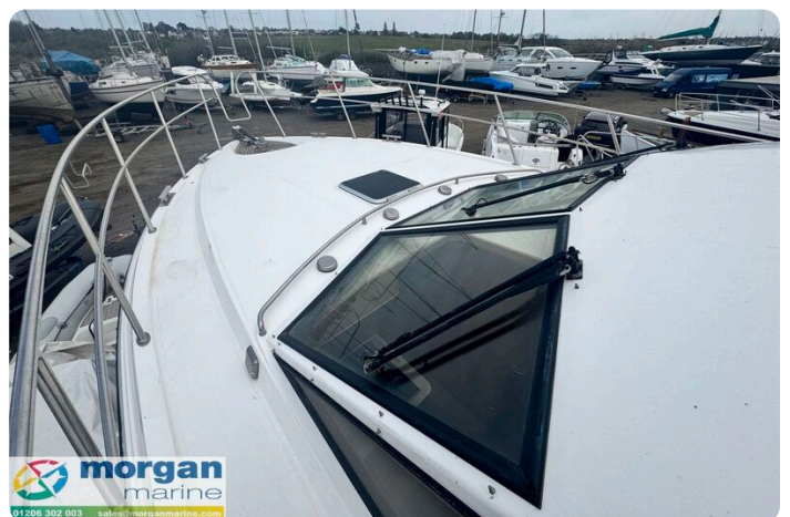
Humber 42 - windscreen