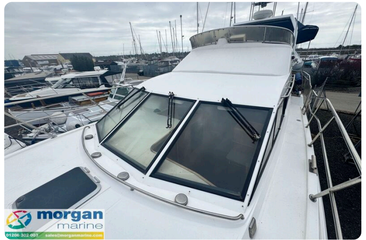
Humber 42 - wipers