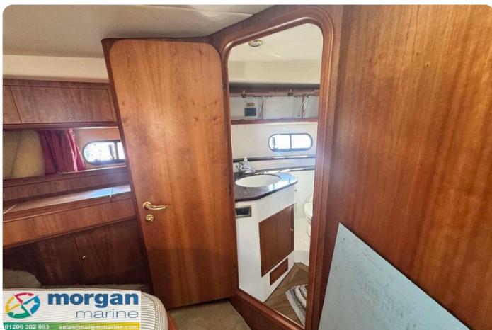
Humber 42 TSDY - door