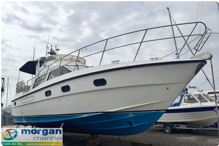
Humber 42 - railings