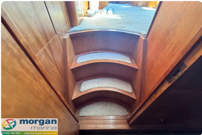
Humber 42 TSDY - steps up