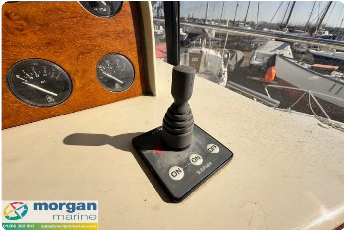
Humber 42 TSDY - bow thruster