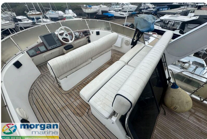
Humber 42 - fly