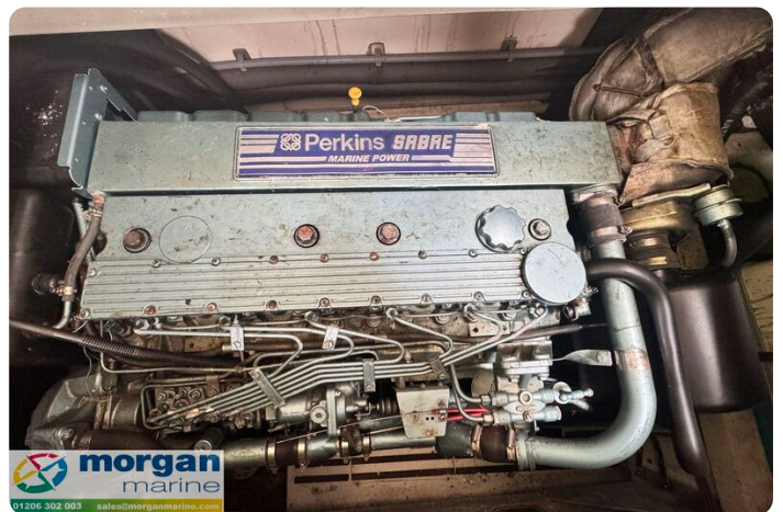
Humber 42 - close up engines