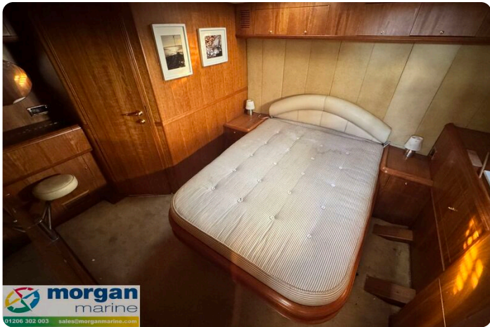
Humber 42 TSDY - AFT Berth