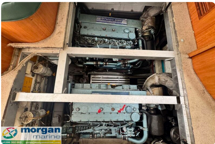
Humber 42 - engines