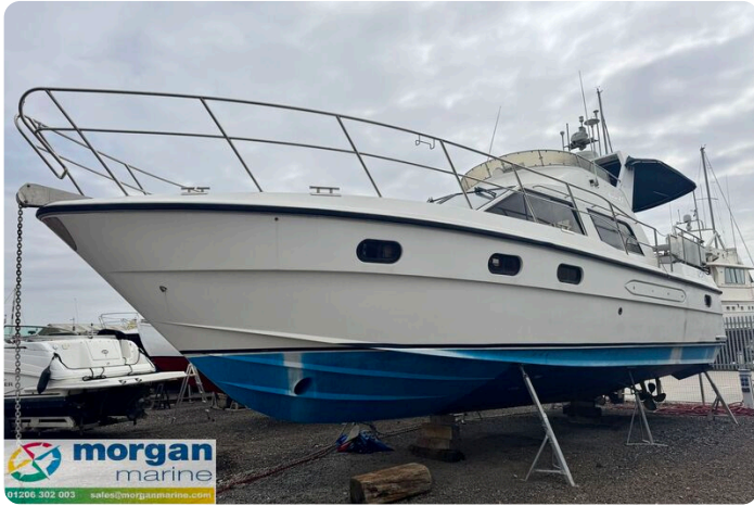
Humber 42 - Main