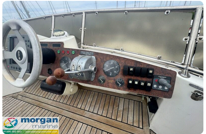
Humber 42 - fly controls