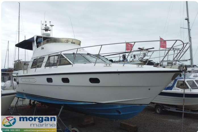
Humber 42 - side view