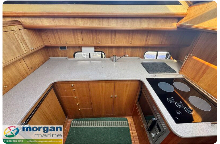
Humber 42 TSDY - galley