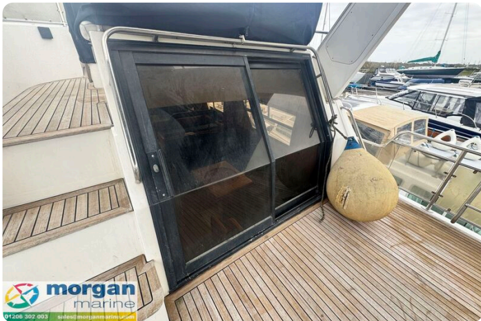
Humber 42 - doors