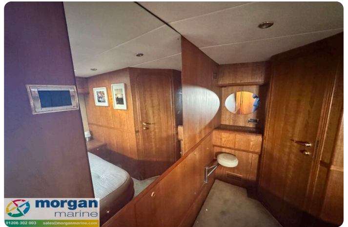
Humber 42 TSDY - aft mirror