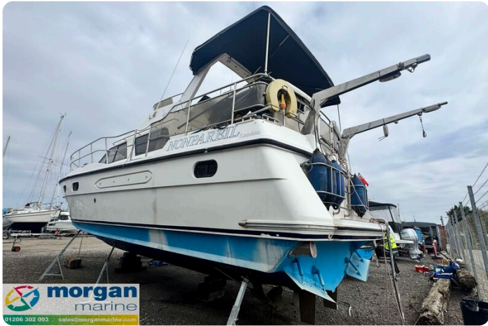
Humber 42 - back