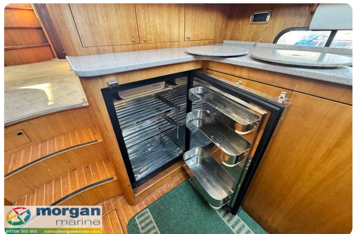
Humber 42 TSDY - fridge