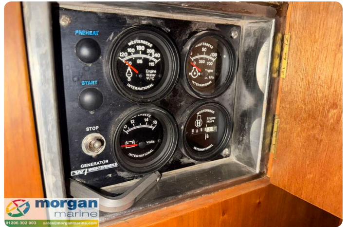
Humber 42 - gauges