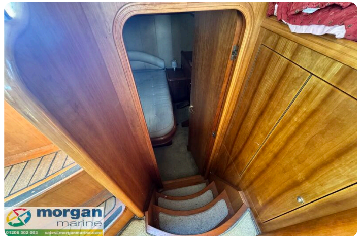
Humber 42 TSDY - steps down