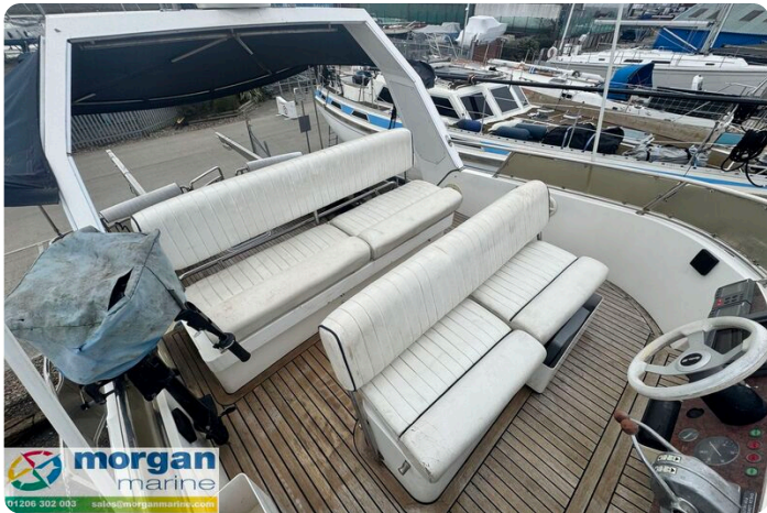
Humber 42 - flybridge