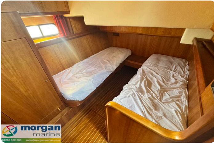
Humber 42 TSDY - twin berths