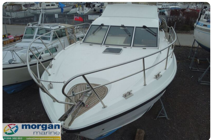
Humber 42 - bow