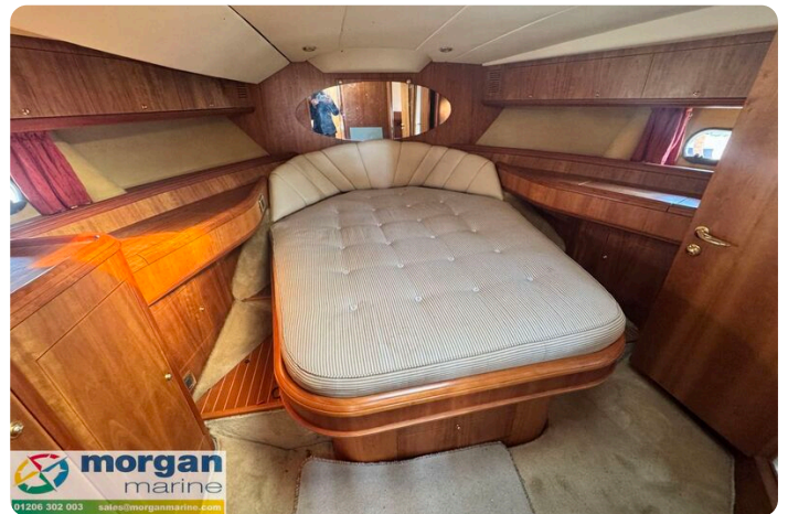
Humber 42 TSDY - main berth