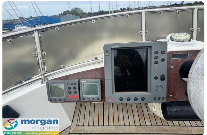
Humber 42 - fly plotter