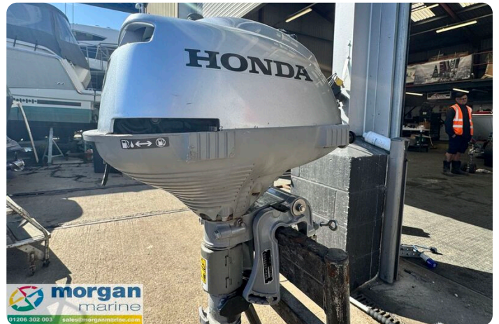
Honda BF2.3 Short Shaft - make