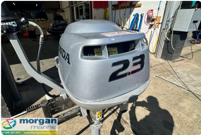
Honda BF2.3 Short Shaft - number