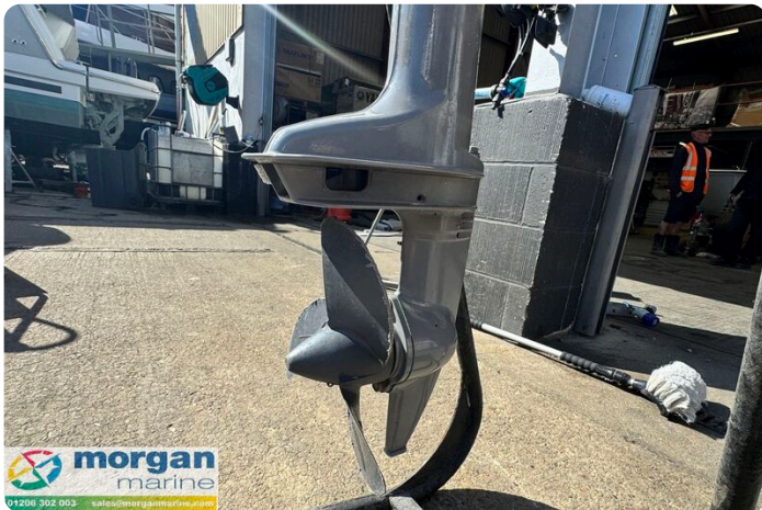
Honda BF2.3 Short Shaft - prop