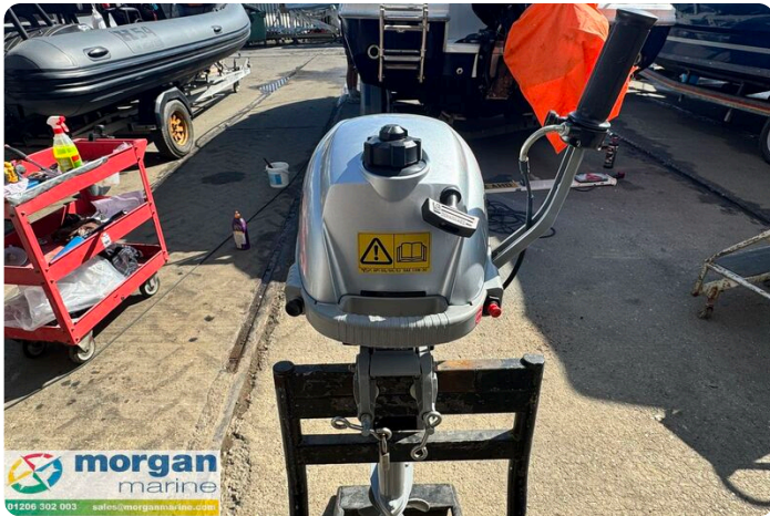
Honda BF2.3 Short Shaft - fuel