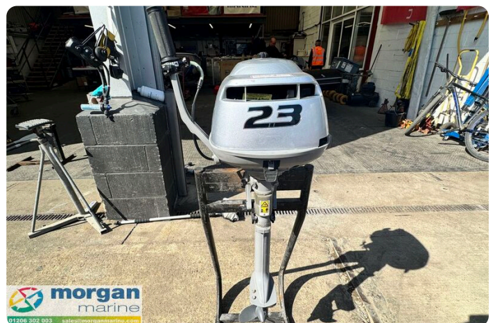
Honda BF2.3 Short Shaft - front