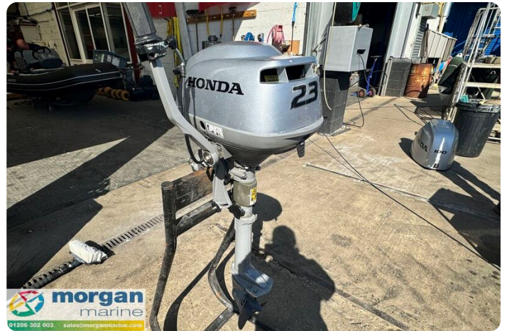
Honda BF2.3 Short Shaft - cowling