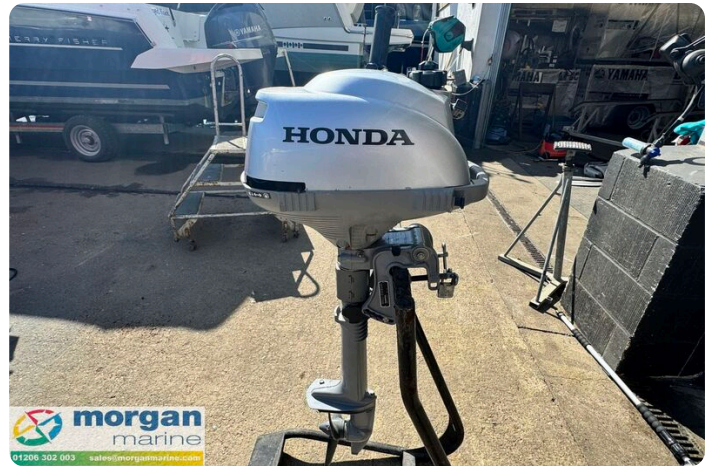
Honda BF2.3 Short Shaft - side view