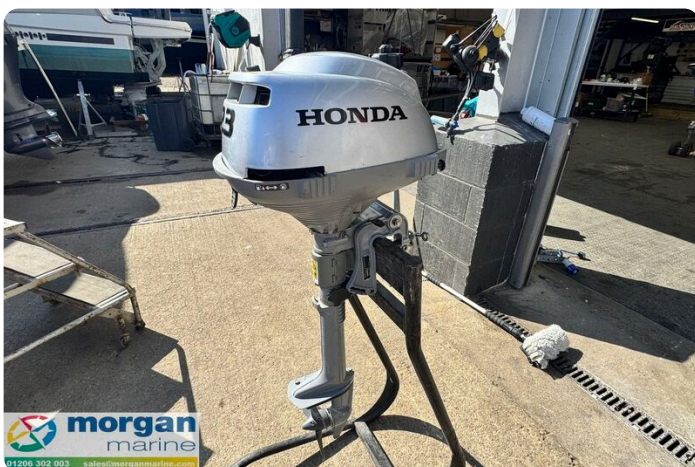
Honda BF2.3 Short Shaft - side view