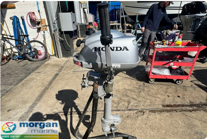
Honda BF2.3 Short Shaft - tiller