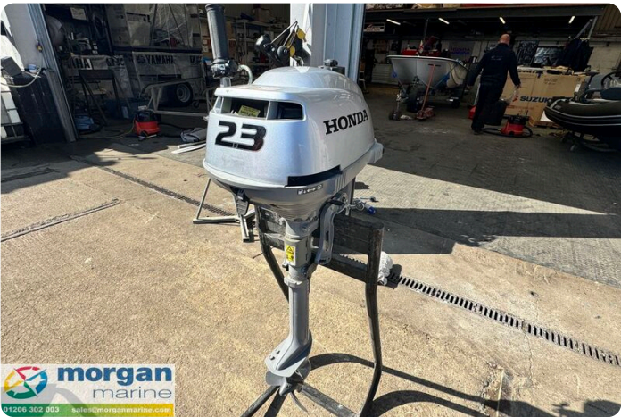
Honda BF2.3 Short Shaft - Main