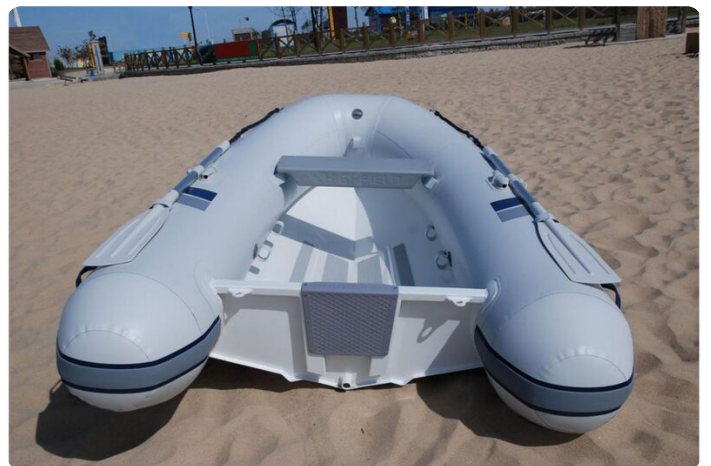
Highfield UL 340 aluminium RIB - overhead view