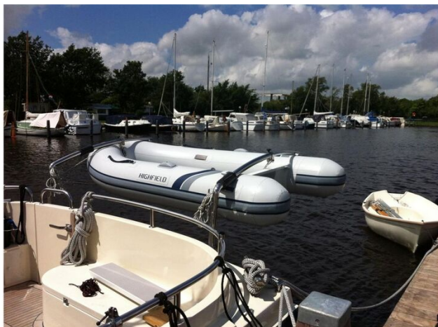
Highfield UL 340 aluminium RIB - on a larger boat