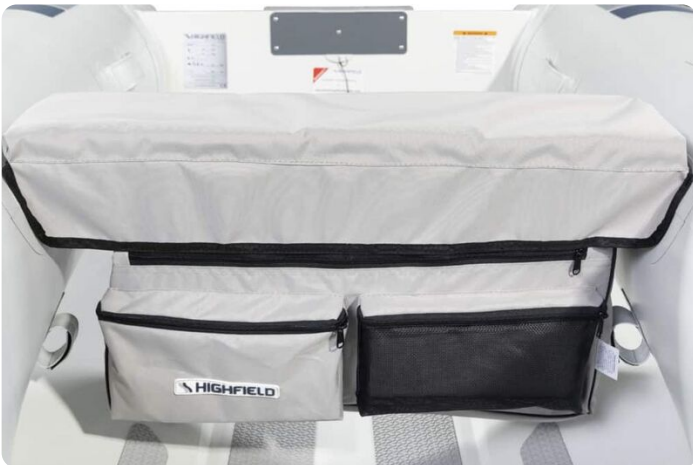
Highfield UL 340 aluminium RIB - storage