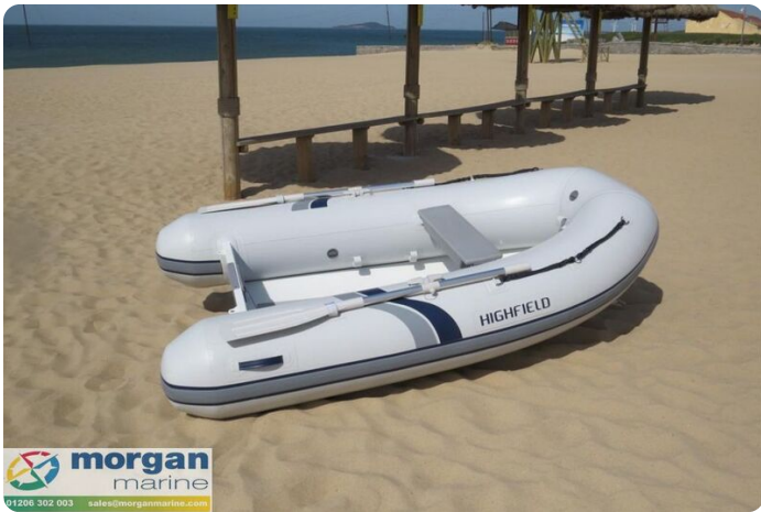
Highfield UL 340 aluminium RIB